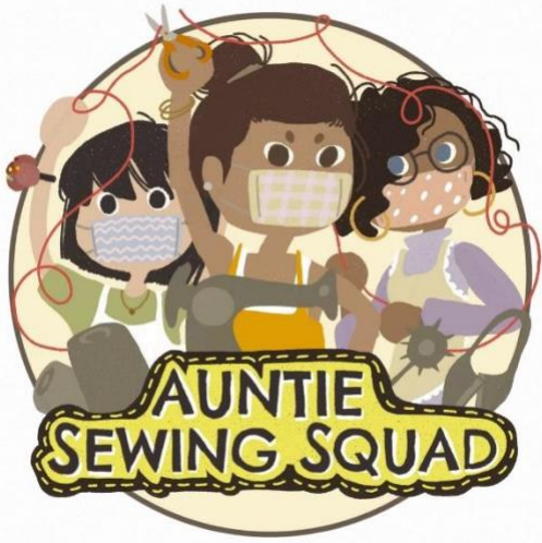
Figure 1. The Auntie Sewing Squad logo, from auntiesewingsquad.com 2

volunteers give time and labor to make masks to stop the spread of Covid-19, specifically in the most vulnerable of communities with no access to masks. We believe in a system of community care and having a direct connection to our recipients. We share resources on patterns, fabric and elastic. We pride our origins as a mostly WOC and QTNB group that celebrates the ability of all our Aunties to rise up and become the real leaders in this crisis.” 1