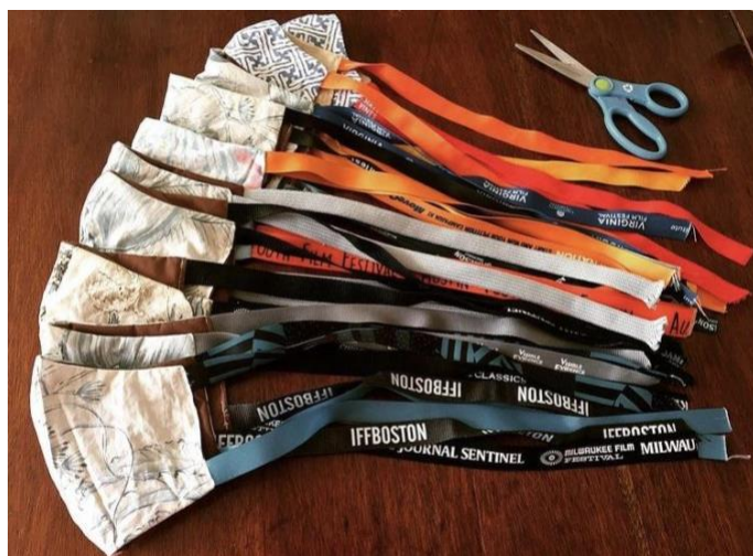
Figure. 3 An image from Valerie Soe's Instagram, showcasing the festival lanyards that she used to make masks. 36

In watching the four interviews and exploring the ways in which the interviewees have participated in the Auntie Sewing Squad and engaged in other forms of activism, I found three major themes. First, several of the interviewees noted that their work engages with mutual aid in a time of scarcity. At the beginning of the COVID-19 crisis, as several members discussed, there were PPE shortages in hospitals as well as elastic shortages as many scrambled to make cotton masks at home. Valerie Soe found a creative way to make masks without elastic by using lanyards from film festival badges (Fig. 3). She also reached out to friends and acquaintances on social media, asking them to send her lanyards until she amassed a large collection. 35