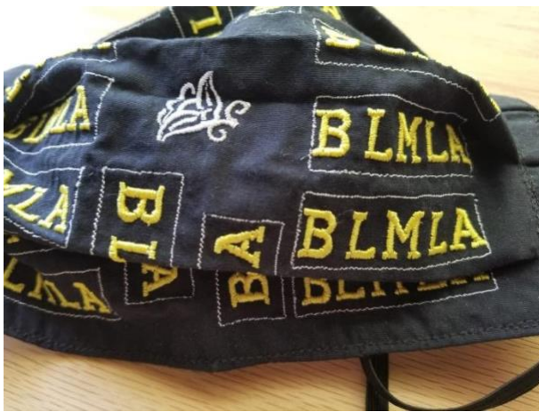
Figure. 4 A mask for Black Lives Matter Los Angeles, from the Auntie Sewing Squad website. 40