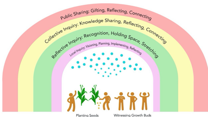
FIG. 2. Representation of the IELC circles and cycles of inquiry. Originally published in Activating Change in Indigenous Early Learning Systems: Community-based Inquiry and Strengthening Systems of Teaching and Learning for Children, Families, and Educators: A Co-Learning Report. Indigenous Early Learning Collaborative at the Brazelton Touchpoints Center: Boston, MA.

Working from this metaphor, I then sketched out a figure to further represent and better understand the process.