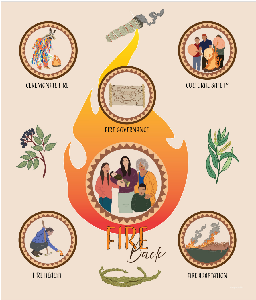
FIGURE 4. Dimensions of Fire Back: Ceremonial Fire, Fire Health, Fire Adaptation, Fire Governance, and Cultural Safety.

Fire Adaptation. To build adaptive capacity, we propose reframing cultural fire as a “relative,” not merely a “management” tool but an integral element of life and a longstanding tradition rooted in many Indigenous cultures across what is currently known as Canada and the United States, and throughout the world. Rather than being feared, cultural fire, when practiced according to Indigenous and natural laws without external agency processes, is a balanced approach that integrates Indigenous traditional ecological knowledge with land stewardship for the betterment of future generations.