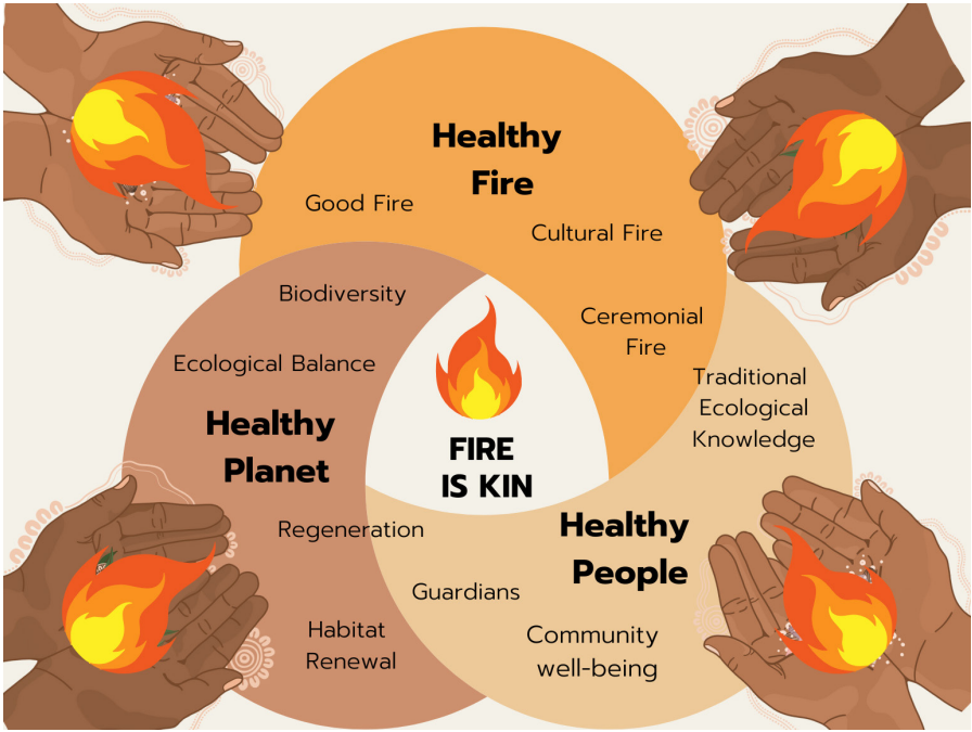
FIGURE 2. Interconnected kinship of people, fire, and planet fosters relational, ecological, and governance balance and Indigenous well-being.