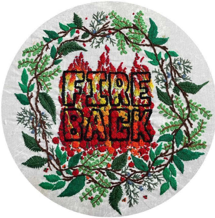
FIGURE 1. Fire Back artwork from season two of the Good Fire podcast.