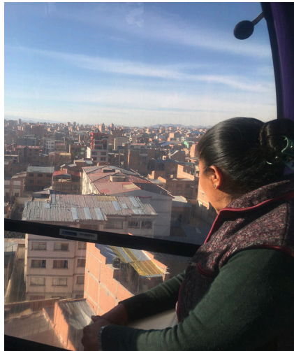
FIGURE 8. Riders look out over El Alto from within Mi Teleférico gondolas.