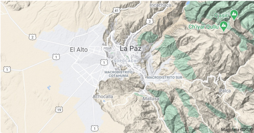
FIGURE 1. Topography of the El Alto–La Paz metropolitan region.