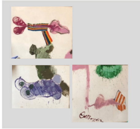
Fig. 9: Photographic reconstruction of Ocean Park Series , 1962, oil on canvas, dimensions unknown from three fragments: Untitled , 1962, oil on canvas, 32 x 38 in.; Untitled , 1962, oil on canvas, 40 x 40- \frac{1}{4} in.; Untitled , 1962, oil on canvas, 30 x 32 in., Laguna Art Museum. The extant fragments are in color, the actual size of the original canvas is indicated by the grey background.

Vittore Carpaccio's Hunting on the Lagoon , now in the J. Paul Getty Museum collection, is a model for the exhibition and conservation of single fragments, such as Ocean Park Series #5 and #6. There is no evidence about when, why, or who sawed the painting in half, but in centuries past, it was not uncommon for art dealers to cut large paintings into smaller pieces to maximize their profits (Norris 2007, 23). The division created two pictures of different settings, moods, and compositions. The top portion is a scene of six boats with archers hunting waterfowl in a Venetian lagoon. The only indication that something is amiss with the picture is a single, misplaced lily stem extending out from the lower left of the painting. Its presence is foreign to the waterscape, and its large size is out of proportion to the other objects in the background. In the original state of the painting, a vase—perched on a terrace balustrade of a Venetian palazzo on which two fashionable ladies sit—held the lily. The other half of the painting, now known as Two Venetian Ladies , is in