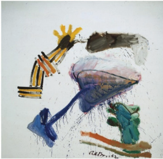
Fig. 2: John Altoon, Ocean Park Series #8 , 1962, oil on canvas, 81-½ x 84 in. (207 x 213.4 cm), Norton Simon Museum, Anonymous Gift. Copyright The Estate of John Altoon.

square—about 80 by 80 inches (Nordland 1984, 2). They are distinct in Altoon's oeuvre, diverging from the bold painterly marks which filled the entire canvas in his late 1950s and early 1960s abstractions. After this series, Altoon adopted a deeper-hued palette (forest green, blood red, deep purple, slate blue, or muddy brown) for the background of his next paintings, the Hyperion and Sunset series. Thus, the Ocean Park Series paintings are easily identifiable (see Figure 2).