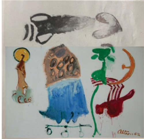
Fig. 7: Photographic reconstruction of Ocean Park Series #6 , 1962, oil on canvas, dimensions unknown, Laguna Art Museum. Extant fragment shown in color with the missing section in black and white.

fragments rather than autonomous pictures. Ocean Park Series #6 is a good example as the top third of the painting is lost. The missing fragment included a phallic-shaped “rocket”—two thick hash marks exude from the base like contrails—on the verge of touching its tip to a heart-shaped, vulva-like shape (see Figure 7).