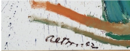
Fig. 3: John Altoon, Ocean Park Series #8 , 1962, oil on canvas, 81-½ x 84 in. (207 x 213.4 cm), Norton Simon Museum, Anonymous Gift (detail). Copyright The Estate of John Altoon.

Altoon further personalized the Ocean Park Series paintings by boldly scrawling his name and the date at the bottom of the canvas with the same gestural technique used in creating the objects in the paintings (see Figure 3).