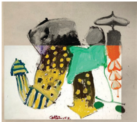
Fig. 8: Photographic reconstruction of Ocean Park Series #5 , 1962, oil on canvas, 78 x 79 inches. Extant fragment shown in color with the missing section in black and white.

yet are still visible—are present in every painting. The painted-over elements usually affect color not form. For example, in the autonomous painting Ocean Park Series #8 , the giant purple heart-shape in the center of the canvas was initially pink (see figure 2). Altoon then painted over parts of the pink with an earthen brown. In turn, he painted over the lower brown section with dark blue lines, swirls, and drips, and the upper section with white. The blue paint overlays the pink creating purple. In contrast, the missing piece of Ocean Park Series #5 diminishes the compositional color harmony. The slashed canvas is missing a large area of bright purple, a compliment to the yellow, which harmonizes with the secondary colors orange and green (see Figure 8).