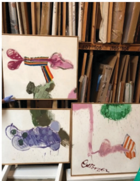
Fig. 1: Three Ocean Park Series fragments. Clockwise from top left, John Altoon, Untitled , 1962, 32 x 38 in.; Untitled , 1962, 40 x 40 ¼ in.; Untitled , 1962, 30 x 32 in.; Laguna Art Museum.