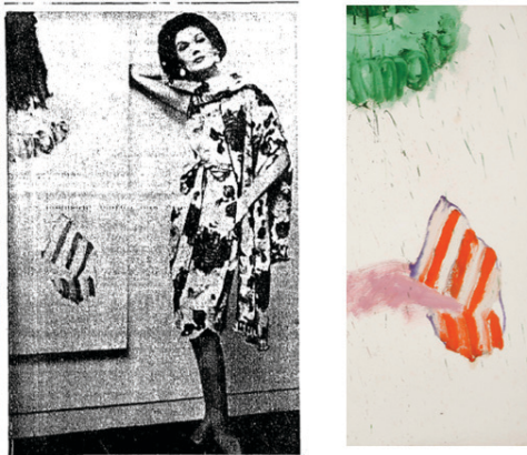
Fig. 4: Left: Philadelphia Tribune , 1963 showing Untitled ( Ocean Park Series ) painting at the Whitney Museum of American Art. Right: John Altoon, Untitled , 1962, oil on canvas, 40 x 40- \frac{1}{4} in., Laguna Art Museum (detail).

Three fragments of another painting also assist in determining when the series was damaged. The Whitney Museum of American Art included two paintings, Ocean Park Series #12 and another of unknown number, in the exhibition Fifty California Artists from October 23 until December 2, 1962. After closing at the Whitney, the exhibition traveled to three other museums. Some of the paintings exhibited at the Whitney did not travel to the other venues. Ocean Park Series #12 , which was illustrated in the exhibition catalog, went to all four venues. The other painting, identified as Untitled and not illustrated in the catalog, appeared in a photograph in the Philadelphia Tribune taken during the Whitney show (see Figure 4).