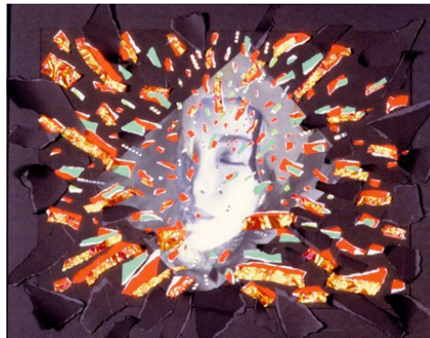
Figure 5: Patssi Valdez, Pyrah , c. 1980s. Mixed media photo collage, 22 x 28 inches, Collection of artist, http://www.ugeducation.ucla.edu/2018/07/19/art-gallery-publishes-ucla-undergraduates-research-on-artist-patssi-valdez/ .