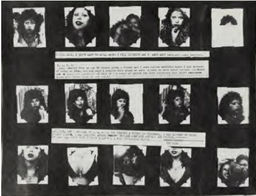
Figure 1: Patssi Valdez, Photo Booth Piece , c. 1975. Collage with photographs, 11 x 15 inches (Collection of artist). In Chicanismo en el arte . Los Angeles: LACMA, 1975, page 30. http://www.archive.org/stream/chicanismoenelar00losa_page/n29/mode/2up .