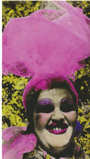
Figure 3: Patssi Valdez, Cyclona , 1982. Hand-painted photograph, 13 x 7.75 inches. Collection of Robert Legoretta, https://cruisingthearchive.org/gallery/pst-project-group-3-2/ .