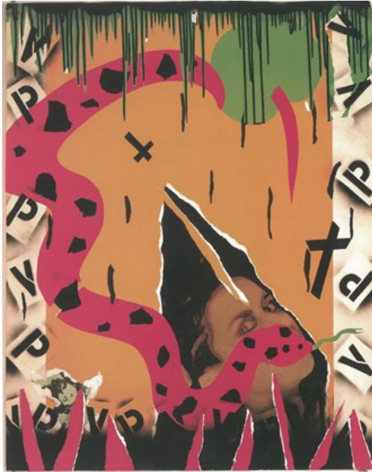
Figure 6: Patssi Valdez, Self-Portrait , 1987. Mixed media photo collage, 40 x 32 inches. (Anonymous collector). In Vexing: Voices from East L.A. Punk . Claremont: Claremont Museum of Art, 2008), page 6.