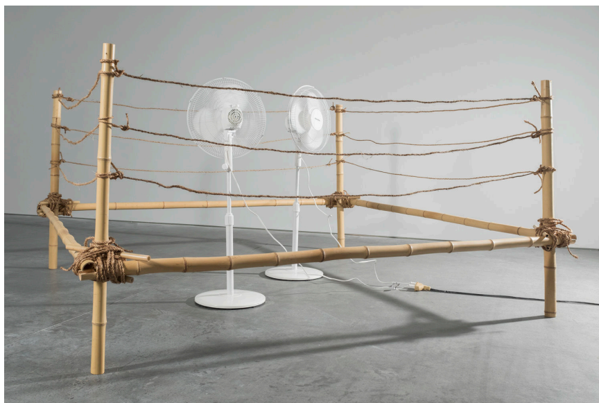
FOOTWORK, 2017, Bamboo, rope, twine, wire, fans, & wind, 8 x 8 x 4 feet.