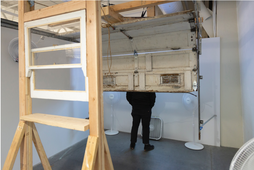
BIRD ON A STRING: AGAINST THE WIND(OW), 2019, Suspended garage door, window guillotine, fans, audio, and video projection, Dimensions variable.