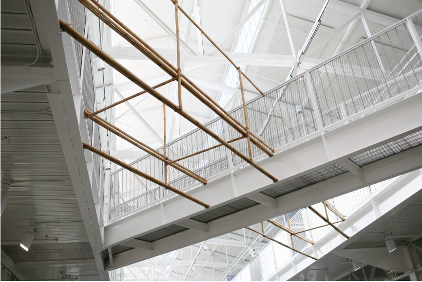
A COMPLETE CROSSING: FORT MASON PIER 2 HISTORIC RAILWAY & FOOTBRIDGE INTERSECTIONS, 2018, Site-specific bamboo, rope, and wire installation at Fort Mason Pier 2 SFAI Campus, 4 1/2 x 3 1/2 x 27 1/2 feet.