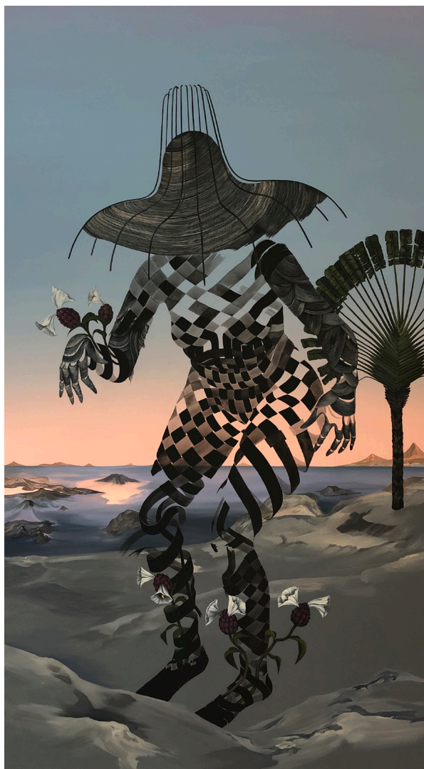
shroud (in threadbare light) 2 , 2020 40"x 72", Acrylic, pigment, gesso on canvas