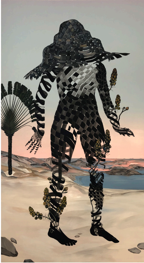
shroud (in threadbare light) 1 , 2020 40"x 72", Acrylic, pigment, gesso on canvas

In this reconfigured version of the malevolent character of Philippine folklore by Marigold Santos, the asuang ( aswang ) appears to be comprised of woven elements in a state of simultaneous unraveling and repair, while accompanied by fragments of flora that seem to emerge from the figure. Set in a landscape familiar yet surreal, and within a +me that suggests liminality and transition, shroud (in threadbare light) 1 evokes themes of sensorial memory, heritage, and resilience.