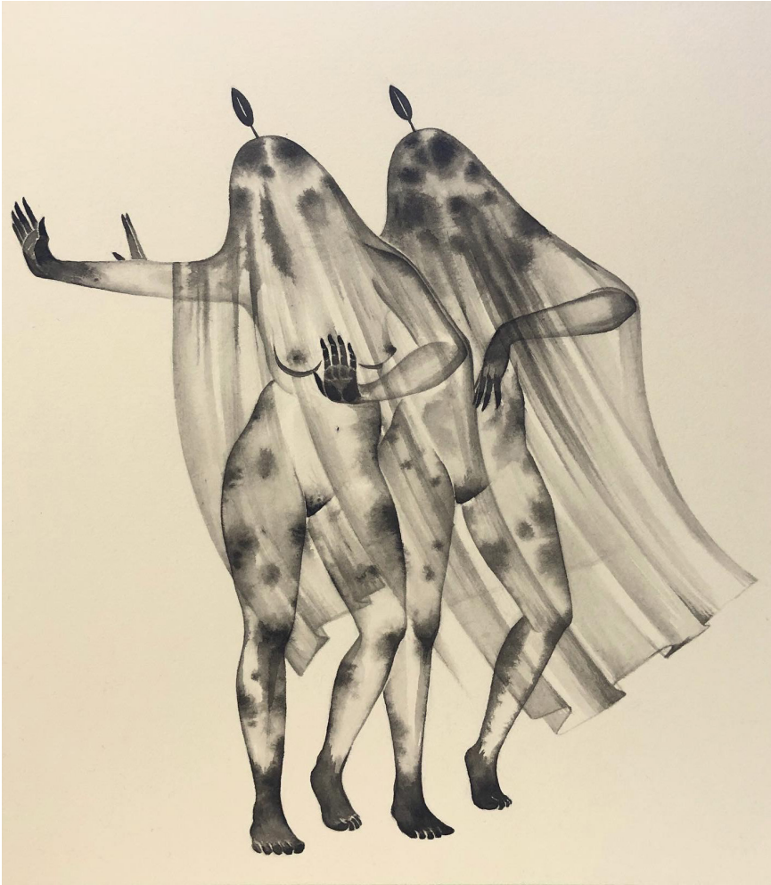
shroud (Itik Itik) II, 2020, 11"x 10", Ink on paper

These shrouded figures, another iteration of the aswang (aswang) character in Santos's work, appear to be in mid-dance. Performing a fragment of a traditional folk-dance, these gesturing bodies are in fluid motion as they enact a self-awareness built on vulnerability, heritage, transformation, and empowerment. Working with brush and ink on paper, the drawings within this series embrace the inherent qualities of ink as Santos plays with formal and conceptual notions of porousness, transparency, and permanency.