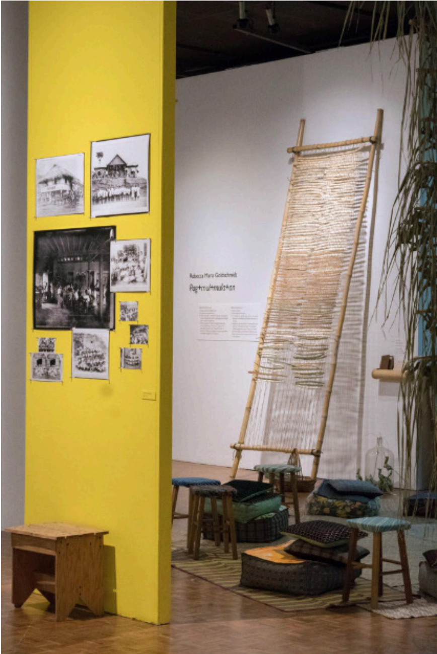
Installation view of large scale bamboo and marrungay (moringa) pod weaving; a yellow divider wall with archival photographs of classes of schoolchildren in American schools in the Philippines in the early 20th century.