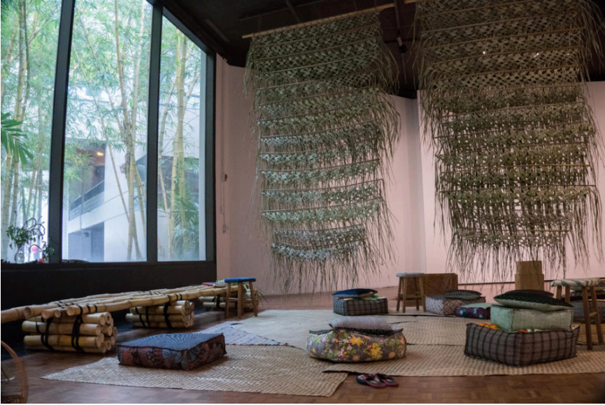
Installation view of Pag+mul+mula+an at University of Hawaii at UH Mānoa Art Gallery, March 2020.