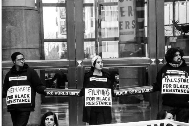
Activists with the Third World Resistance coalition blockading the Oakland, California Federal Building on January 15, 2015 in solidarity with the Black Lives Matter movement.

such sites and a broader national consciousness. As a result, we are often disregarded as agents of transformative change. Meanwhile, our unique histories, experiences, and aspirations for the future too often have been defined by others, labeled as “Little Brown Brothers” at the turn of the 20th century and more recently as “Junior Partners” to White folks in the reproduction of Black suffering. 1 It is in this peripheralized place that U.S.-born children of Filipino/as are redefining themselves as Filipinx.