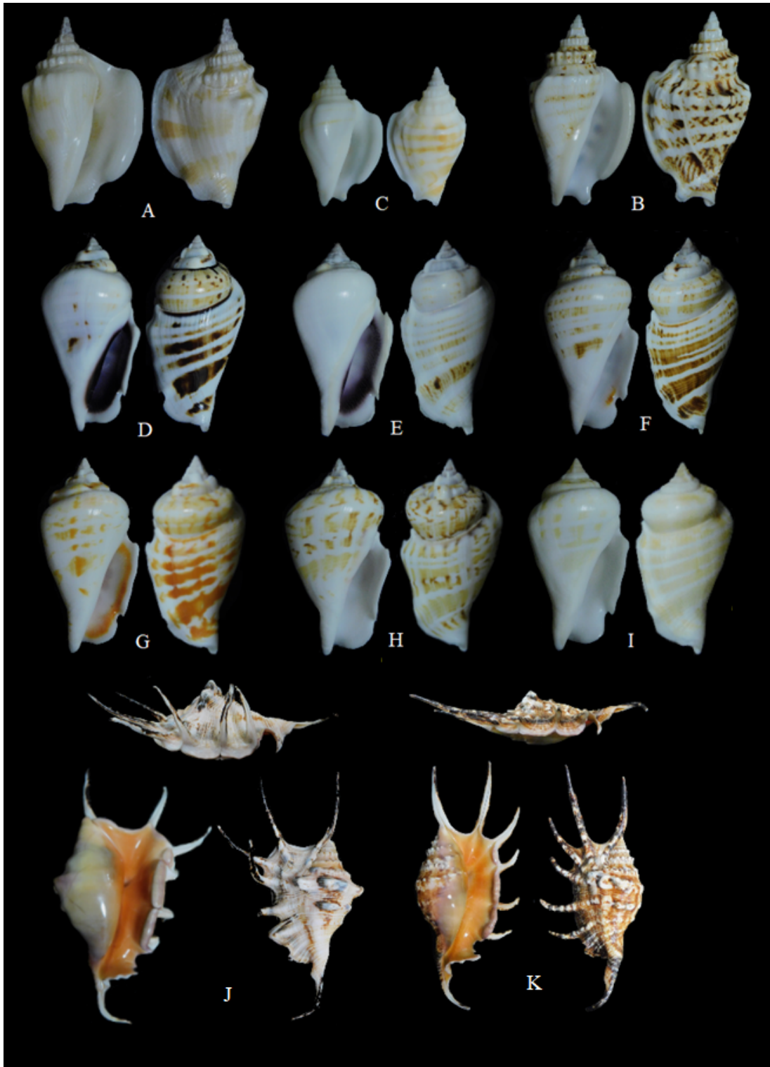
Figure 4. Green Island Strombidae (gender, length, not to scale) continued: A) Dolomena hickeyi (dead, 42.0 mm); B) Ministrombus variabilis : a typical form (dead, 40.5 mm); C) Ministrombus athenius : a typical form (dead, 32.5 mm); D) Gibberulus gibbosus : the typical purple shell with dark aperture (male, 38.5mm); E) G. gibbosus : the typical purple shell with dark aperture (female, 42.5 mm); F) G. gibbosus : an atypical colour form (female, 44.5 mm); G) G. gibbosus : an atypical colour form (male, 38.5mm); H) G. gibbosus : an atypical colour form (male, 34.5 mm); I) G. gibbosus : the typical orange shell with white aperture (male, 35.0 mm); J) Lambis lambis : a typical form (female, 122.0mm excluding spines); and K) L. lambis : a typical form (male, 67.5 mm excluding spines).