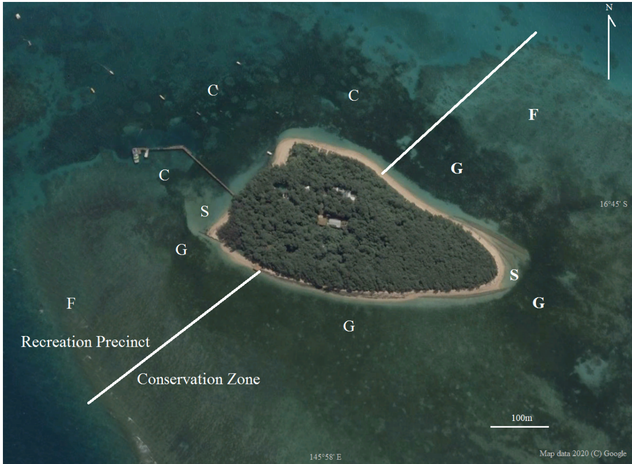
Figure 2. The location of Green Island current management zones and the dominant benthos: C – deep water corals and sand with sporadic small seagrass patches not exposed at low tides; F – Reef flats consisting of coral and coral rubble with sand patches exposed at low tides; G – areas dominated by sand and seagrass exposed at low tides; S – sandy areas exposed at low tides (Base image derived from https://google-earth.en.softonic.com/ ; Accessed on 2020-01-10).