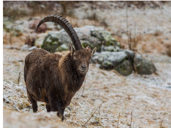
Figure 3. Alpine ibex with a just broken and fallen horn (photo shooting date 07.02.2017).