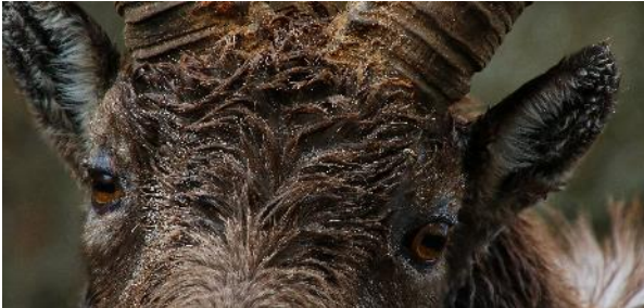
Figure 6. Alpine ibex affected by Trombicula autumnalis (photo shooting date 24.11.2019)

Several photographs also highlighted animals affected by Trombicula autumnalis (Shaw, 1790) (Fig. 6).