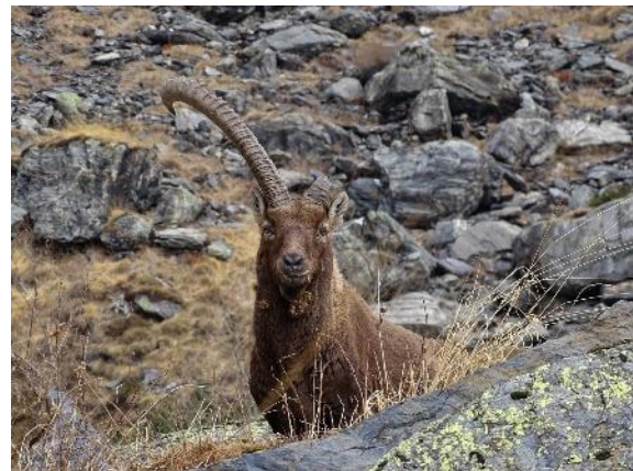
Figure 4. Alpine ibex (A.I. 0089) with a broken and fallen horn (photo shooting date 28.02.2017).