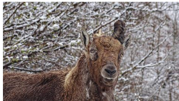
Figure 5. Alpine ibex (A.I. 0089) with both broken and fallen horns (photo shooting date 03.02.2019).

Photos turned out to be of support in monitoring the health of the ibex population. For example, figure 3 highlights an Alpine ibex