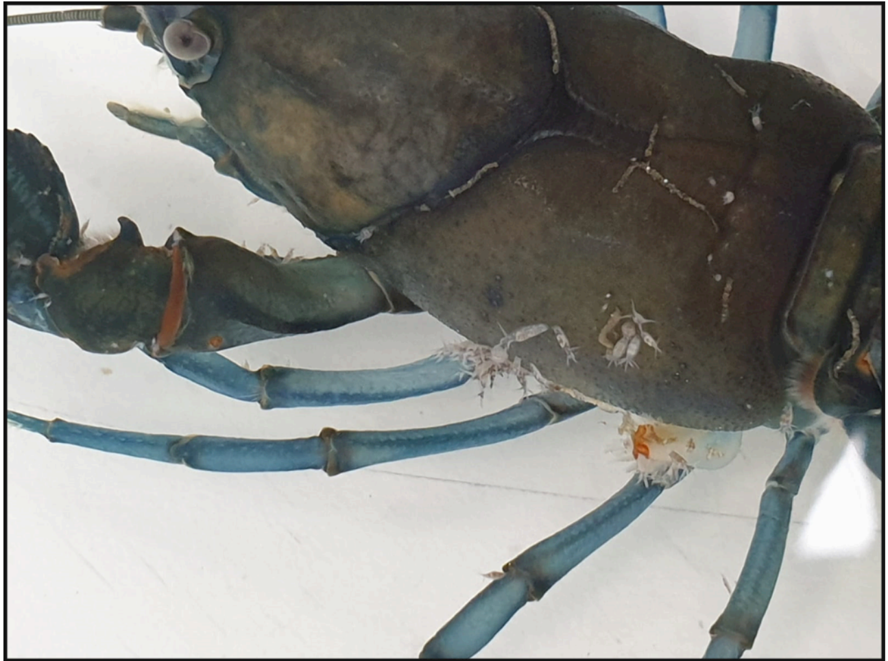
Figure 1. The temnocephalan flatworm Temnosewellia minor recorded on Cherax destructor in a crayfish farm, in Sicily (Italy).

the extent of the impact on both introduced and native hosts is often poorly known (Kelly et al. 2009). In the last decades, several alien crayfish species have invaded European inland waters (Aquiloni et al. 2010; Weiperth et al. 2020, and references therein), often outcompeting native species. The most recent introduction in Italian inland water is that of Cherax destructor Clark, 1936 (Scalici et al. 2009; Deidun et al. 2018), whereas the congeneric Cherax quadricarinatus (von Martens, 1868), to date confined to aquaculture farms in Italy (Chiesa et al. 2015), is already reported for natural water bodies in the neighbouring Malta (Deidun et al. 2018). Although it is well-known that parastacid species are often hosts of ectosymbiotic temnocephalan flatworms (Damborenea and Brusa 2009), to date only little evidence of co-