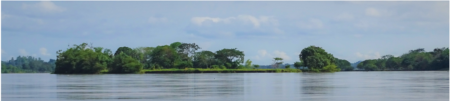
Figure 3. Photograph of one of the floating islands on the Magdalena River during the December 2016 fieldtrip. As a scale guide, the raft is about 80 m across. Also note that O’Dea et al. (2016) includes video footage from 2010 of similar scale rafts travelling down the Chagres River in Panama.