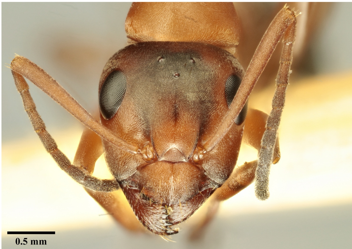
Figure 3. Formica clara worker from the southernmost site of its Italian distribution in Sicily: lateral view (above) and head view (below).