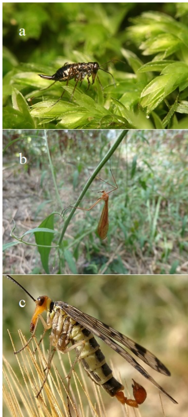
Figure 1. Representative scorpionflies: a) the boreid Boreus hyemalis (Linnaeus, 1767), b) the bittacid Bittacus italicus (Müller, 1766), c) the panorpid Panorpa annexa McLachlan, 1869.

A simplified version of the checklist is given in Supplementary File S1.