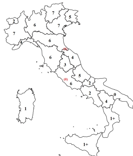
Figure 3. Regional units of Italy, San Marino Republic and Vatican City, used for the checklist, with number of species of Mecoptera for each unit (San Marino Republic and Vatican City in red colour). The + sign in Calabria and Sicily means the doubtful presence of a second species.