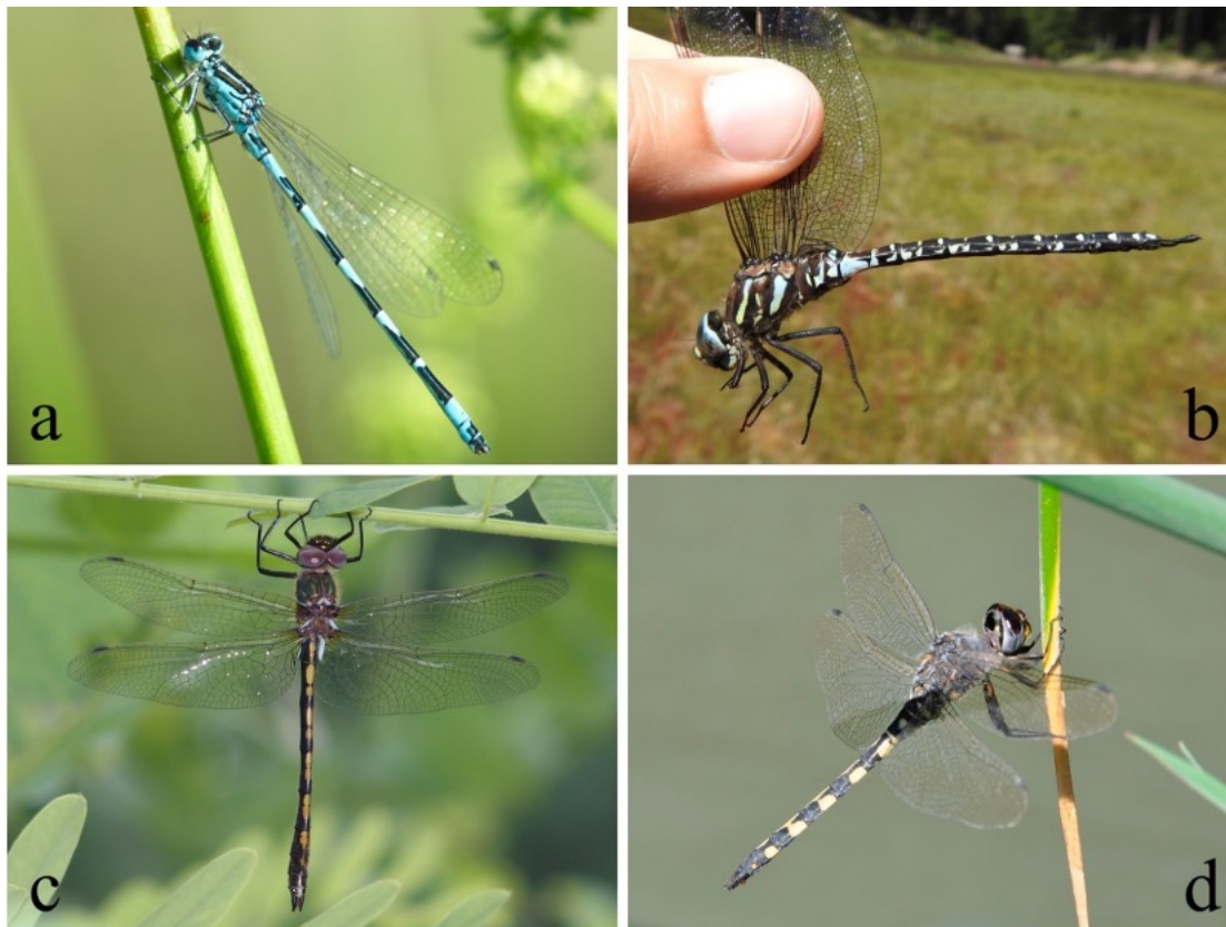
Figure 1. Representative Odonata: a) Coenagrion castellani – Trevi (PG), 03/06/2022 (foto G. La Porta); b) Aeshna subarctica – Altavalle (TN), 09/08/2019 (foto G. Assandri); c) Oxygastra curtisii – Calcio (BG), 11/06/2018 (foto F. Leandri); d) Zygonyx torridus –S. Caterina Menfi (AG), 14/08/2014 (foto F. Landi).

the European odonatological fauna. Two species, namely the damselfly Coenagrion castellani (formerly known as C. mercuriale castellanii ) and the dragonfly Cordulegaster trinacriae , are endemic of Italy, while Ischnura genei is a subendemic species due to its presence in the French island of Corsica. Compared to the previous checklist (Utzeri and D'Antonio, 2005), 3 species ( Ischnura graeelsi , Cordulegaster picta , Epithea bimaculata ) should not be considered part of the national fauna anymore. Further occurrences of the species in national territory not included in the Supplementary file S2 will be included in future updates of the checklist. It is the case of Aeshna subarctica in Veneto, Cordulegaster bidentata in Molise, Somatochlora flavomaculata in Puglia, and Trithemis annulata in Piemonte, just to name a few of the cases of which the authors are currently aware.