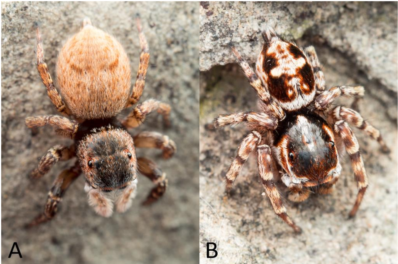
Figure 1. Habrocestum graecum , habitus (A-B). A: adult female; B: adult male.

by di Caporiacco. On the other hand, H. latifasciatum is recorded in Puglia (di Caporiacco 1951, Kritscher 1969, Hansen 2005), in South-Eastern Italy, showing an interesting trans-Ionian distribution. Trans-Ionian and trans-Adriatic distribution patterns have been observed for vertebrate (Blain et al. 2016) and invertebrate taxa (Gridelli 1950, di Caporiacco 1951, Jesse et al. 2009, Çiplak et al. 2010, Korábek et al. 2014, Schifani and Alicata 2019, Hinojosa et al. 2021). This is most probably a result of quaternary land bridges connecting Southern Italy with the Balkans and/or of the Miocenic fragmentation of the Aegeis land (Schifani and Alicata 2019). In the present work, we report about the first observation of the once Greek endemic spider species Habrocestum graecum Dalmas, 1920 in Italy and provide the first genetic characterization of the species via DNA barcoding (Figure 1).