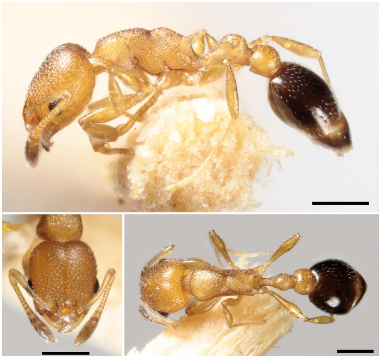
Figure 2. Cardiocondyla obscurior Wheeler, 1929 worker collected in Crete. Scale bar: 0.25 mm.

Emery, 1869, both considered as alien species by Salata et al. (2020). The identity of the populations attributed to C. elegans should be checked in the future as Crete falls much closer to the native range of C. dalmatica Soudek, 1925, a recently recognized cryptic sister species (Seifert 2023b). In comparison to these species, C. obscurior differs in its arboreal habits, and despite not having been reported as an ecological threat anywhere so far, its interactions with native ants and other organisms should be monitored.