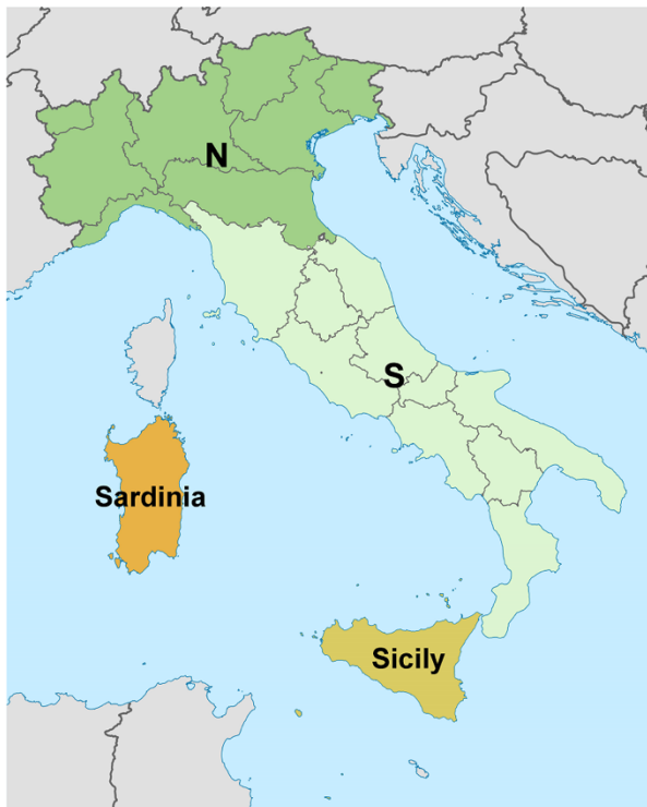
Figure 1. Study area: Italy is divided into four macro-regions following Faraci & Rizzotti Vlach (1995) and the general framework of the project for a new Checklist of the Italian Fauna.

The checklist contains 22 out of the 62 columns that are available for all animal groups. The first columns are dedicated to the systematic classification of each species, from phylum rank to family/subfamily, genus/sub-genus, species and subspecies, including the authorship of the last two. They are followed by two columns describing its status as either endemic (e), subendemic (s), introduced (a) or cryptogenic (?). Finally, two columns contain references for the nomenclatural or distribution changes compared to the checklist by Faraci & Rizzotti Vlach (1995) or to the partial updates by Bacchi & Rizzotti Vlach (2005, 2007) and Carapezza & Faraci (2005, 2007).