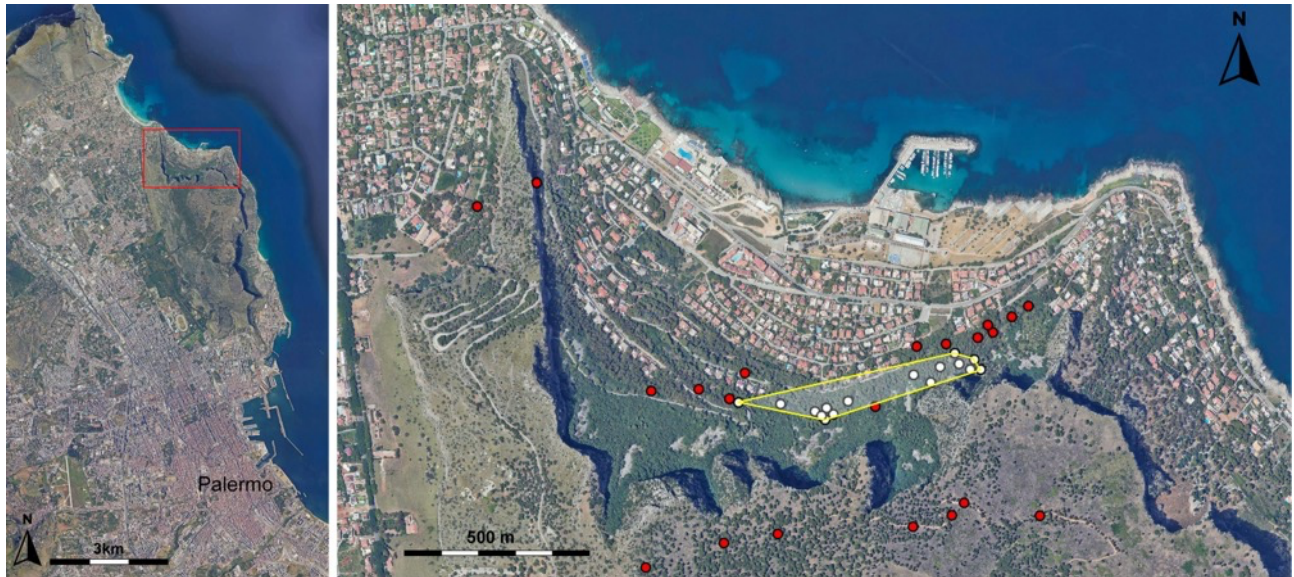
Figure 3. Detailed distribution of the inspected spots. White dots = spots where E. europaea was observed; red dots = spots without E. europaea findings; yellow line = Minimum Convex Polygon calculated on the E. europaea observations.

1758) (1 gecko/11.5 trees). For the leaf-toed gecko we estimated, within the area where it was found, approximately 1 gecko/6 trees. In two cases E. europaea was found on the same tree with other geckos, once with T. mauritanica and once with H. turcicus .