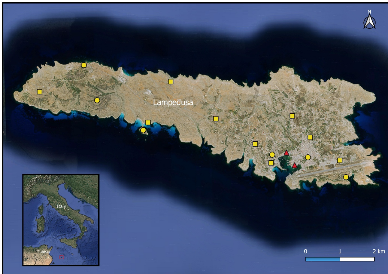
Figure 2. Distribution of sampled localities in Lampedusa and Conigli islands. Yellow dots refer to Tarentola fascicularis/deserti previously published records (Harris et al., 2009b; Rato et al., 2010, 2012; Stöck et al., 2016); yellow squares refer to T. fascicularis/deserti novel records; red triangles refer to T. mauritanica novel records.