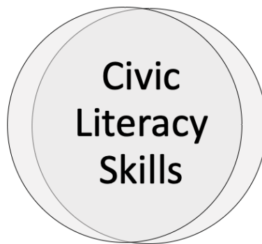
Figure 3. Classroom instruction inextricably links literacy and civic instruction.