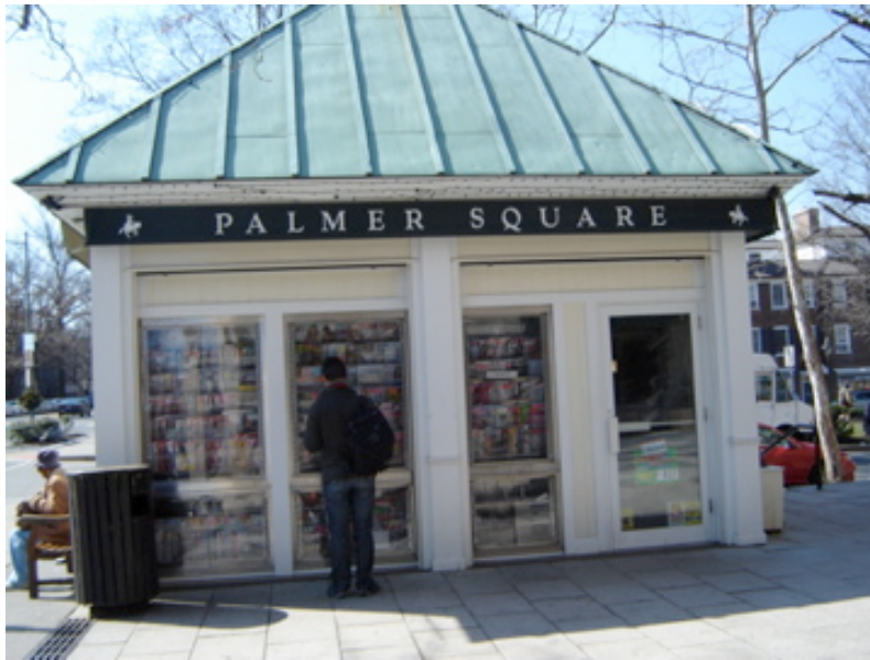
Figure 3: Community Hubs as Fractures of Habitus