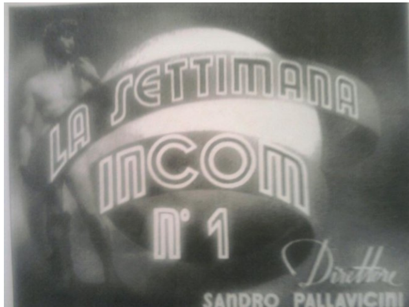
La Settimana INCOM logo: screen capture from opening credit sequence of episode No. 1, 1946.