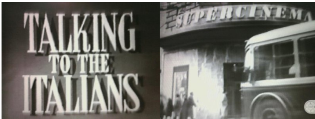
Two images from the ECA film Talking to the Italians (1950). The image on the left is the title slate for this ECA production, which reported on the Marshall Plan’s activities in Italy to Americans at home. The image on the right is a movie house in Rome, circa 1949. The film’s narrator informs the viewer that Italians are watching Marshall Plan films in theaters such as the “Super Cinema” pictured here.

A 1948 Act of Congress created a temporary US agency known as the Economic Cooperation Administration (ECA) to administer the economic and diplomatic concerns of the US