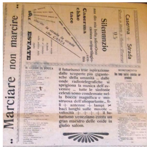
Fig. 2: Arabau Barù 1 (1924), 3.

Two items in the periodical stand out in particular. Both are located on the third page, and both make the latent aurality of the document explicit (see Figure 2). Top center is a Futurist poem in the style of “parole in libertà” (words set free), entitled “Caserma + Strada.” The poem articulates a series of distinctions: between silence (“Silenmnzio”) and noise on the one hand, and between onomatopoeia (“drin dirindin drindrinn”) and music (“la strada la strada che canta”) on the other. Again the iconography of loudspeakers and radiating patterns suggests dynamism and aural velocity. Even more significant is an enlarged text at the center of the page, one that articulates this iconography explicitly. Dedicated to the Venetian Futurist musician Giulio Salom, it outlines what “la musica dell’avvenire” (the music of the future) will be: “from radiotelegraphic waves emanates the music of the future [...] all the celestial symphonies are condensed in the magnificent and monstrous mouth of the loudspeaker [...] wires + antenna + lightning x long kisses in the clouds [...] speed.” 6 The future of music resided in the new sounds and communicative means of the latest technologies; this was the year, after all, of the advent of national radio broadcasting. 7