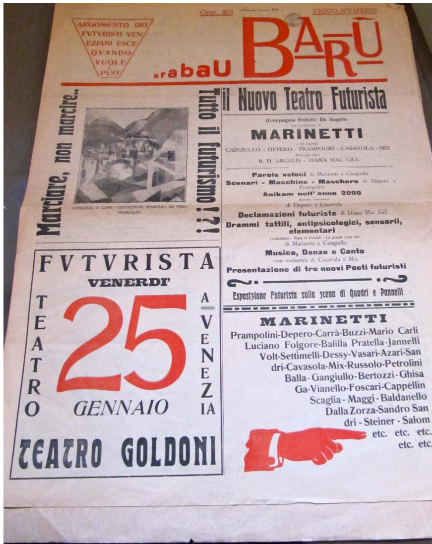
Fig. 1: Arabau Barù 1 (1924), 1. © courtesy of the Ministero dei Beni e delle Attività Culturali e del Turismo—Biblioteca Nazionale Marciana. Further reproduction prohibited.

Advertising for the forthcoming Goldoni performance by Il Nuovo Teatro Futurista —the latest incarnation of Futurist theatrical experimentation—occupies most of the front page. The date, location, program, and protagonists are listed along various axes and in various shapes. Indeed the juxtaposition of texted vortices and diagrams suggests what we might call a sonic visuality: loudspeaker symbols frame writing throughout the document, and other text is arranged to suggest radiating waves. 4 Upon turning the page, the reader is greeted with similar effects. Previously published texts are recycled, jostling with the newly written. On the inside