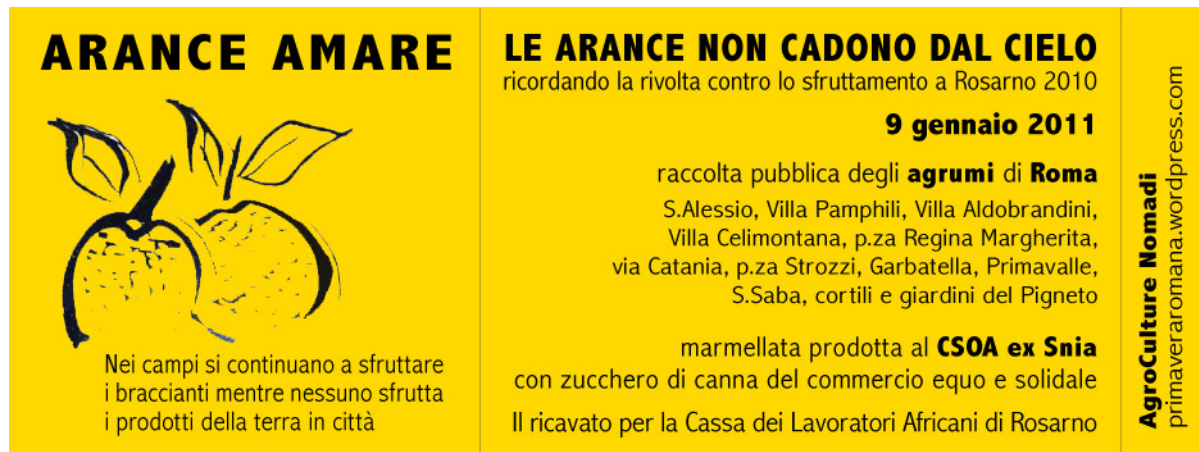
Fig. 4: Label, “Arance amare,” 2011

oranges in Rome from private and public gardens. Out of these oranges, participants squeezed juice and prepared marmalade to sell to passersby, with proceeds to benefit the orange pickers of Calabria. The label used on the jars read, “Arance amare” (“bitter oranges”): words that describe Seville oranges, of course (the most common oranges in Rome, in fact, because hardier than their sweet equivalent), but also—metaphorically and far more poignantly—words that point to the sorrowful stories of those picking oranges in Italy today and to their bitter cup of suffering. 48