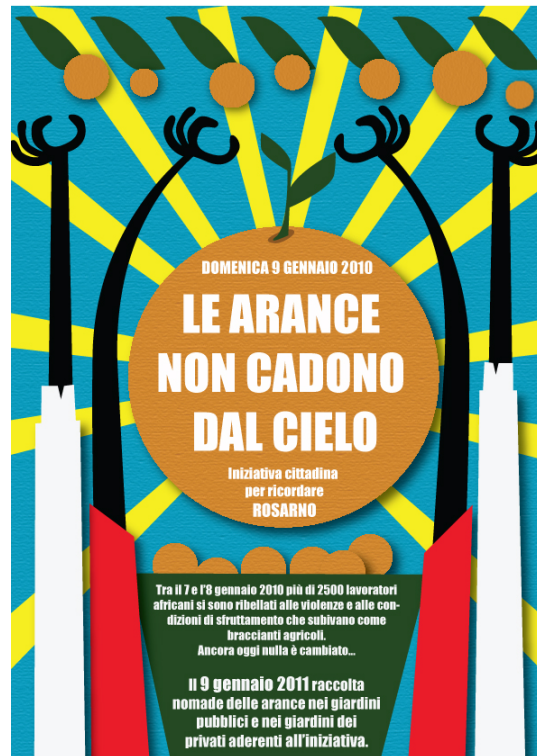
Fig. 3: Flyer, “Le arance non cadono dal cielo,” 2011, http://primaveraromana.wordpress.com/primavera-romana-2010/agro-culture-nomadi/agro-nomadismo/ (reproduced with permission)

On the other side of hell, in this sacred geography of oranges, is heaven, for the most memorable slogan of the movement supporting the African orange pickers of Rosarno derives its power from the dual meaning of the word “cielo”: the Italian word refers to both the physical sky and a metaphysical heaven. 47 The slogan reads, “[I]e arance non cadono dal cielo, ma sono delle mani che le raccolgono” (“Oranges do not fall from the sky—nor from heaven—but belong instead to the hands that pick them”).