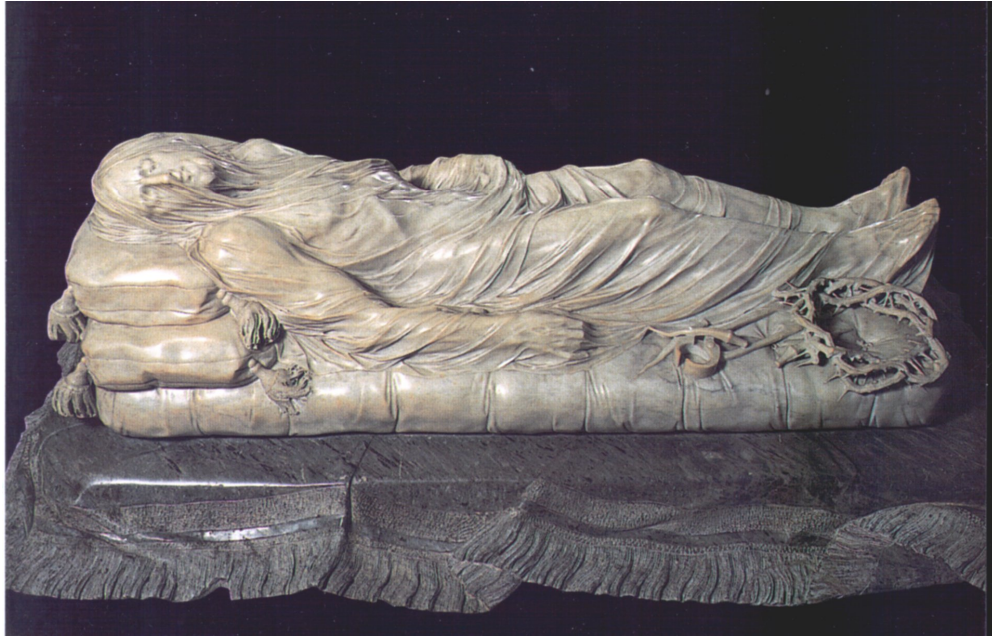
Fig. 14: Giuseppe Sanmartino, Veiled Christ , marble, 1753, Cappella Sansevero de' Sangri, Naples

However, whereas Sanmartino's delicately carved gisant conveys a vivid image of Christ's suffering and death through a seemingly translucent, agitated surface that both reveals and hides the martyred body, Cattelan's All is opaque, cold, and hard. It resists delivering a legible image of the individual bodies beneath their sheets. Rather than being laid out in state, some of these bodies seem to have been covered as they fell; others appear to be mangled or to have missing parts.