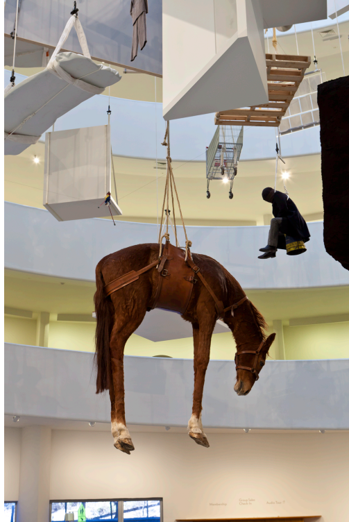
Fig. 12: Maurizio Cattelan, Novecento , taxidermied horse, leather saddle, rope, and pulley, 1997, Castello di Rivoli Museo d'Arte Contemporanea, Rivoli Turin, ©Maurizio Cattelan.

In contrast to the equestrian monument of Roman Emperor Marcus Aurelius, sited heroically in the Piazza del Campidoglio in Rome, or Donatello's Gattamelata , which dominates the piazza before Saint Anthony's Cathedral in Padua, Cattelan's horse embodies failure and defeat. 21 It shares the name Novecento with Bernardo Bertolucci's 1976 film about the rise of Italian fascism, as well as with the aesthetically traditional, pro-fascist art group that emerged in Milan during the 1920s. Perhaps more broadly, the title refers to the entire twentieth century, with its utopian ideals of progress and triumph over the constraints of nature, ideals that were so often realized in totalitarian states, imperialist wars, and other catastrophes. In a version from 2009, this horse, now fallen, is accompanied by the Latin letters INRI [Jesus of Nazareth, King of the Jews] scrawled crudely on a board that is attached to a stake and driven through the horse's body, making it a symbol of sacrifice and suffering. In format and cover image, then, the catalogue casts the exhibition in a biblical light, although here, too, tragic and comedic overtones are difficult to disentangle.