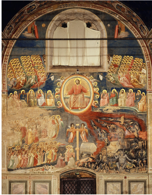
Fig. 17: Giotto, Last Judgment , fresco, 1305, Arena Chapel, Padua, Photo: Art Resource, New York

Proceeding down the Guggenheim Museum ramp, viewers encountered many famous and even notorious historical figures, some in ambiguous attitudes of martyrdom or repentance. Most striking was the hyperrealist wax effigy of Adolf Hitler, titled simply with the pronoun Him , as if his name, known to everyone, were too horrifying to be uttered (fig. 18).