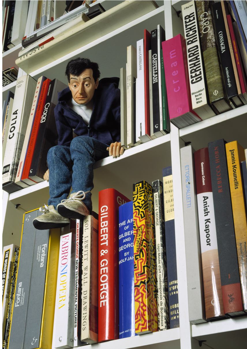
Fig. 5: Maurizio Cattelan, Mini-me , resin, rubber, synthetic hair, paint, and clothing, 1999, Collection of Karen and Andy Stillpass. ©Maurizio Cattelan, Photo: Courtesy Marian Goodman Gallery

looking down as a 12-inch Mini-me , awkwardly “shelved” a bit out of alphabetical order, in a series of art texts and catalogues beginning with the letter “C” (fig. 5); 6 and staring forward as the child Charlie, who sits obediently upright with his hands “penciled” to his school desk. Perhaps this Charlie makes a sly reference to Charlie Bergen, the dummy of ventriloquist Edgar Bergen— Charlie is also the title of one of Cattelan’s magazines.