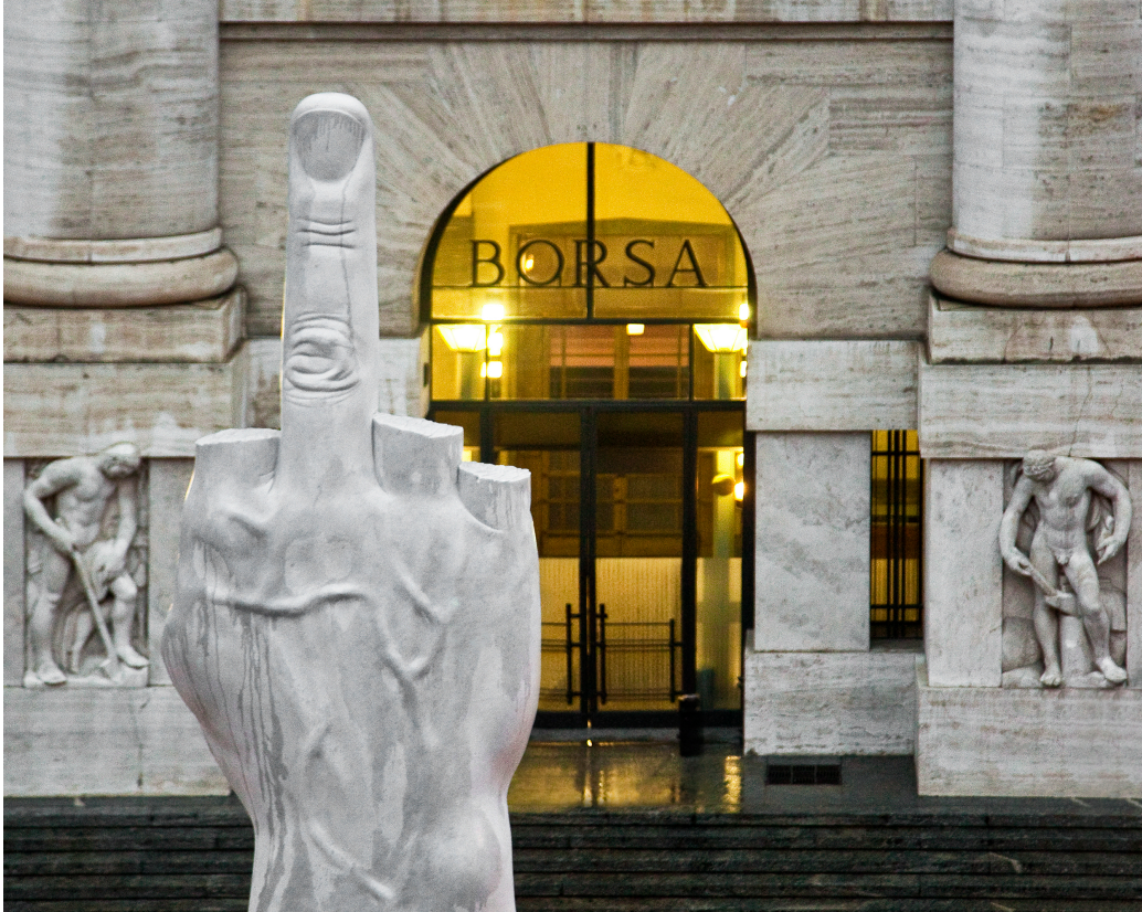
Fig. 24: Maurizio Cattelan, L.O.V.E. , detail, marble figure, 2010, installation view Piazza Affari, Milan, ©Maurizio Cattelan.

As some bloggers noted, the hand is turned so that it faces the viewers, leading them to read it as the bankers giving the finger to the rest of us in the wake of the financial crises of the period. Cattelan complicated the power of the gesture by breaking off the other fingers, turning the marble hand into a gigantic classical fragment, a partly ruined colossus that evokes the 4 th -century remains of Emperor Constantine's sculpted marble head, arm, and right hand. Severing the fingers of the saluting hand, however, has the paradoxical effect of intensifying its violence and authoritarianism. For Cattelan, such an image is charged with ambiguity. As he explained to Helena Kontova, "The raised arm is for me an extraordinary symbol of power, an erection in potential but also the absolute suspension of judgment. No one has ever succeeded in understanding where the Roman salute comes from and who invented it, but the doubt hasn't divested it of its force throughout time." 39 As in so many of Cattelan's works, it is this collision of opposites fused into a single striking image—here a symbol of erect, virile power that also announces the suspension of judgment in favor of absolute obedience—that makes the work so memorable.