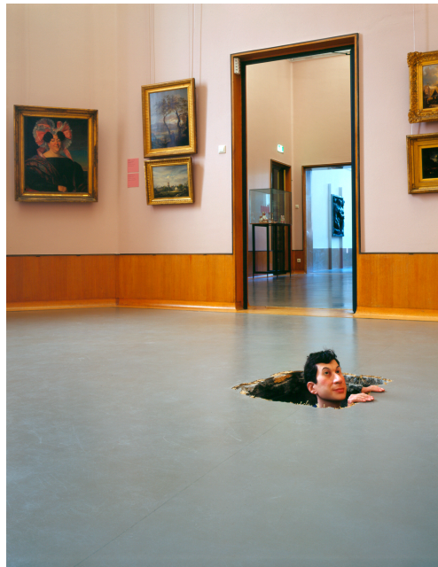
Fig. 4: Maurizio Cattelan, Untitled , wax, pigment, human hair, fabric, and polyester resin, 2001, The Dakis Joannou Collection, installation view Museum Boijmans Van Beuningen, Rotterdam, 2002, ©Maurizio Cattelan.

Surrogates of the artist himself surface in many works: coming up through a tunnel originally excavated in the floor of the Museum Boijmans Van Beuningen, Rotterdam, in an untitled self-portrait of 2001, as if he were breaking into the museum from below only to be amazed at the Dutch landscape paintings and portraits he beholds there (fig. 4);