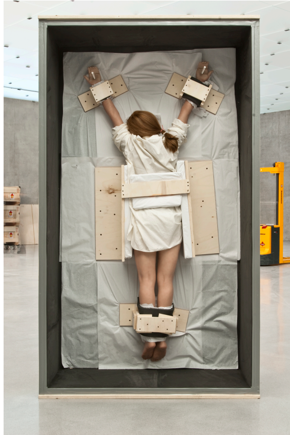
Fig. 27: Maurizio Cattelan, Untitled , resin, paint, human hair, clothing, packing tissue, wood, and screws, 2007, ©Maurizio Cattelan.

Cattelan reworked Woodman's image as a sculptural tableau, securing the woman's arms, back, and legs with wooden restraints, and piercing her out-turned hands with plugs (fig. 27). Facing away from us, she nonetheless conjures forth the image of a female crucifixion, rendered with remarkable realism, including visibly dirty feet that, as in Caravaggio's paintings, remind us of her humanity. In the Guggenheim retrospective, the taxidermied pigeons that perched on the crate that contains and frames the figure lent her a saintly aura, reminding one of the birds that became emblems of the Franciscan friar and patron saint of Padua, Saint Anthony.