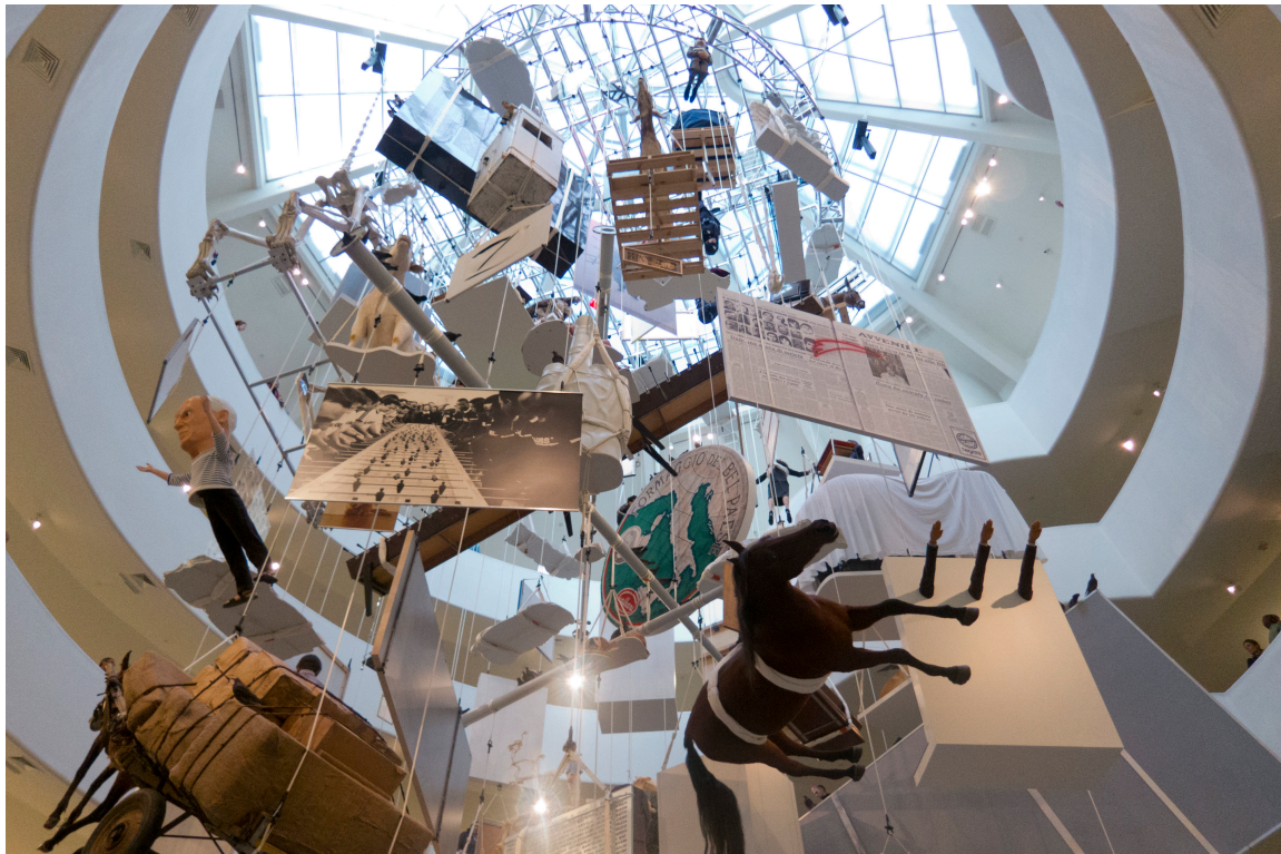
Fig. 1: Maurizio Cattelan: All , installation view, Solomon R. Guggenheim Museum, November 4, 2011–January 22, 2012.

Death hung in the air, suspended from the ceiling of the Guggenheim Museum's cavernous rotunda, in Maurizio Cattelan's 2011–12 retrospective titled All (fig. 1). 2 The very attempt to sum up the work of Cattelan, an artist from Padua who has repeatedly stunned the art world with