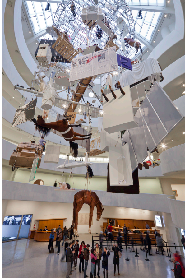
Fig. 21: Maurizio Cattelan, Untitled (upper center), photocopy and spray paint, 1994, Private Collection, ©Maurizio Cattelan.