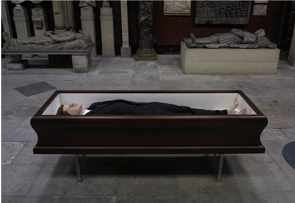
Fig. 20: Maurizio Cattelan, Now , polyester resin, wax, pigment, human hair, clothing, and coffin, 2004, The Dakis Joannou Collection, installation view, Chapelle des Petits Augustins, École nationale supérieure des Beaux-Arts, Paris, 2004, ©Maurizio Cattelan.