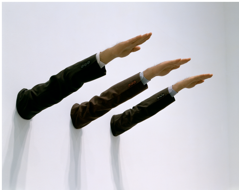
Fig. 23: Maurizio Cattelan, Ave Maria, polyurethane, paint, clothing, and metal, 2007

continue to belong to the collectivity through their very exclusion. Cattelan's Southern Suppliers FC (Football Club) and its "transport" company sponsor render the link between Nazi anti-Semitism and contemporary xenophobia and racism in Italy perspicuous. In order to make money for his team of Senegalese players, the artist set up an illegal stand—a performance titled Stand abusivo —at the 1991 Art Fair in Bologna, where he sold Rauss products. The team participated in regional competitions in Emilia-Romagna, but also played an exhibition match with multiple balls on an elongated, narrow foosball table, with the Southern Suppliers facing off against an all-white team of Italians. In All , large photographs of this game, Cesena 47 – A.C. Forniture Sud 12 , along with the foosball table titled Stadium , hung on a precarious diagonal, took their place among the other works in the Guggenheim's atrium, like so many avatars of Italian fascism and racism (fig. 22, middle left and middle upper section).