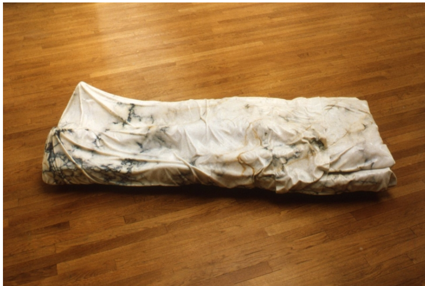
Fig. 15: Luciano Fabro, The Deceased , marble, 1968–1973

However, whereas Sanmartino's delicately carved gisant conveys a vivid image of Christ's suffering and death through a seemingly translucent, agitated surface that both reveals and hides the martyred body, Cattelan's All is opaque, cold, and hard. It resists delivering a legible image of the individual bodies beneath their sheets. Rather than being laid out in state, some of these bodies seem to have been covered as they fell; others appear to be mangled or to have missing parts.