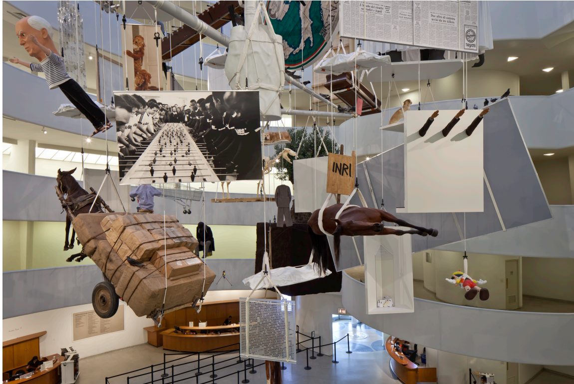
Fig. 22: Maurizio Cattelan: All , installation view, Solomon R. Guggenheim Museum, 2011–2012, with Cesena 47–A.C. Forniture Sud 12 at upper middle left, Ave Maria at upper middle right, Daddy Daddy at lower right, and L.O.V.E. at middle top.