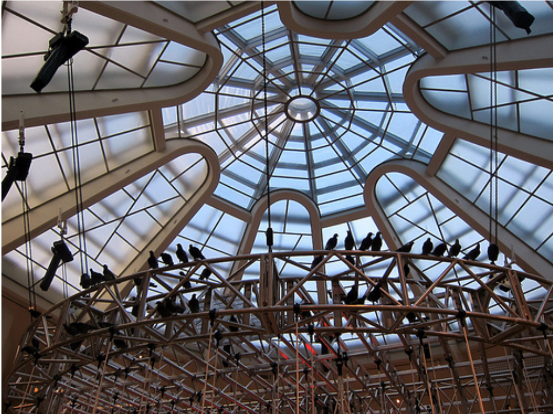
Fig. 16: Maurizio Cattelan: All , installation view, top of the Solomon R. Guggenheim Museum ramps, 2011-2012