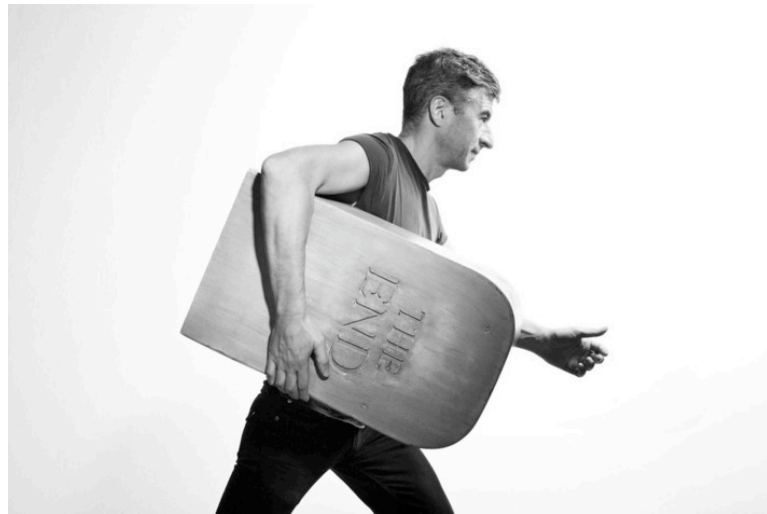
Fig. 2: Maurizio Cattelan, Untitled , 2011, ©Maurizio Cattelan.

In this essay, I propose that the Guggenheim retrospective provided the artist with an occasion to assemble his wildly divergent works so that they assumed new valences within an overarching, more or less coherent structure, despite the apparent chaos of the site-specific presentation. And indeed, the installation seemed to explode into a riotous configuration that defeated the Museum's usual retrospective structure based on temporal progression through an artist's life work. Ostensibly calling for critical judgment of the totality of Cattelan's artistic oeuvre, the show assumed greater finality when he declared that he would retire from the art world at its conclusion. He even had himself photographed carrying a tombstone inscribed with the words "THE END" under his arm (fig. 2). Not just the end of Cattelan's career as an artist, but "The End."