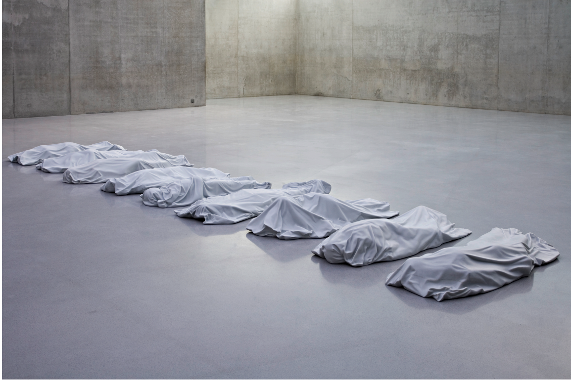
Fig. 13: Maurizio Cattelan, All , Carrara marble, 2007, installation view Kunsthaus Bregenz, Austria, ©Maurizio Cattelan.

Cattelan borrowed the title All , given to this retrospective, from a disturbing sculptural installation he created in 2007 (fig. 13). The work comprises nine slab-like sculptures, which he had carved in Carrara out of white marble. As usually installed, the series depicts a set of shrouded dead bodies placed directly on the floor in a row. Representing anonymous individuals as if they were awaiting identification, these corpses are covered by sheets that evoke, at some distance, neo-classical drapery. Cattelan explained to Nancy Spector that this work was inspired by his memories of Giuseppe Sanmartino's Veiled Christ of 1753, commissioned for the Cappella Sansevero de' Sangri in Naples (fig. 14). 22