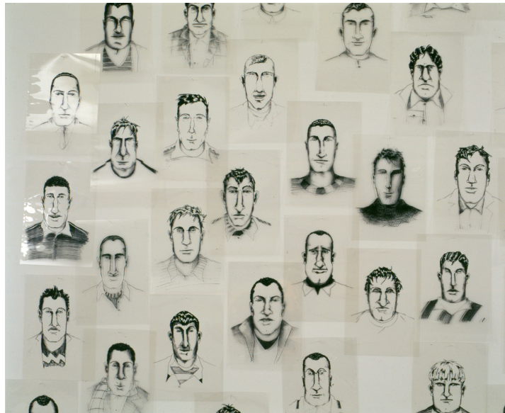
Fig. 29: Maurizio Cattelan, Super Us , detail, 50 acetate sheets, Private Collection, Paris, 1998, ©Maurizio Cattelan.

resurrected body while still wearing their everyday, inglorious clothing. As such she delivers an unexpected message to those who remain below. Shown at Portikus in 2007 in the context of Cattelan's unannounced show, Frau C's orans pose (an early Christian praying posture with arms extended to either side, hands raised up) and humble attire could be compared to the gesture of prayer assumed by the three saluting arms of Ave Maria in the nearby Frankfurt Museum of Modern Art. At the Guggenheim retrospective, Frau C was one of the few figures who seemed to me to have the power to ascend, however ambiguously.