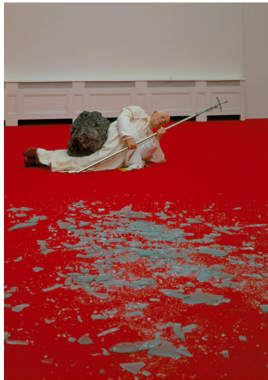
Fig. 19: Maurizio Cattelan, The Ninth Hour , polyester resin, wax, pigment, human hair, fabric, clothing, accessories, stone, glass, and carpet, 1999, ©Maurizio Cattelan. Photo: Courtesy Marian Goodman Gallery

The figure appears in shrunken form, at the scale of a child, wearing the clothing of a schoolboy of the mid-1930s. In earlier displays, where Him appeared kneeling directly on the floor, this miniaturization introduced an element of uncertainty. Adult viewers loomed over an apparently praying Hitler, his hands crossed and eyes cast upwards, but whether he assumed this posture sincerely or in mockery remained in doubt. The work seems to ask the unthinkable, whether forgiveness for Him , the very image of “evil incarnate” to use Cattelan’s words, could ever be possible. 25 But the effigy also points to the link between Catholic attitudes of religious piety and the rise of fascism during the interwar period and into the present, a theme that runs throughout Cattelan’s oeuvre. In most exhibitions, Cattelan positions Him facing away at the end of a long corridor, as the work was sited at the Warsaw Ghetto in 2012, for example, so that the discovery of his identity will contribute to the effect of shock. Suspended from cables in the Guggenheim, Him acquired a different, if equally startling mode of appearance; he could be viewed from above, straight on, or below, but now faced his viewers more directly. Visitors to the exhibition responded to the intensity of this encounter by gathering in small groups on the Guggenheim’s ramps—at all levels where the work could be seen—to stare back at this now diminished but still potent Him .