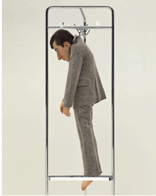
Fig. 6: Maurizio Cattelan, La rivoluzione siamo noi , polyester resin, wax, pigment, felt suit, metal coat rack, 2000, Solomon R. Guggenheim Museum, ©Maurizio Cattelan.

In one especially striking work, Cattelan appears as a living effigy dangling helplessly from a hook on a tubular steel coat-rack designed by Bauhaus artist Marcel Breuer (fig. 6). The small-scale, wax Cattelan, wears a shrunken version of the grey felt suit that German artist Joseph Beuys made famous in a series of shamanistic performances during the 1970s (fig. 7).