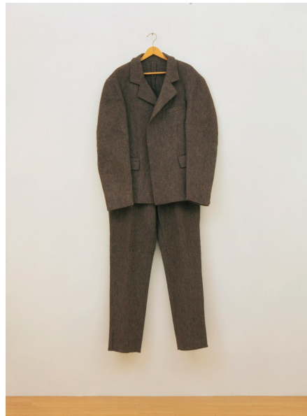
Fig. 7: Joseph Beuys, Felt Suit , 1970.

In one especially striking work, Cattelan appears as a living effigy dangling helplessly from a hook on a tubular steel coat-rack designed by Bauhaus artist Marcel Breuer (fig. 6). The small-scale, wax Cattelan, wears a shrunken version of the grey felt suit that German artist Joseph Beuys made famous in a series of shamanistic performances during the 1970s (fig. 7).