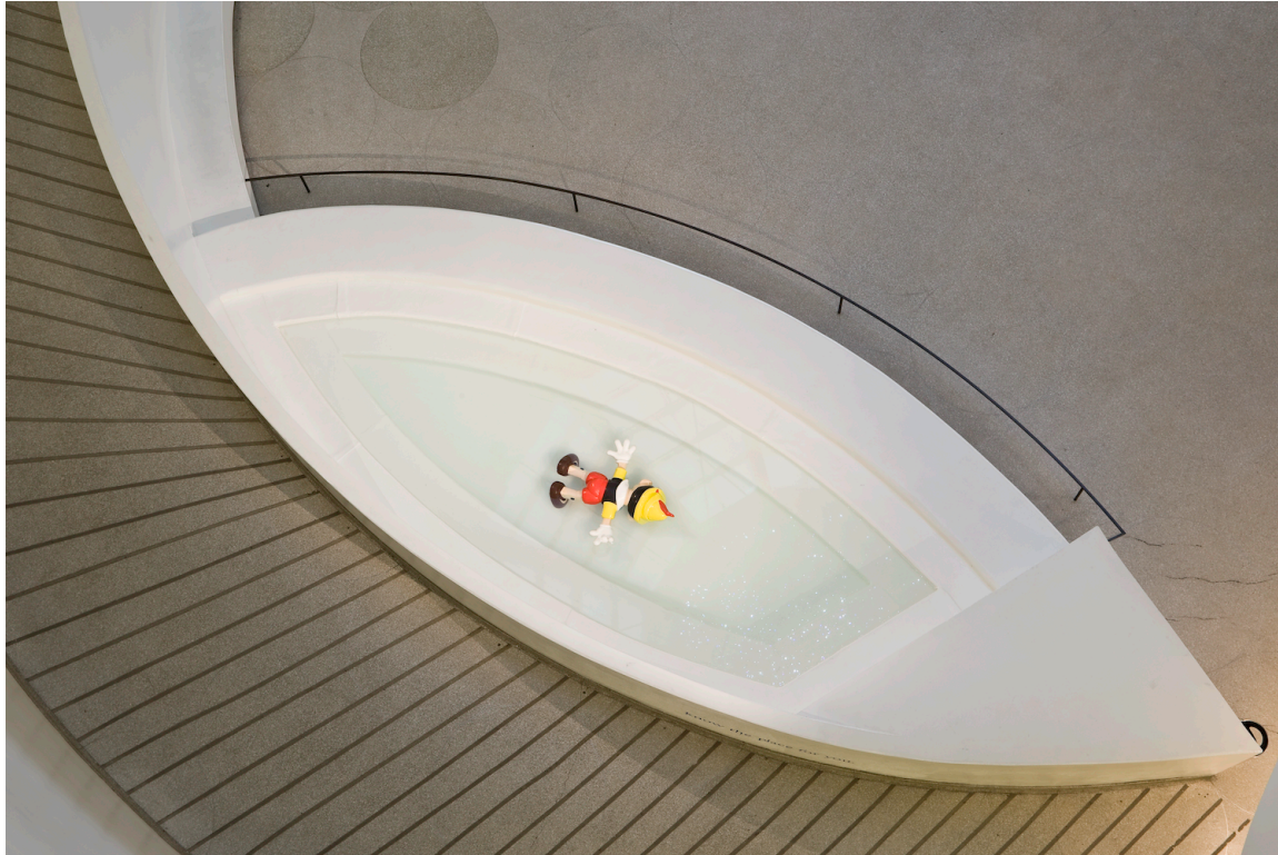
Fig. 9: Maurizio Cattelan, Daddy Daddy , polyurethane resin, steel, and epoxy paint, 2008, installation view: theanyspacewhatever, Solomon R. Guggenheim Museum, October 2008, ©Maurizio Cattelan.