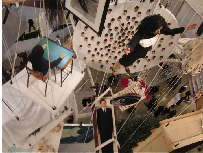
Fig. 28: Maurizio Cattelan, Frau C. polyester resin, paint, human hair, clothing, and shoes, 2007, Private Collection, as installed at the Solomon R. Guggenheim Museum (upper right)