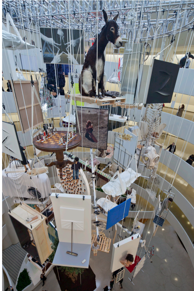
Fig. 30: Maurizio Cattelan, installation view of Maurizio Cattelan: All, Solomon R. Guggenheim Museum, 2011-2012.

When viewed as a totality, All presents Cattelan's oeuvre from the uncanny perspective of the end of time—a time that has already occurred—mirrored in the deaths and strange afterlives of his reinstalled works; the exhibition suggests that it is from this optic that we can take stock of ourselves and our often lulled, dormant, mythified, or indifferent relation to violence, xenophobia, and greed, or to the sacralization and abuse of political power. For Cattelan, death is not only a recurring thematic obsession, but also a vehicle with which he reminds us of our material finitude and defamiliarizes the world. Some of his taxidermied or animation-inspired animals—such as the cartoonish donkey, an animal associated with foolery and stubbornness and with whom Cattelan identifies—gaze at their human counterparts with innocent stupefaction (fig. 30, upper middle). 50 These animals have been endowed with human attributes, including the capacity to turn away, hide, fall asleep, suffer, die, and potentially, to see the world in all its