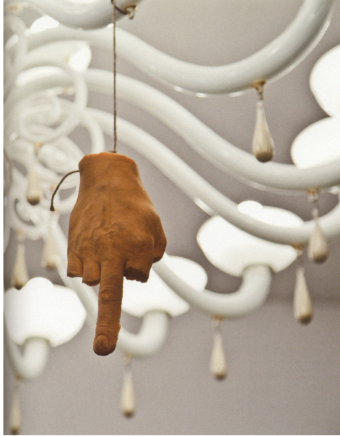
Fig. 25: Maurizio Cattelan, L.O.V.E. , polyurethane rubber, 2010, installation at the Menil Collection, Houston, 2010 ©Maurizio Cattelan