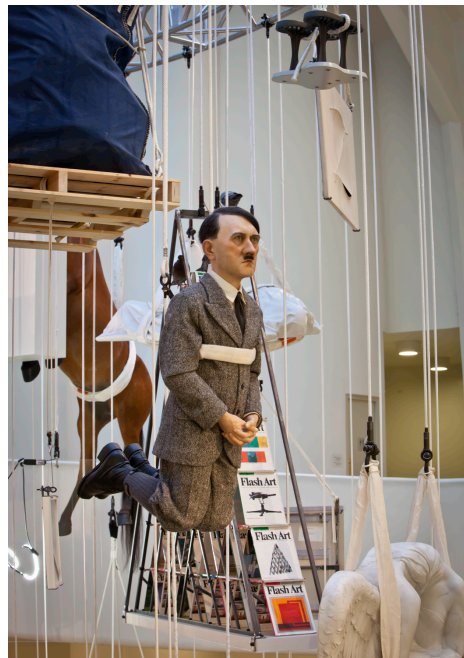
Fig. 18: Maurizio Cattelan, Him , polyester resin, wax, pigment, human hair, and suit, 2001, Danielle and David Ganek, ©Maurizio Cattelan.

Proceeding down the Guggenheim Museum ramp, viewers encountered many famous and even notorious historical figures, some in ambiguous attitudes of martyrdom or repentance. Most striking was the hyperrealist wax effigy of Adolf Hitler, titled simply with the pronoun Him , as if his name, known to everyone, were too horrifying to be uttered (fig. 18).