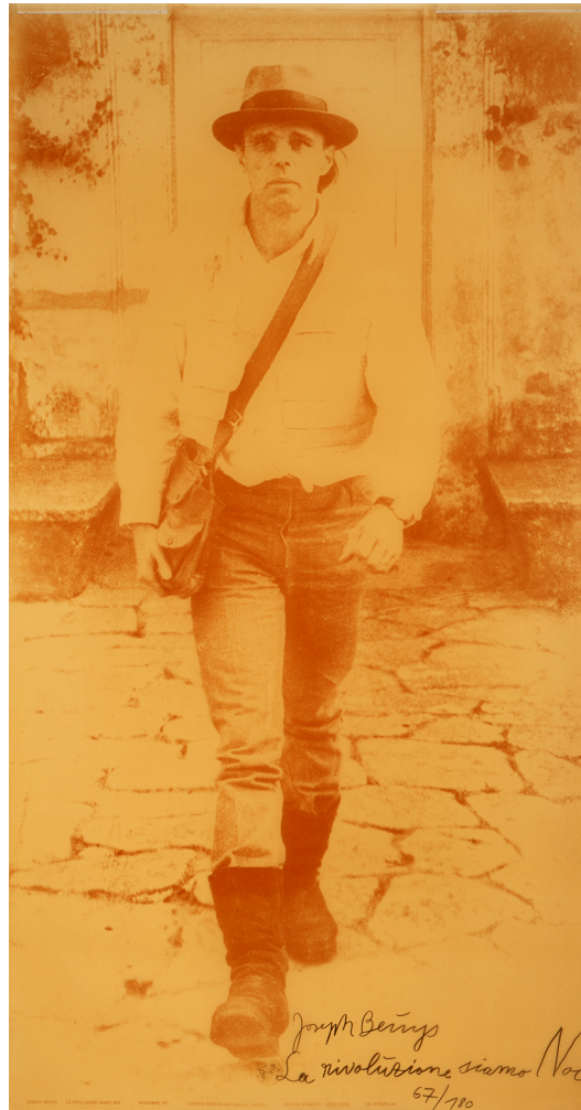
Fig. 8: Joseph Beuys, La rivoluzione siamo noi , silkscreen, ink, and stamp on paper, 1971.

This mise-en-scène bears, with evident irony, the title of another of Beuys's works, La rivoluzione siamo noi . The latter was a silkscreen poster that Beuys made for an exhibition held in November 1971 at the Neapolitan gallery, Modern Art Agency. In a characteristic gesture, Beuys asked cinematographer Giancarlo Pancaldi to take a photograph as he strode forth from the entrance of the Villa Orlandi on the island of Anacapri (fig. 8).