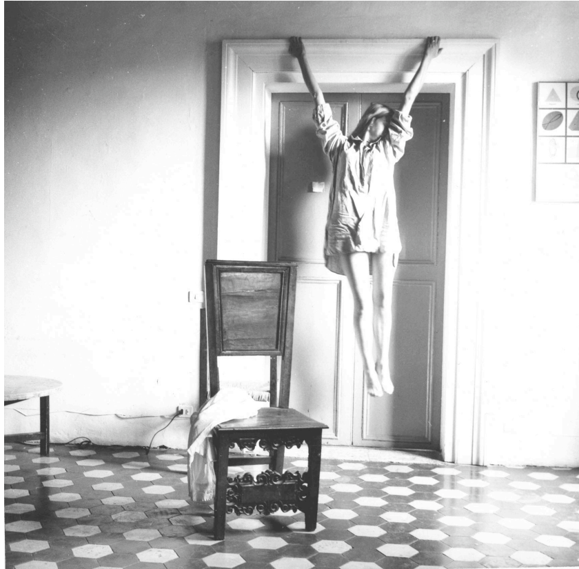
Fig. 26: Francesca Woodman, Untitled , gelatin silver print, 1977–78, Rome, Italy.

thrusting gesture of the authoritarian salute/popular insult, and the equally vehement downward vector of moral condemnation (fig. 22, top center and middle right).