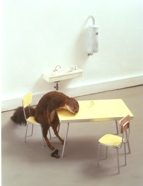
Fig. 3: Maurizio Cattelan, Bidibidobidiboo , taxidermied squirrel, ceramic, Formica, wood, paint, and steel, 1996, Fondazione Sandretto Re Rebaudengo, Turin, ©Maurizio Cattelan.

Surrogates of the artist himself surface in many works: coming up through a tunnel originally excavated in the floor of the Museum Boijmans Van Beuningen, Rotterdam, in an untitled self-portrait of 2001, as if he were breaking into the museum from below only to be amazed at the Dutch landscape paintings and portraits he beholds there (fig. 4);