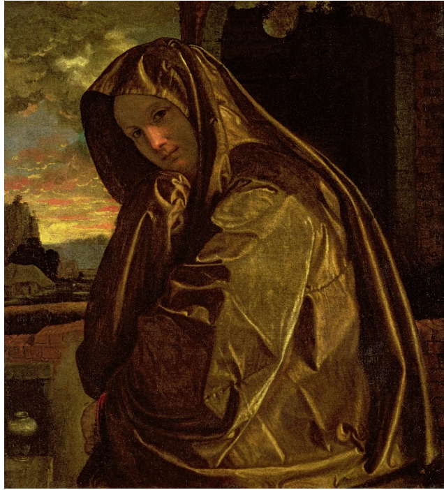
Fig. 3: Savoldo, Saint Mary Magdalene , ca. 1527-ca, 1540, Galleria degli Uffizi, Contini Bonacossi Collection, Florence