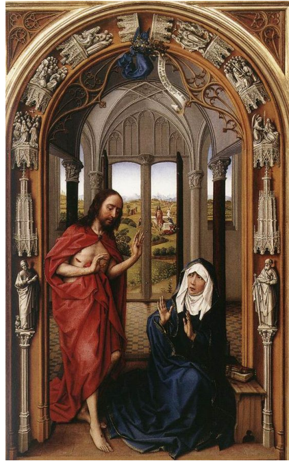
Fig. 20: Rogier van der Weyden, Miraflores Altarpiece, 1440-1444, Gemäldegalerie, Berlin

in her house, which also frames the adjacent scenes of the Nativity and Crucifixion. Later versions of the theme are less site-specific, in keeping with the Golden Legend ; one example is Titian's Christ Appearing to His Mother of 1554 (Santa Maria Assunta, Medole). 70