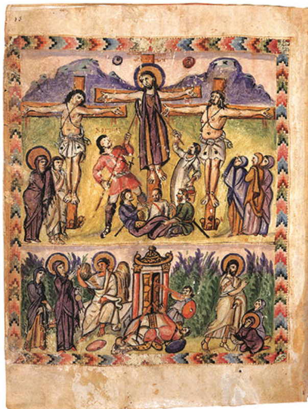
Fig. 19: Rabbula Gospels, Crucifixion and Resurrection of Christ, 586 CE, Laurentian Library, Florence, fol. 13r

Illustrations accompanying these exegetical texts complement the literary desire to demonstrate the Virgin Mary’s unequivocal presence at the tomb. This may be seen in the Resurrection scene in The Syriac Gospel of Rabbula (586 AD), housed in the Medici collection, Florence, by 1497 (Fig. 19). 52 Here Mary, dressed identically to her representation in the Crucifixion at the top of the page, falls to the ground in the presence of the resurrected Christ along with another woman; of the two she alone has a halo and is veiled in dark blue cloth. It should also be noted that on the left side of the page, she carries an ampulla to the tomb, and that in the Crucifixion scene her covered, raised hand anticipates the Byzantine icons of the Lamenting Virgin discussed above.