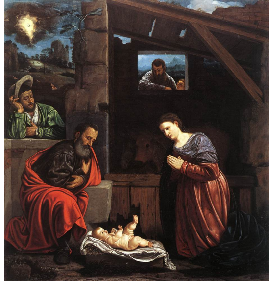
Fig. 6 (right): Savoldo, Nativity, ca. 1538, Pinacoteca Tosio Martinengo, Brescia