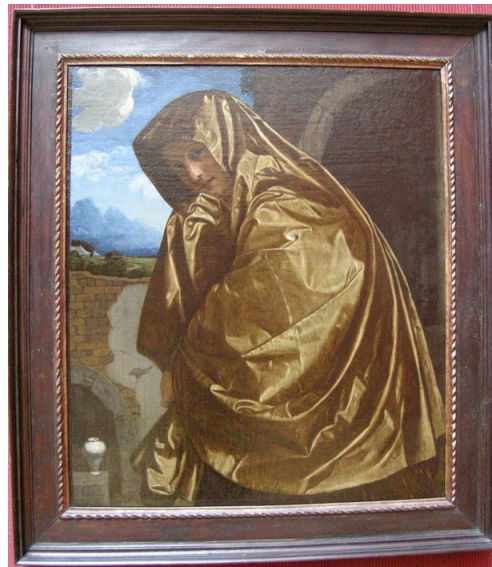
Fig. 2: Savoldo, Mary Magdalene , ca. 1527-ca.1540, The J. Paul Getty Museum, Los Angeles, image via Wikicommons