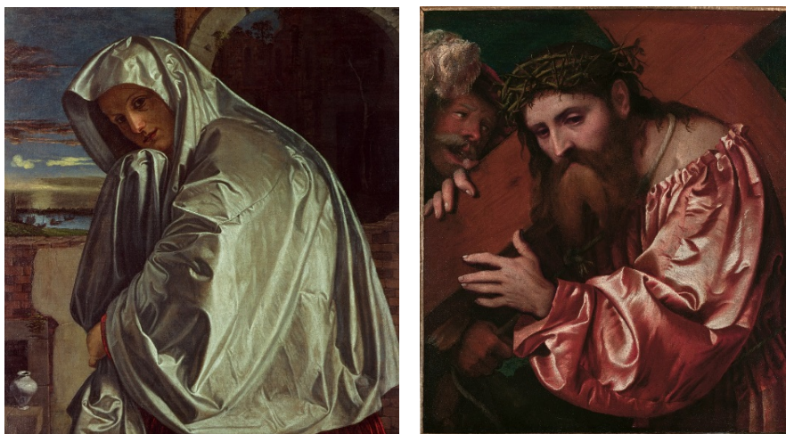
Fig. 17 (left): Giovanni Gerolamo Savoldo, Mary Magdalene , ca. 1527-ca. 1540, National Gallery, London

The half-length figural types seen in the panel by Paolo Veneziano (Fig. 15) continued to be inventively transformed by artists such as Antonello da Messina, Bellini, Giorgione, and Titian into what Sixten Ringbom calls the “dramatic close-up,” where the format of an icon is both enlarged and fused with the verism—both in physical and psychological terms—of a living person, typically Christ. 41 Pardo situates Savoldo’s Magdalene paintings firmly within this tradition. 42 Especially appealing to Mendicant patrons, this artistic development prolongs the late medieval preoccupation with the corporeal appearance of Christ and the Virgin. 43 In the late fifteenth century artists and their patrons further encouraged empathetic mourning by introducing a narrative dimension to complement the half-length figures, who were depicted as turning to confront the viewer. 44 Savoldo adopted this formula by reinventing the Byzantine Lamenting Virgin for his female Magdalenes to achieve a compelling iconic pathos. Paul Joannides has suggested that Savoldo’s Magdalene (perhaps the version in London: Fig. 17) may have been hung by the patron or owner in a manner reminiscent of the images that functioned as models for such a hypothetical diptych; the Averoldi family commissioned Christ the Cross-bearer of 1542 (Brera, Milan) from Romanino of Brescia, whose material luxury competes with that of Savoldo’s veiled women (Fig. 18). 45