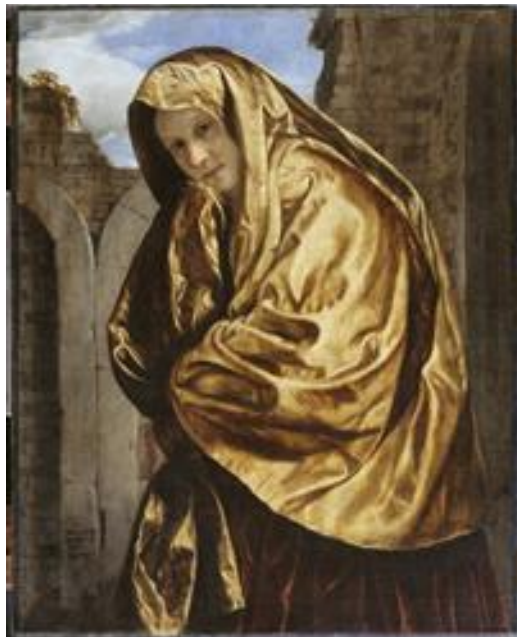
Fig. 4: Savoldo, Mary Magdalene, ca. 1527-ca.1540, Gemäldegalerie, Berlin

Despite these commonalities, the works overtly differ from each other in relation to the color of the veil and visibility of its painted seam, the presence of a small white vase on a ledge in front of a partially obscured aperture, the suggested age of the sitters, and the settings. The