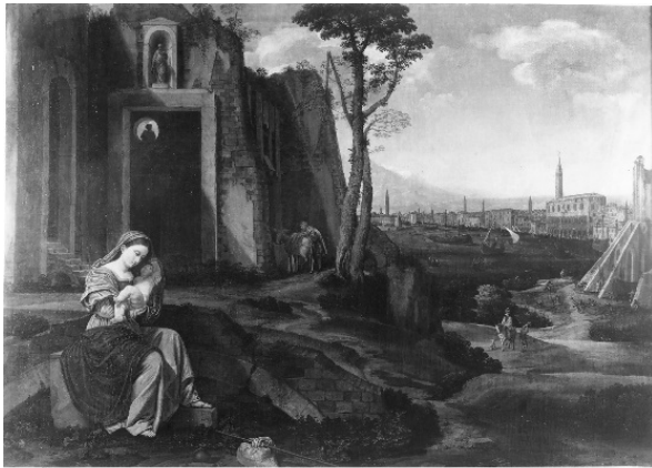
Fig. 5 (left): Savoldo, Flight into Egypt , 1527, private collection, Milan (formerly in the Albani Collection)