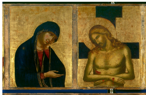
Fig. 15: Paolo Veneziano, Cover for the Pala d'Oro , 1345, Museo Marciano, San Marco, Venice (detail of Lamenting Virgin and Man of Sorrows )

Savoldo's images overtly recall Byzantine icons of the Lamenting Virgin or Mater Dolorosa in the form of veiled full or half-length images, with the fabric completely covering the hair and part of the forehead and a veiled hand raised to the inclined head to wipe away tears. The prevalence of such devotional images in La Serenissima was testimony to the influx of, and obsession with, icons from the Greek East following the Venetian crusade of 1204, and they were on display in both churches and private homes. 37 Italian artists in central and northern Italy were inspired to mimic the full and half-length versions of the Byzantine Lamenting Virgin type. 38 One prominently displayed example was part of Paolo Veneziano's painted cover (1345) for the Pala d'Oro above the high altar of the basilica of San Marco (Fig. 15).