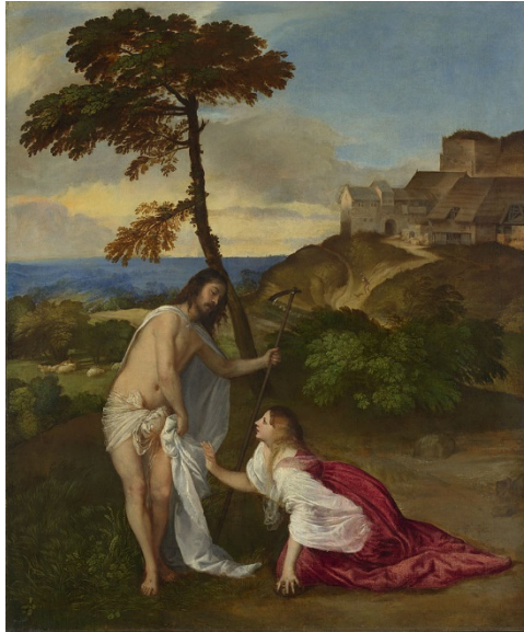
Fig. 7: Titian, Noli me tangere, ca. 1514, National Gallery, London

standing near the tomb. 20 Titian's version of this theme may be seen as representative of an approach with which Savoldo would have been particularly familiar (Fig. 7). Here the astonished Magdalene has fallen to the ground and reaches forward to confirm what she thinks she sees; her hair, itself an emotive device, is unfettered while the sleeves of her white camicia billow luxuriously to assist in the communication of a level of feeling that complements her extravagant gesture.