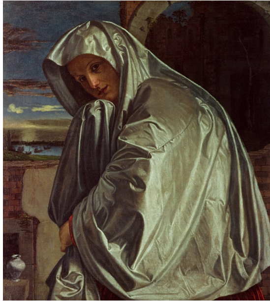
Fig. 1: Giovanni Gerolamo Savoldo, Mary Magdalene , ca. 1527-ca. 1540, National Gallery, London

upper body are almost completely enveloped by a satiny maphorion. 5 It covers a richly textured crimson dress and, behind her, an arcuated brick wall in ruins effectively isolates the figure from the background of the painting.