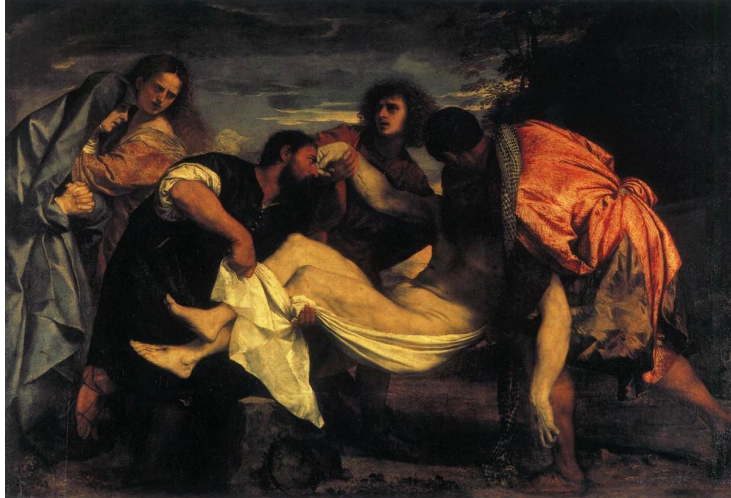
Fig. 8. Titian, Entombment , ca. 1520, Louvre, Paris