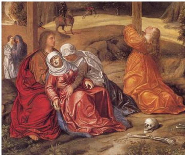
Fig.10: Savoldo, Crucifixion (detail), ca. 1520, formerly Piero Corsini Gallery, New York, image via Wikicommons

The silvery-white or dark gold colors of Savoldo's veils also had Marian associations for the north Italian viewer in the early Cinquecento. His use of an oil-based lead white for the London Magdalene reflects the desire of painters to capture the luminous effects of silk and velvet, materials suggestive of great luxury and status. 25 The Brescian artist continues the trend begun by Giovanni Bellini in works such as his Circumcision of ca. 1500 (Fig. 11) to lighten the veil from its traditional darker blue in order to achieve such shimmering effects—analogueous to Venetian mosaics—that the new medium made possible. A few years later Titian's Gypsy Madonna of ca. 1510 (Kunsthistorisches Museum, Vienna) featured a mantle of silvery blue lined in gold (in combination with a white veil), contrasting with her red dress (Fig. 12). 26 One notes the way in which Savoldo also repeatedly clothes the Virgin Mary in silvery satin veils of varying lengths over red dresses, as seen in his versions of the Adoration and of the Flight into Egypt (Figs. 5 and 6). Girolamo Romanino, his slightly younger Brescian compatriot (c.1484-c.1560), cloaks his Virgin of ca. 1545 in a sumptuous mantle of white silk over red, perhaps in competition with Savoldo's virtuoso displays of painted fabric (Fig. 13). 27