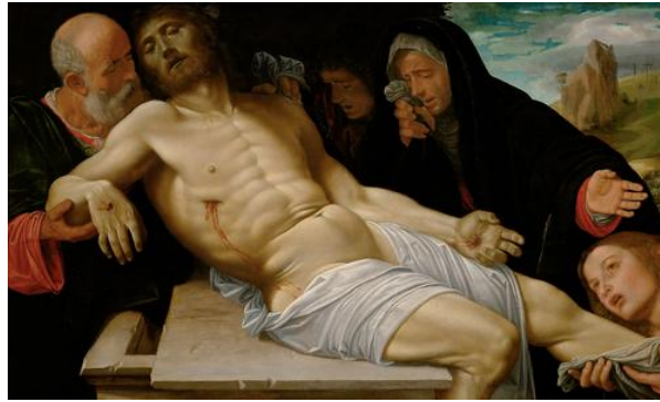
Fig. 9: Savoldo, Entombment, ca. 1513-1520, Kunsthistorisches Museum, Vienna

Of significance in relation to Titian's figure of the Magdalene in his Entombment is Savoldo's own Crucifixion of approximately the same date (ca. 1520), which features an emotive bareheaded Magdalene clad, like Titian's standing figure, in a voluminous gold cloth while kneeling at the base of the cross (Fig. 10). The saint throws her head back, and her hair streams down behind her. A full-length prototype of the artist's Magdalenes under discussion appears as a mourning figure in the background at lower left; she wears a gray-blue maphorion similar to that of Titian's Virgin, which partially obscures her face and conceals a raised hand. Savoldo's painting mirrors a woodcut by Dürer. 23 Of interest in this regard is the Flemish origin of his wife. 24