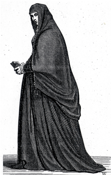
Fig. 22: Cesare Vecellio, "Widows of Venice," in Costumes anciens et modernes/Habiti antichi et moderni , 1590 (Paris: Firmin Didot, 1860, pl. 109)

Scholars can delight in the imagined conversations that Savoldo's paintings of veiled women may have provoked a half-millennium ago. The pictures provided elements for wide-ranging commentary by a variety of viewers: haunting psychological engagement; ambiguity of place; spiritual escape; the intimacy of Savoldo's secular portraits (or perhaps even the recognition of a familiar face); accessible and dazzling visual effects at once suggestive of a precious textile commodity and a dimostrazione of artistic skill; local sartorial custom (Fig. 22); 91 savvy comparison to the work of other painters; allusions to contemporary debate about Mary Magdalene; and, as suggested here, intimations of an alternate Marian identity.