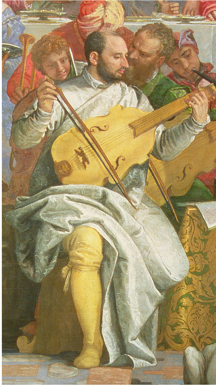
Fig. 5: Veronese, Wedding Feast at Cana , detail

In the midst of the striped and gold-woven Eastern silks and the patterned Venetian brocades, painted, as Richard Cocks puts it, with Veronese's "customary mastery" of such textiles, 16 Veronese shows himself in a presumed self-portrait as the viola da gamba player in a group of