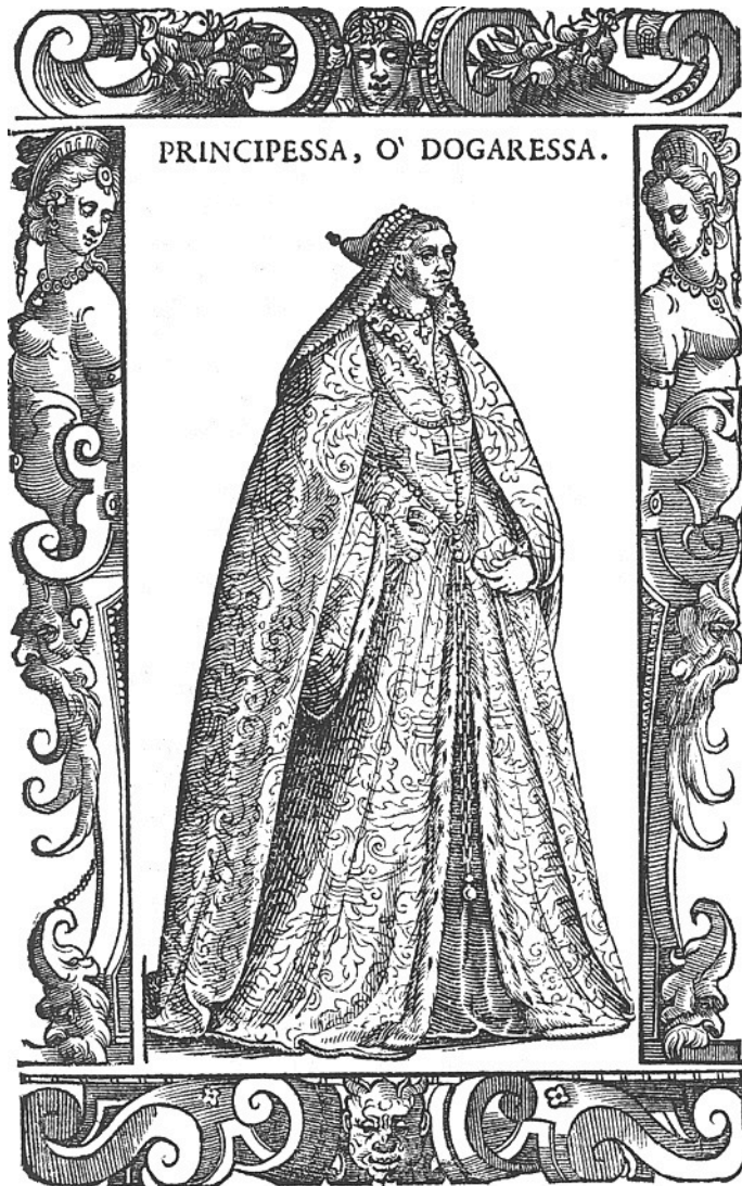
Fig. 17: Cesare Vecellio, Principessa, ò Dogaressa , woodcut, Habiti Antichi et moderni , 1590, 80, Private collection, Massachusetts

[l]a Principessa era vestita alla Ducale, con una vesta di broccato d'oro fino, sopra la quale portava il manto lungo fino in terra [...]. Il Corno, ch'ella haveva in capo, era tempestato d'assai gemme, & era accompagnato da un sottilissimo velo di seta [...] tutto trasparente [...]. Al collo havea una filza di perle di grandissima valuta, ma più d'ogni altra cosa fu mirabile una gioia di prezzo inestimabile, che pendeva fino al petto da una collana d'oro tramezata di molte altre gioie (80-1).