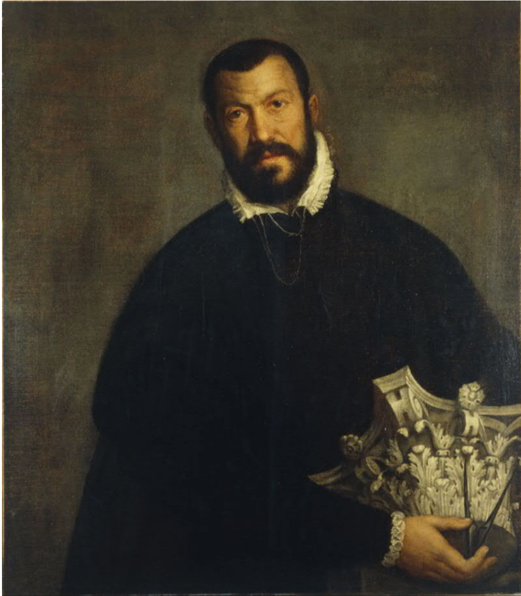
Fig. 13: Paolo Veronese and Workshop, Portrait of Vincenzo Scamozzi, oil on canvas, 93.5 x 82 cm, mid-1580s, Denver Art Museum

Veronese's treatment of Scamozzi's plain black gown focuses the viewer's eye first on the architect's face, then briefly on his modest white chemise collar and almost invisible chain necklace, and then on the Corinthian capital and compass in his hands. We look at the tools of his profession rather than the splendor of a nobleman's gold-trimmed jacket.