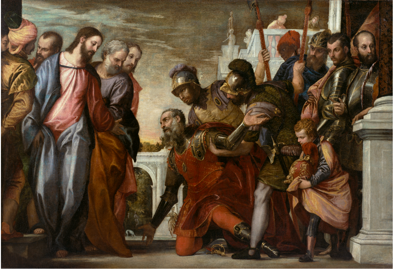
Fig. 6: Veronese and workshop, Christ and the Centurion , c. 1571, oil on canvas, 55 3/8 x 81 1/8 inches (140.6 x 206.1 cm), The Nelson-Atkins Museum of Art, Kansas City, Missouri, Purchase: William Rockhill Nelson Trust 31-73, Photo: Melville McLean

As his Marriage Feast at Cana shows, Veronese often depicted contemporary dress in his large Biblical canvases. A second example is Christ and the Centurion (Figure 6). 23