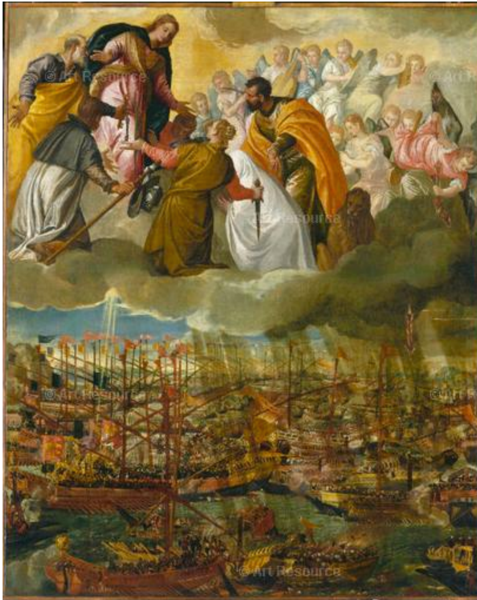
Fig 1: Paolo (Caliari) Veronese, Allegory of the Battle of Lepanto , c. 1573, oil on canvas, 169 x137cm, Gallerie dell'Accademia, Venice

to religious and secular history, mercantile wealth, patrician luxury, and civic harmony in order to affirm the commercial and political ideologies of their city. 6