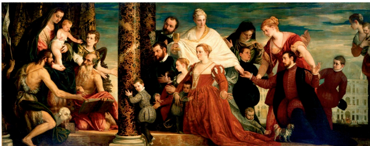
Fig. 10: Paolo Veronese, Cuccina Family Presented to the Virgin and Child, c. 1572, oil on canvas, 167 x 416 cm, Gemäldegalerie, Dresden

Ca' Cuccina” and points out that this painting, like the other three, “provided sumptuous affirmation of the family's piety while simultaneously making reference to their commercial interests.” 47