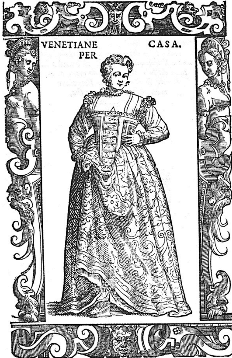
Fig. 22: Cesare Vecellio, Venetiane a Casa , woodcut, Habiti antichi et moderni , 1590, 144, Private collection, Massachusetts