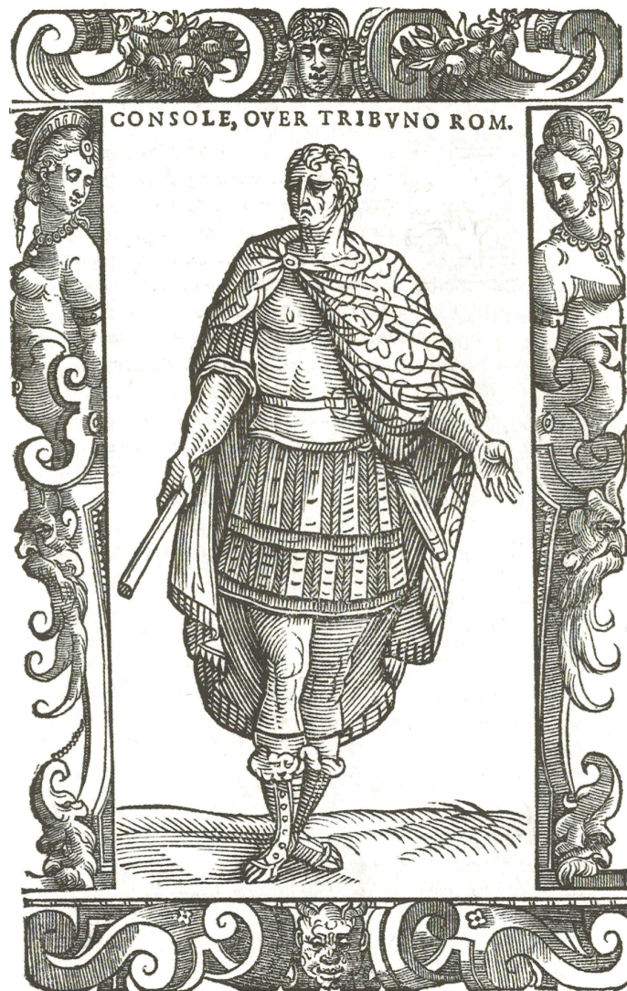
Fig. 8: Cesare Vecellio, Consul, or Roman Tribune , in Habiti antichi et moderni di diverse parti del Mondo , 1590, woodcut, 15.5 cm x 6 cm, Private collection, Massachusetts

The medium in which Veronese represents this self-humbling Christian's clothing—a canvas 6 \frac{3}{4} feet wide, 4 \frac{3}{4} feet high, and loaded with color—is very different from Vecellio's much smaller black and white woodcut, which is only 4 inches wide, including the frame, and 6 inches high (Figure 8).