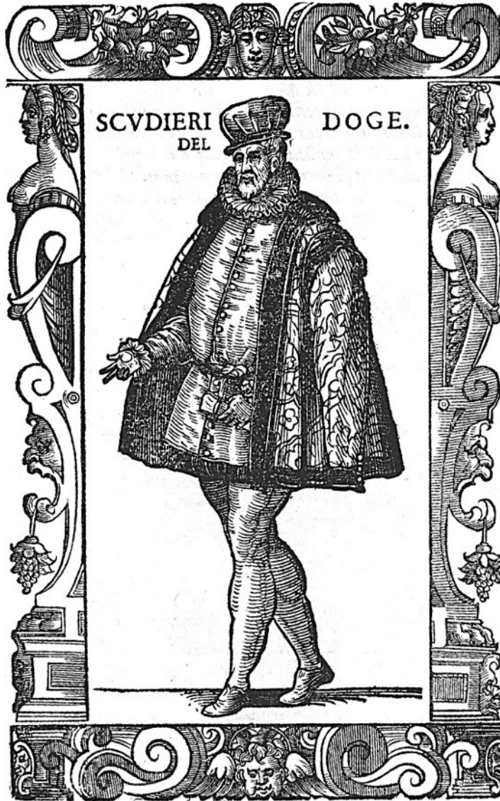
Fig. 16: Cesare Vecellio, Scudieri del Doge , woodcut, Habiti antichi et moderni , 1590, folio 115, Private collection, Massachusetts

He also describes the dress of the dogaressa herself and provides a detailed woodcut portrait of her, though the written description is more informative than in the black and white print (Figure 17):