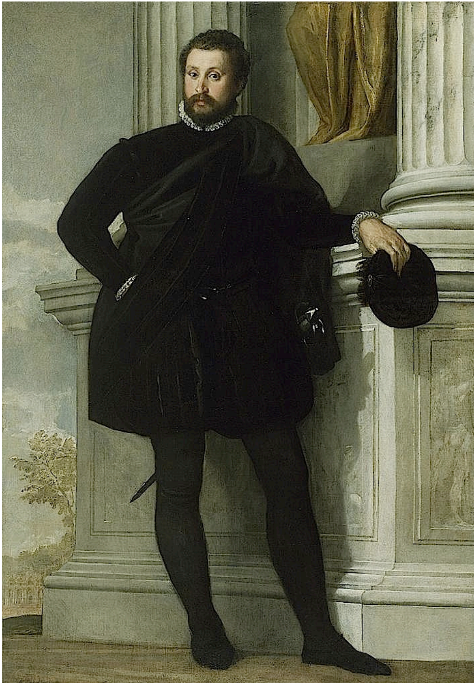
Fig. 15: Paolo Veronese, Portrait of a Man , 1576-78, oil on canvas, 192.1 x 134 cm, Open Content, J. Paul Getty Research Institute

Living in a city in which magistrates were required to wear black robes and men of all ages wore it as a sign of dignity, Venetians, including artists, developed a discerning eye for the hues and qualities of panni neri . An early painting demonstrating the importance of black is Sebastiano