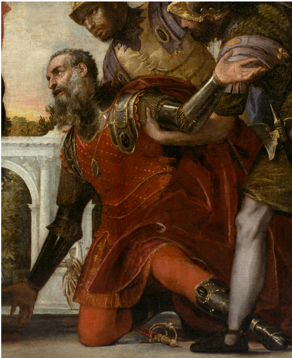
Fig. 7: Veronese and workshop, Christ and the Centurion , detail, The Nelson-Atkins Museum of Art, Kansas City, Missouri, Purchase: William Rockhill Nelson Trust 31-73, Photo: Melville McLean

Veronese's wealth of pigment, a visual analogy to Vecellio's language of color, signals the willingness of this powerful soldier to kneel to the young man he has accepted as the son of God. Veronese makes this point visually through the contrast between the humility of the centurion's kneeling pose and the splendor of his dress, grounding the miracle in a precise rendition of the rich dyes and fabrics named in Vecellio's text, which their fellow citizens would recognize as those worn by a wealthy man of the present (Figure 7). Expensive reds, as we will see, were reserved for the gowns of patricians. 25