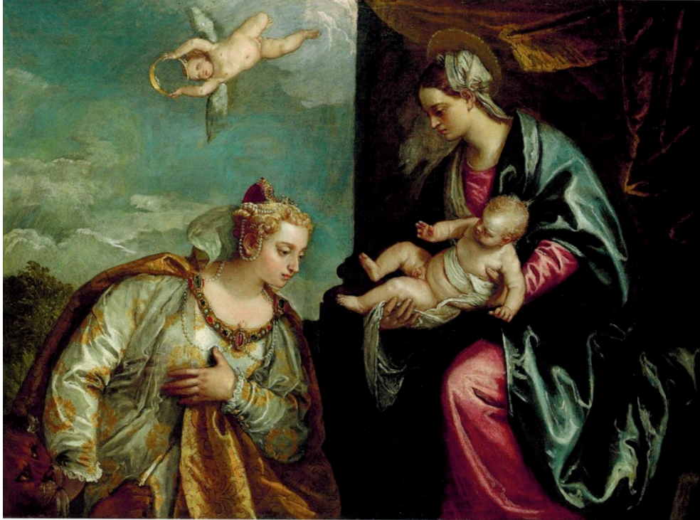
Fig. 19: Paolo Veronese, Allegory of Venice Adoring the Virgin and Child , late 1570s, oil on canvas, 103 x 139 cm, Private collection, Wikimedia Commons

small pearls twisted through her braids, encircling her neck, looping down to her collarbone, and framing her ear from below. 75 Veronese's Venetia also wears a long strand of smaller pearls, pinned up at the middle of her bodice below the heavy jeweled necklace attaching her mantle. Third, under the gold-on-gold brocade of her cloak, she wears a gown of white satin brocaded in gold.