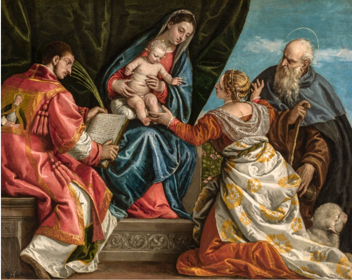
Fig. 18: Paolo Veronese, Sacra Conversazione , 1560s, oil on canvas, 103.2x 127.7 cm, The New Orleans Museum of Art: The Samuel H. Kress Collection, 61.80

Second, her intricately braided blond hair is trimmed with pearls falling in a loop around and below her ear. Coiffures in which braids were woven with strands of pearls, gems that Venice famously imported from the East and sold to the rest of Europe, were themselves a fine art. Giovanni Guerra illustrated such styles in the forty-five engravings in his book, Various Coiffures Worn by the Noblest Ladies of Various Cities of Italy , published in the 1590s. 74 One of Guerra's prints, "La Ornata" of Milan, resembles Veronese's Venetia : she wears a long strand of