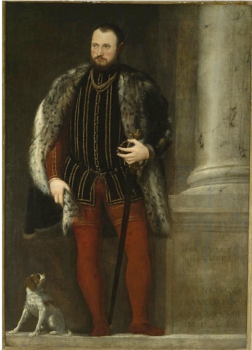
Fig. 11: Paolo Veronese, Francesco Franceschini , 1551, oil on canvas, 189.5 x 134.9 cm, John and Mable Ringling Museum of Art, Sarasota, Florida

In Veronese's portraits of Venetians, his treatment of what they are wearing