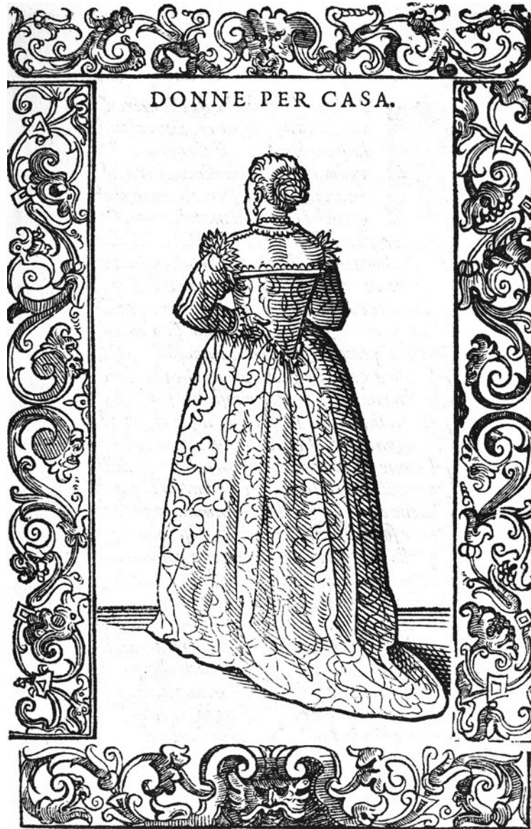
Fig. 21: Cesare Vecellio, Donne per Casa , woodcut, Habiti antichi et moderni , 1590, folio 139, Private collection, Massachusetts

We see the noblewoman from behind, in a snugly fitted bodice with a slightly dropped waist and a full, gathered skirt of brocade long enough to flow into a train.