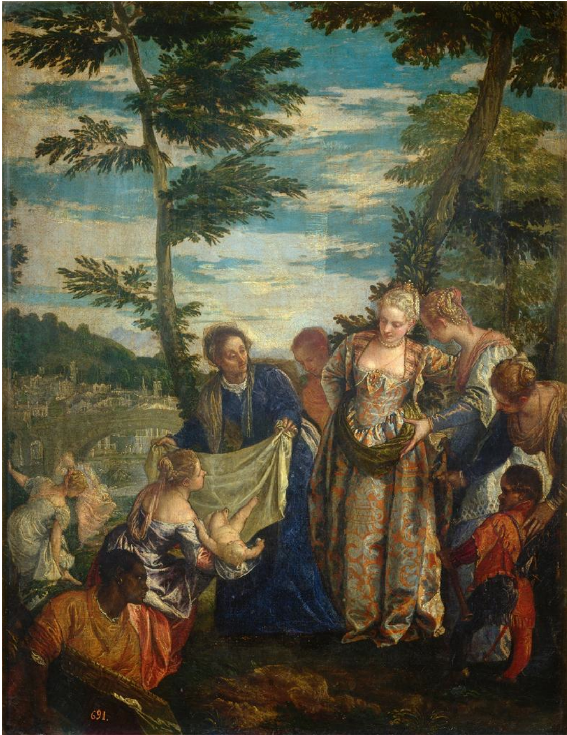
Fig. 20: Paolo Veronese, Finding of Moses [ Moses Saved from the Water ], ca. 1580, oil on canvas, Prado Museum