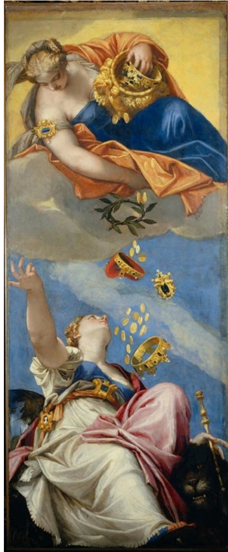
Fig. 3: Veronese, Juno Showering Venice with Gifts, 1554-6, oil on canvas, 365 x 147 cm, Sala dei Dieci, Palazzo Ducale, Venice.