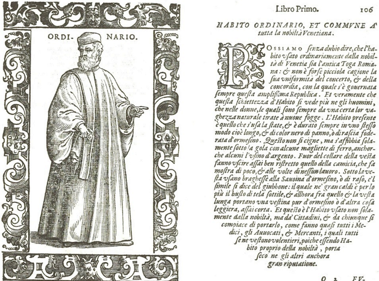
Fig. 14: Cesare Vecellio, Habito Ordinario, et Commune à tutta la nobiltà Venetiana , woodcut, Habiti antichi e moderni , 1590, 106, Private collection, Massachusetts

Vecellio shares this view of black, which he shows in a print entitled Everyday Clothing Worn by the Entire Venetian Nobility and succinctly describes in his text (Figure 14). 58