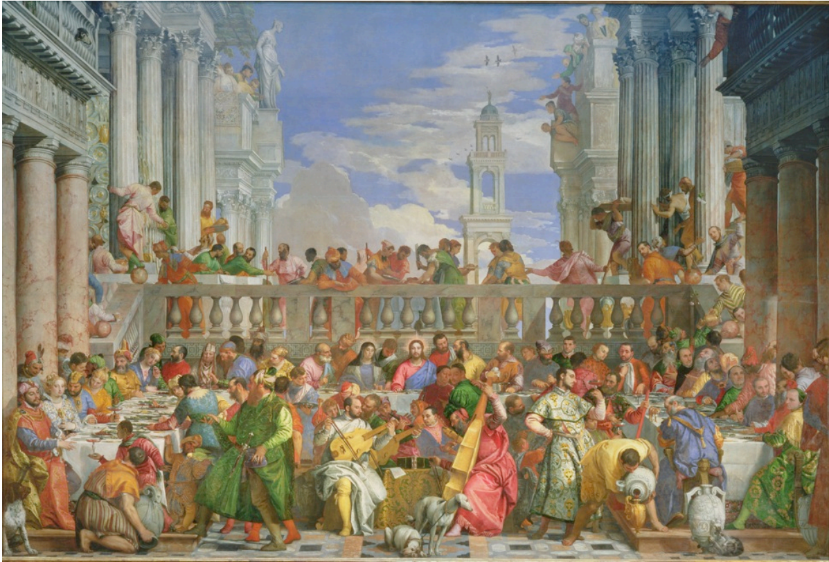
Fig. 4: Veronese, Wedding Feast at Cana , 1562-3, oil on canvas, 6.77 x 9.94 m, Louvre, Paris, France, Peter Willi / Bridgeman Images

Veronese was said to have dressed well himself. Ridolfi wrote that though he generally spent little, “he habitually wore expensive clothes and velvet shoes” 14 —a remark affirmed by the beautiful clothing the painter depicts in his 1562-3 Marriage Feast at Cana , painted for the Benedictines at San Giorgio Maggiore and now in the Louvre (Figure 4). 15