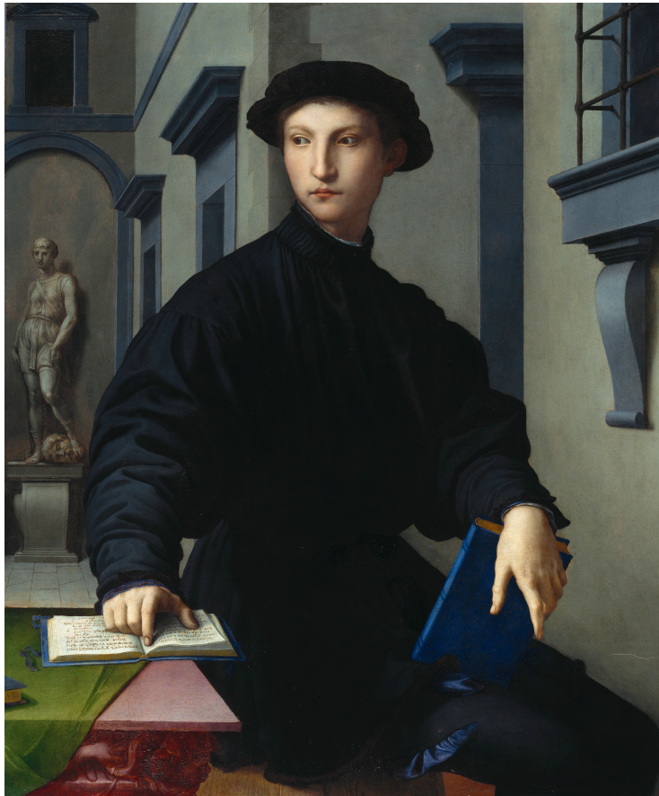
Fig. 11. Bronzino, Ugolino Martelli, c.1537, Gemäldegalerie, Staatliche Museen, Berlin.

enter the New Sacristy. In his portrait of an unknown Florentine youth, painted during the years the artist worked for Duke Cosimo in the Palazzo Vecchio, Salviati likewise made obvious reference to Michelangelo, in this case Lorenzo (fig. 13). The sitter shares with Michelangelo's duke a pensive expression and, most strikingly, a right arm modeled after Lorenzo's , with rotated shoulder, jutting elbow, turned wrist, and hand twisted outward to display an open palm.