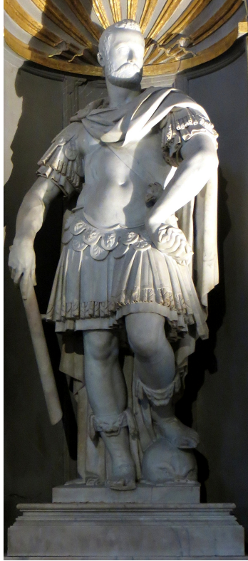
Fig. 16. Giovanni Caccini, Duke Francesco de' Medici, 1594, Udienza, Sala Grande, Palazzo Vecchio, Florence.

The arm akimbo with turned wrist evokes other Florentine heroes, among them Donatello's bronze David , the Martelli David , depicted in Bronzino's portrait of Ugolino Martelli (fig. 11), and Castagno's Farinata degli Uberti . However, as first conceived by Michelangelo in his Lorenzo and particularly as the statue was later observed from a high position by Salviati and Caccini, the projecting arm, unlike a more or less natural hand on hip pose, is twisted forward so that the elbow juts out in front of the body and the hand with turned wrist, resting on the upper thigh, faces the viewer. Although recalling earlier Florentine heroes, in its idiosyncratic form the arm stands out as a purposefully signifying element. Detached from Michelangelo's Lorenzo and applied to another body, the arm had been in Salviati's portrait a marker of both artistic authority and patrician culture. Under the Medici dukes, it acquired another significance, as a Medicean identifier, aligning members of the family with each other and with Florence. This progression depended on the artistic practices of intense scrutiny of body parts and copying from different points of view, and also on the visual Florentine identity that had already emerged from these practices among the patrician classes.