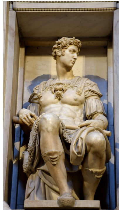
Fig.8. Michelangelo, Duke Giuliano de' Medici , c.1526–32, Medici Chapel, Florence.

Clearly, numerous three-dimensional reproductions were also in circulation in these years. A number of museums own 16th-century examples and others are noted in the scholarly literature, all in different degrees of finish and faithfulness to their model, and in various sizes, and materials—wax, clay, terracotta, gesso, and bronze. 58 Vasari records those by two associates of