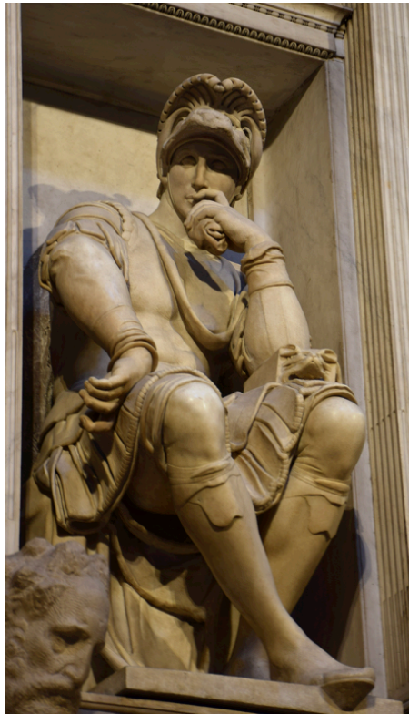
Fig. 13. Michelangelo, Duke Lorenzo de' Medici , c. 1526-32, Medici Chapel, Florence.

The right arm and hand of Salviati's Florentine Nobleman , while clearly referring to those of Michelangelo's Lorenzo , are seen from a position that gives a fuller view of the hand, which underscores Salviati's own distinctive treatment of hands and fingers. 78 Copies, models, and casts aided in the assimilation of Michelangelo's works, and in turn, through reference to them, the formation of a collective Florentine style. But reshaping those works in unexpected ways was also fundamental to the construction of a Florentine artist's distinctive style. 79 The result, as in these portraits, is a body composed of parts borrowed and assembled, whose models were intended to be evident and to contribute to conveying both the skill of the artist and the character of the sitter.