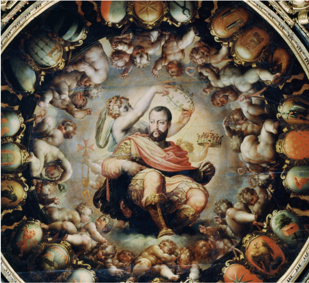
Fig. 14. Giorgio Vasari, Apotheosis of Cosimo , detail, 1565, Sala Grande, Palazzo Vecchio, Florence.

image of ducal grandeur. 90 This can best be illustrated by beginning with the project that survives as originally intended, Vasari's tondo in the Palazzo Vecchio.