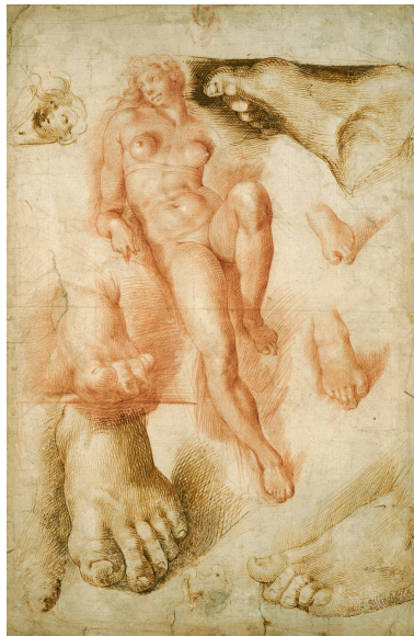
Fig. 10. Bartolomeo Passarotti, Copy after Michelangelo's Dawn , c.1550, The Nelson-Atkins Museum of Art, Kansas City. Purchase: William Rockhill Nelson Trust, 39-37.