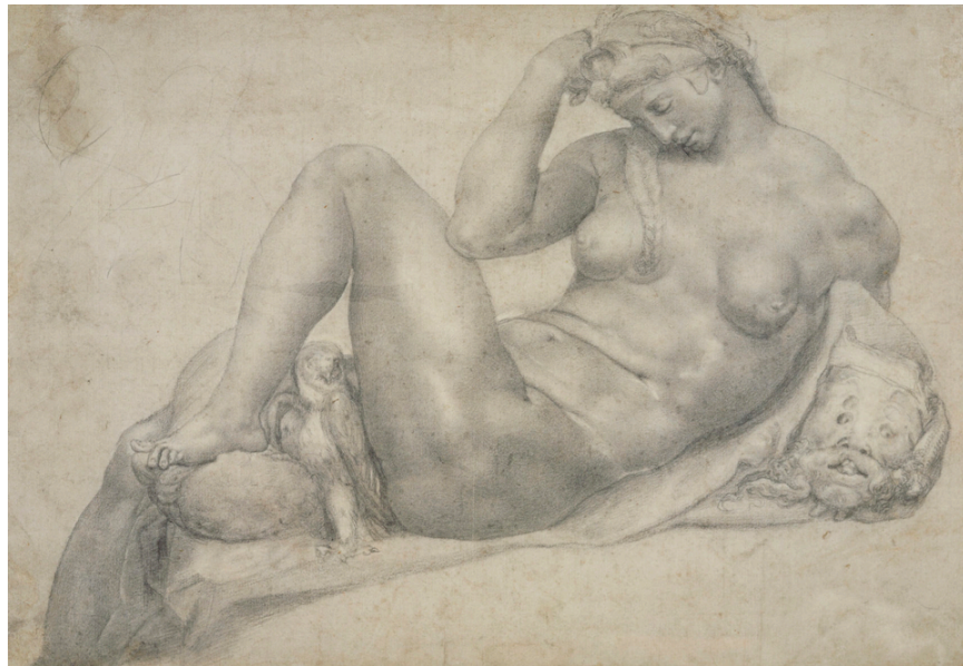
Fig. 5. Giovanni Battista Naldini, Night , Windsor Castle.