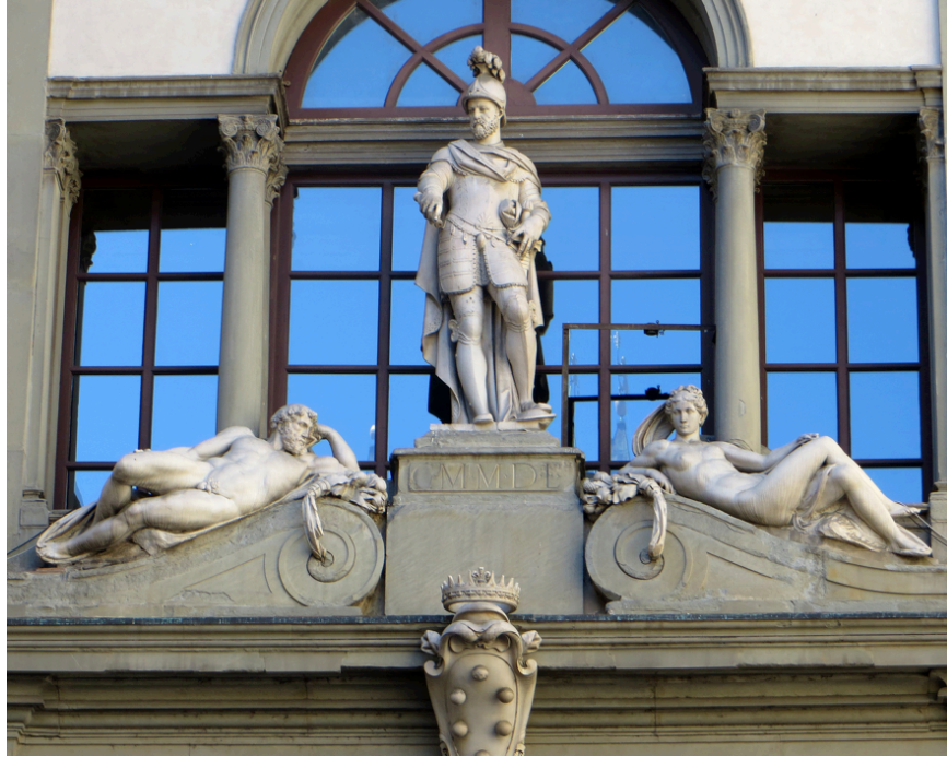
Fig. 15. Vincenzo Danti, Rigor and Equity, 1564–66, and Giambologna, Duke Cosimo, 1585, Uffizi, Florence.

In this eminently public place, facing the charged site of the Piazza Signoria, the identification of Cosimo with Giuliano was unmistakable with the addition of nude sculptures in an arrangement obviously similar to the Medici Chapel. 97 The ensemble is another assemblage of Michelangelesque elements—a large-scale seated Cosimo in the original plan, reclining personifications, and also outsize volutes. These recall Michelangelo’s distinctive usage of volutes at San Lorenzo—on the Medici Chapel sarcophagi; attached to the chapel door frames, on one of which a copyist rests his foot in Zuccaro’s drawing (fig. 3); and the giant examples at the lower level of the Laurentian Library vestibule. About the same time that images of the Times of Day, especially Night and Dawn , entered the Florentine visual tradition in painted versions for private consumption, Cosimo also appropriated these as images of his rule. 98 The flanking figures, completed in 1566, proclaimed not the duke’s demise, but the idealized