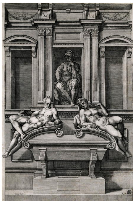
Fig. 17. Cornelis Cort, Tomb of Lorenzo de' Medici, 1570, British Museum, London.

they were all mounted. Vasari said the chapel became a school of the arts, and it was so for intellectuals and patricians as well. They too had an intimate experience of the individual statues and, finding in them the expressiveness and philosophical ideas of poets, they claimed Michelangelo as a paradigm for their own sense of Florentine culture. When Cosimo modeled himself on the capitani , it was through this history of copies, vantage points, and the reuse of the sculpted forms to convey Florentine identity that the portrayals of Vasari and Danti could insert him not only into the principal line of the Medici celebrated in the chapel, but also into the Florentine artistic tradition that developed out of the experience of the chapel and the patrician class's association with it. Cosimo's recycling of Michelangelo's nudes in Rigor and Equity may have inspired the interest in the later century in painted and bronze versions of the Times of Day, to further align their patrons with the latest manifestations of the Michelangelesque in Florence. As each group, class, and individual studied, admired, inhabited, and displayed the Medici Chapel sculptures, the figures accumulated associations, ways of being seen and understood, and definitions of Florentineness.