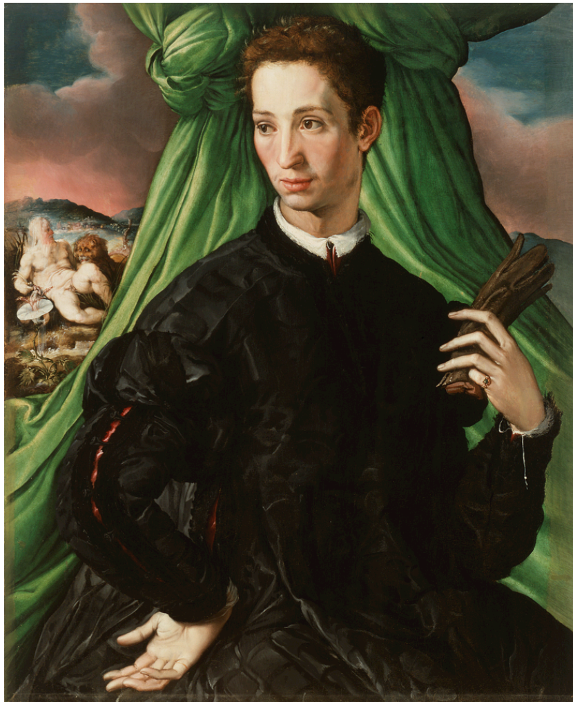
Fig. 12. Salviati, Portrait of a Florentine Nobleman, c.1545–48, St. Louis Art Museum, St. Louis.

These years, 1545–48, also marked a high point of interest among the patrician intellectual elite in Michelangelo not only as artist, but also as poet. Despite his absence from Florence, Michelangelo was elected to the Accademia Fiorentina in 1541. Soon after, Giannotti, in his dialogue set in 1545, presents Michelangelo as both a poet and a learned commentator on Dante. In March 1547, Varchi’s first lecture to the Accademia Fiorentina was devoted to an exegesis of one of Michelangelo’s sonnets with quotations from a number of others, and his second lecture included a comparison of Michelangelo as artist with Dante as poet. 71 Michelangelo became for intellectual Florentines an example of an educated and philosophical artist, a suitable model for an artist trained in his sculptures to represent the patrician educated class. Niccolò Martelli’s often-cited letter of 1544 relays Michelangelo’s explanation of his aims in the statues of the dukes as being not resemblance or even character, but to convey “una grandezza, una