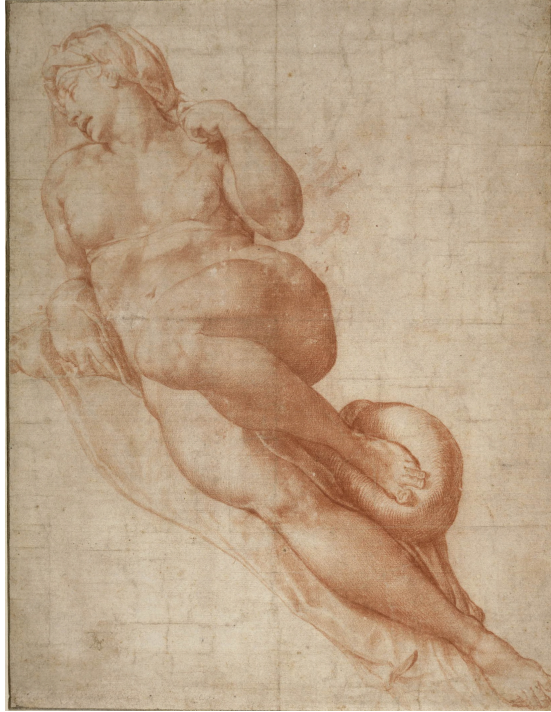
Fig. 4. Francesco Salviati, Dawn , c.1539, British Museum, London.