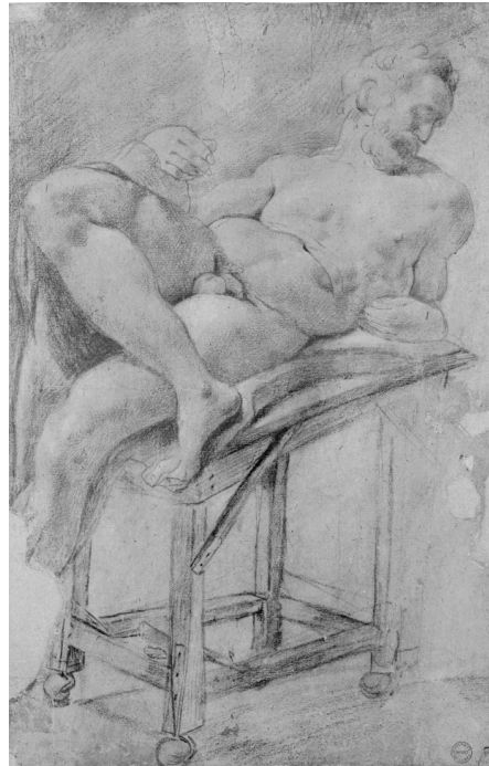
Fig. 6. Anonymous, Dusk , Ashmolean Museum, Oxford.

Joannides points out that the cart is too flimsy to support anything heavier than a plaster reduction, which he estimates to be fairly large, about half that of the original. 56