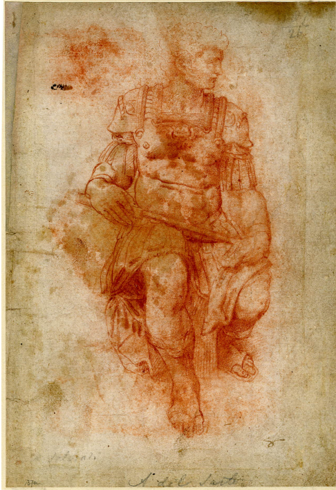
Fig. 7. Francesco Salviati, Giuliano de' Medici , British Museum, London.