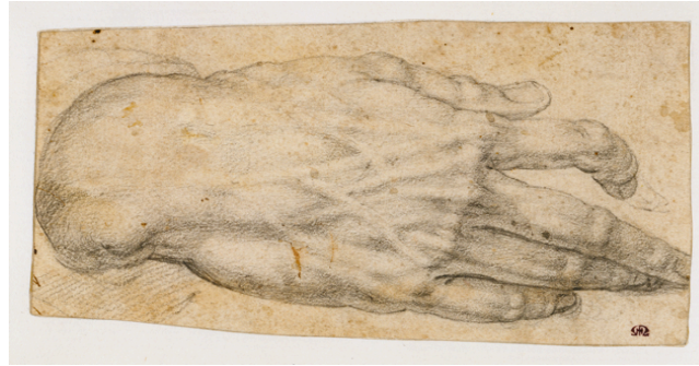
Fig. 9. Agnolo Bronzino, Study of a Man's Right Hand , c.1545-52, The J. Paul Getty Museum, Los Angeles.

16th century. 67 Patricians were as interested in these objects and images as were artists. In addition to his life-size casts, the Florentine artist-collector Sirigatti owned “a thousand” such heads, arms, legs, and torsos, if not specifically of Michelangelo’s figures. The drawings, models, and casts not only separated the statues, and even body parts, from their context, they also made them available to the Florentine social and political elite to fashion themselves after.