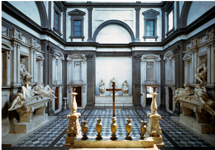
Fig. 1. Michelangelo, Medici Chapel, 1519-34, San Lorenzo, Florence.

When Michelangelo left Florence permanently in September 1534, his most famous Florentine project, the New Sacristy of San Lorenzo, or the Medici Chapel as it has been known since the late 18th century, had only two of its celebrated sculptures in place and others scattered on the floor. 1 The state that the chapel was in for the next thirteen years—and to some extent the next twenty-seven until it was finished as we see it now and as Federico Zuccaro depicted it in the 1570s (figs. 1 and 3)—determined how its contemporaries perceived and experienced the statues in it. This meant both the literal vantage points from which the sculptures could be viewed, and more broadly, the kinds of influence they might have. The visitors who entered the chapel, some even before its completion, reacted to the statues that they saw in letters and both literary and historical texts. Artists made countless copies of the sculptures in various media from the early 1530s through the end of the century. They drew the statues from almost every conceivable point of view, and sculptors made models of both individual statues and parts of their bodies.