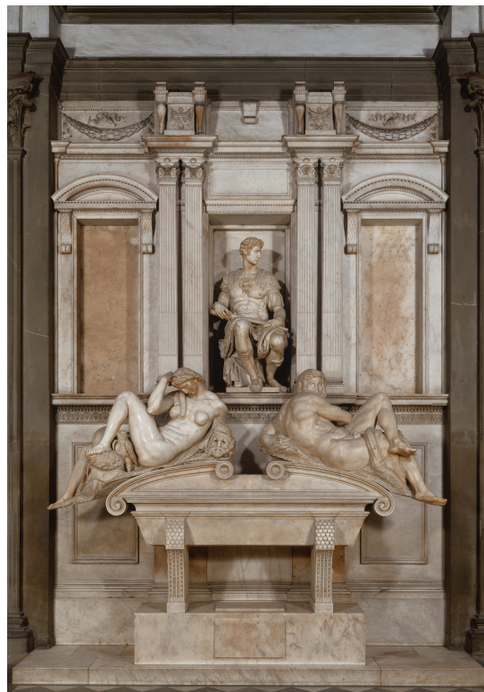
Fig. 2. Michelangelo, Tomb of Giuliano de' Medici, 1519-34, Medici Chapel, San Lorenzo, Florence.

site. 4 The chapel celebrates the two capitani , Giuliano and Lorenzo, as well as the two most illustrious family members, the magnifici , Lorenzo the Magnificent and his brother Giuliano. The famous wall tombs on either side are dedicated to Giuliano, captain of the church, and Lorenzo, governor-general of the Florentine militia, while the double tomb of the magnifici was never completed. Pope Leo instigated the conferral of ducal titles on both captains—Giuliano, duke of Nemours, and Lorenzo, duke of Urbino—as well as honorary Roman citizenship in a ceremony on the Capitoline Hill in Rome in 1513. 5 Befitting their roles as captains, dukes, and Roman citizens, Michelangelo portrayed the seated capitani in ancient Roman-style armor with bodies reminiscent of the Belvedere Torso and with distinctive gestures, which did not correspond with their characters any more than the statues' appearance did with their living prototypes. 6