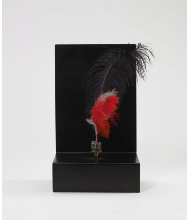
Fig. 6. Jean Tinguely, Untitled (Edition MAT), 1964, Metal, electric motor, feathers, and wire. Private Collection.