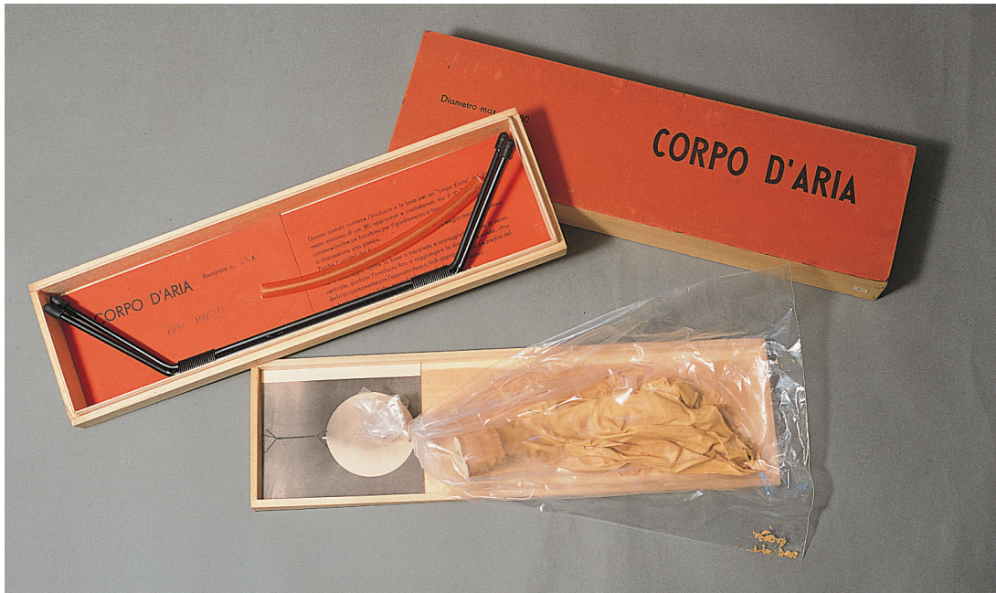
Fig. 1. Piero Manzoni, Corpo d'aria (Body of Air), Edition 45, 1959/1960, Wood, rubber, and metal, 42.5 x 12.3 x 4.8 cm. Collection Fondazione Piero Manzoni, Milan, Italy. Piero Manzoni: © 2016 Artist Rights Society (ARS), New York/SIAE, Rome.

his travels to avoid foreign duty. 38 These decisions would be critical for the creation of his future projects and would allow for the full realization of his larger artistic conception, that of a radically empowered beholder. Yet, to recognize these achievements, a better appreciation of Manzoni's practice in relation to the Italian vanguard is required, most importantly to Italy's premiere avant-garde artist and Spazialismo founder Lucio Fontana.