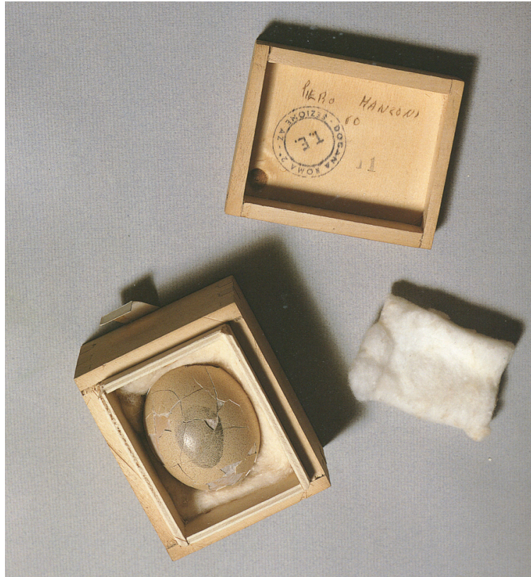
Fig. 7. Piero Manzoni, Le Uova (The Eggs), unknown number, begun July 1960, egg, wood, cotton, and ink. Sample number '11' in lid with an Italian customs stamp on the left. Collection Fondazione Piero Manzoni, Milan, Italy.

art and the commodity did not trouble Manzoni, but he was well aware of the connotations and provocative associations that this relationship held for many artists and critics. This nervousness by industrial proxy was exacerbated by Manzoni's custom claims, "samples without value" (fig. 7). Though useful in facilitating transport and passage through customs, which Manzoni described as a "Kafka story," the claim fit well the radical vision of the artist. 78