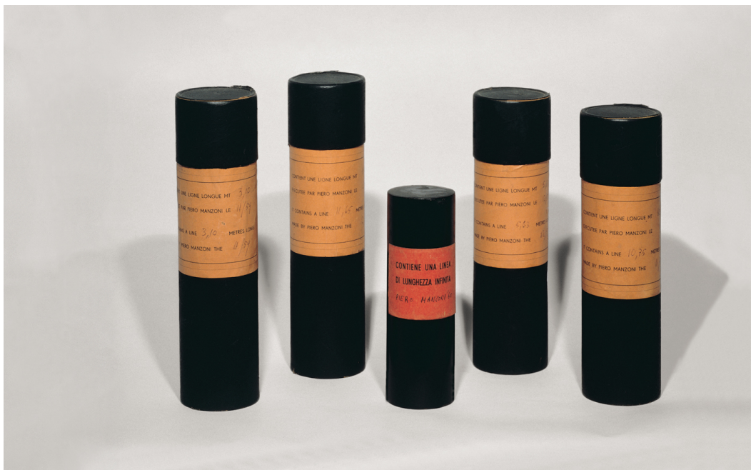
Fig. 4. Piero Manzoni, Le linee (The Lines), Approximately 87 examples, 1959-1961, Cardboard, paper, and ink, varying dimensions. Various Collections.