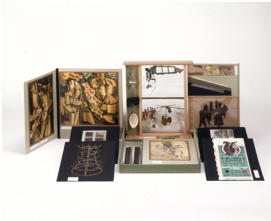
Fig. 5. Marcel Duchamp, Boîte-en-valise , 1934–1941 (Published 1942–1966), Leather, wood, metal, plaster, celluloid, collotypes, photographs and mixed-media assemblage, Edition 300). Collection of the National Gallery of Art, Washington D.C.

Schwarz and his contemporaries might be forgiven if the issue of factory labor and institutional context had largely receded from view. Despite the well-documented history of the readymade, the experience of Duchamp's work in 1959 was predominately through the luxury limited edition Boîte-en-valise (fig. 5). Begun in the 1930s, the work reproduced the nearly complete oeuvre of Duchamp, sixty-nine objects in total (some still existing and some lost) in the form of miniatures. The specially made case that held the objects doubled as a display venue, described by the artist as a "portable museum." Duchamp had the readymades recreated as handmade sculptures from which molds were cast. He reproduced the glass works on celluloid, and remade the paintings as collotypes hand-colored in a labor intensive stencil technique. 65 In 1959 only about 125 of the eventual 300 had been made, one of which belonged to Schwarz.