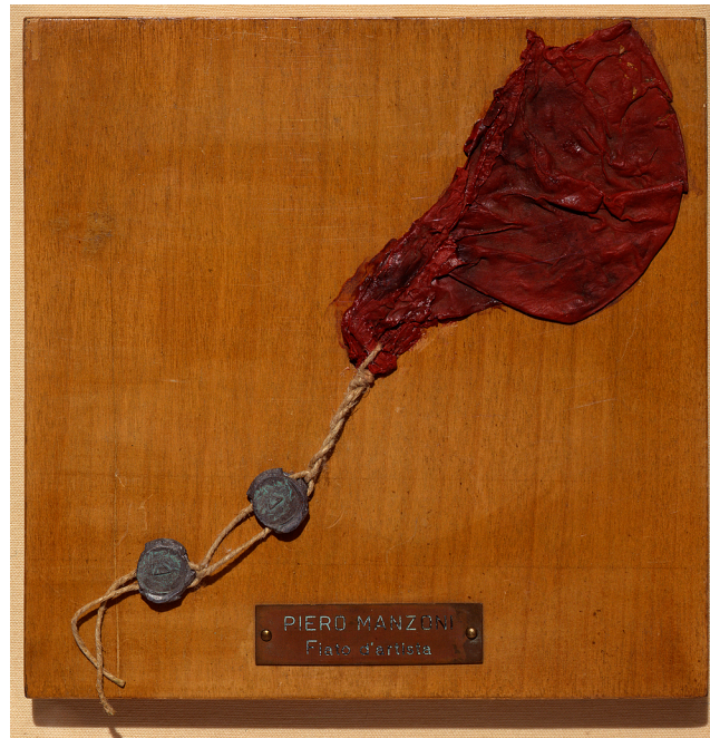
Fig. 8. Piero Manzoni, Fiato d'artista , 1960, 18 known examples, rubber, lead, and wood. Collection Fondazione Piero Manzoni, Milan, Italy. Piero Manzoni: © 2016 Artist Rights Society (ARS), New York/SIAE, Rome.

been unlimited, they would be scaled to order, and all the repetitions would be equally valuable. Manzoni's samples, however, were not yet in this state. The prototypes were duty free because their existence was in part predicated on their function as solicitations for investment. Like the unrealized status of art in Manzoni's work, the sample without value was a proposal that purchase would validate.