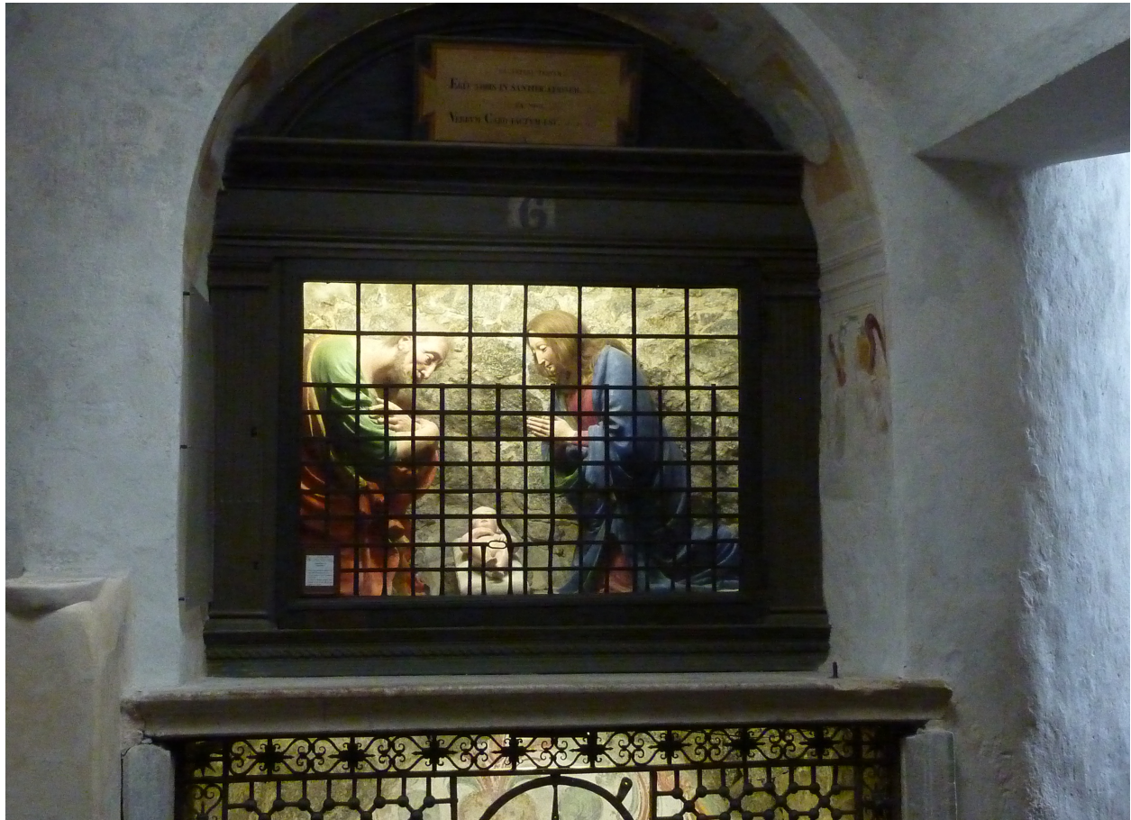
Fig. 8. Gaudenzio Ferrari, Nativity , polychrome terracotta (n.d.), Varallo, Sacro Monte.

carvers). 38 Later, he moved to terracotta, occasionally using polychrome wood for functional reasons—as, for example, with the two crucified thieves in the Calvary . We can well imagine that the increased work pace made terracotta a better choice; the modeling flexibility of clay and the rapidity with which it can be fashioned and decorated also made it ideal for intricate compositions and large polymaterial undertakings. 39