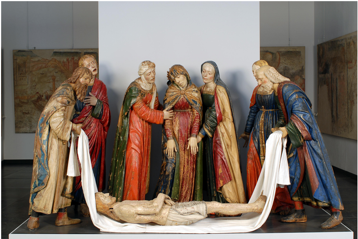
Fig. 3. Giovanni Pietro and Giovanni Ambrogio De Donati, Bewailing group , polychrome wood, c.1486–1493, Varallo, chapel of the Anointment Stone (Pinacoteca Civica).