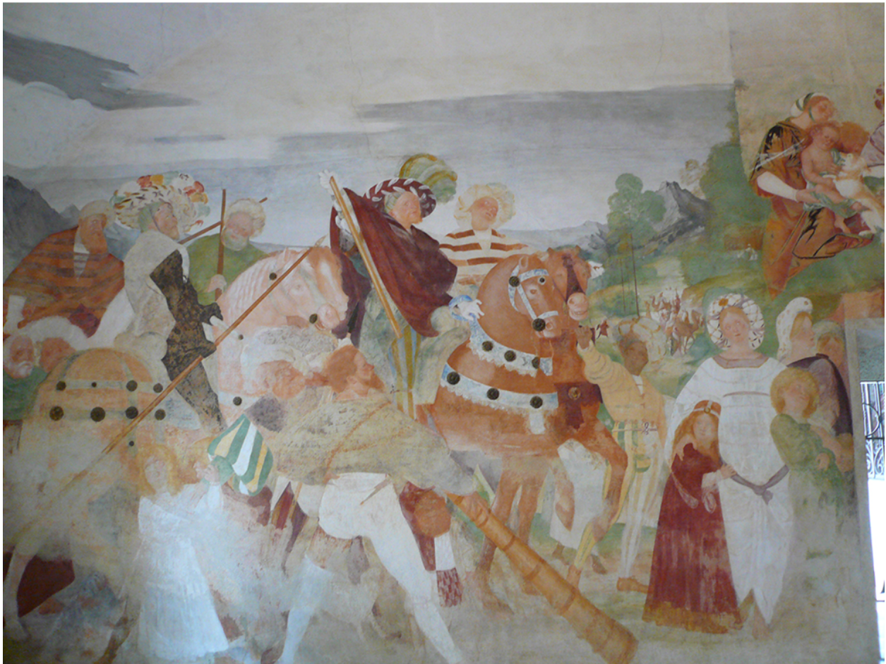
Fig. 14. Gaudenzio Ferrari, Crucifixion , fresco, c.1517–20, detail, north wall, Varallo, Sacro Monte.

The crosses are not located along the central axis of the chapel but rather placed to its left, past the single pillar: standing to the left of the support—where the space opens to accommodate a small crowd—the main composition is entirely contained in the viewer's field of vision. The upturned heads and lances of the soldiers direct the gaze upward, while the gestures of the thieves (a tilted head, a projected arm) lead the eyes to the figure of Christ. In front of Christ's cross is a freestanding mounted white horse, looking straight ahead with one leg lifted. Its rider's right arm, upturned, holds a mace, whose round top points to Christ's body. With a blank expression, left hand on his hip, the soldier stares in the direction of the viewers, seemingly oblivious to his surroundings. In spite of his weapon, the overall gesture appears more a salutation than the menacing signal it should represent.