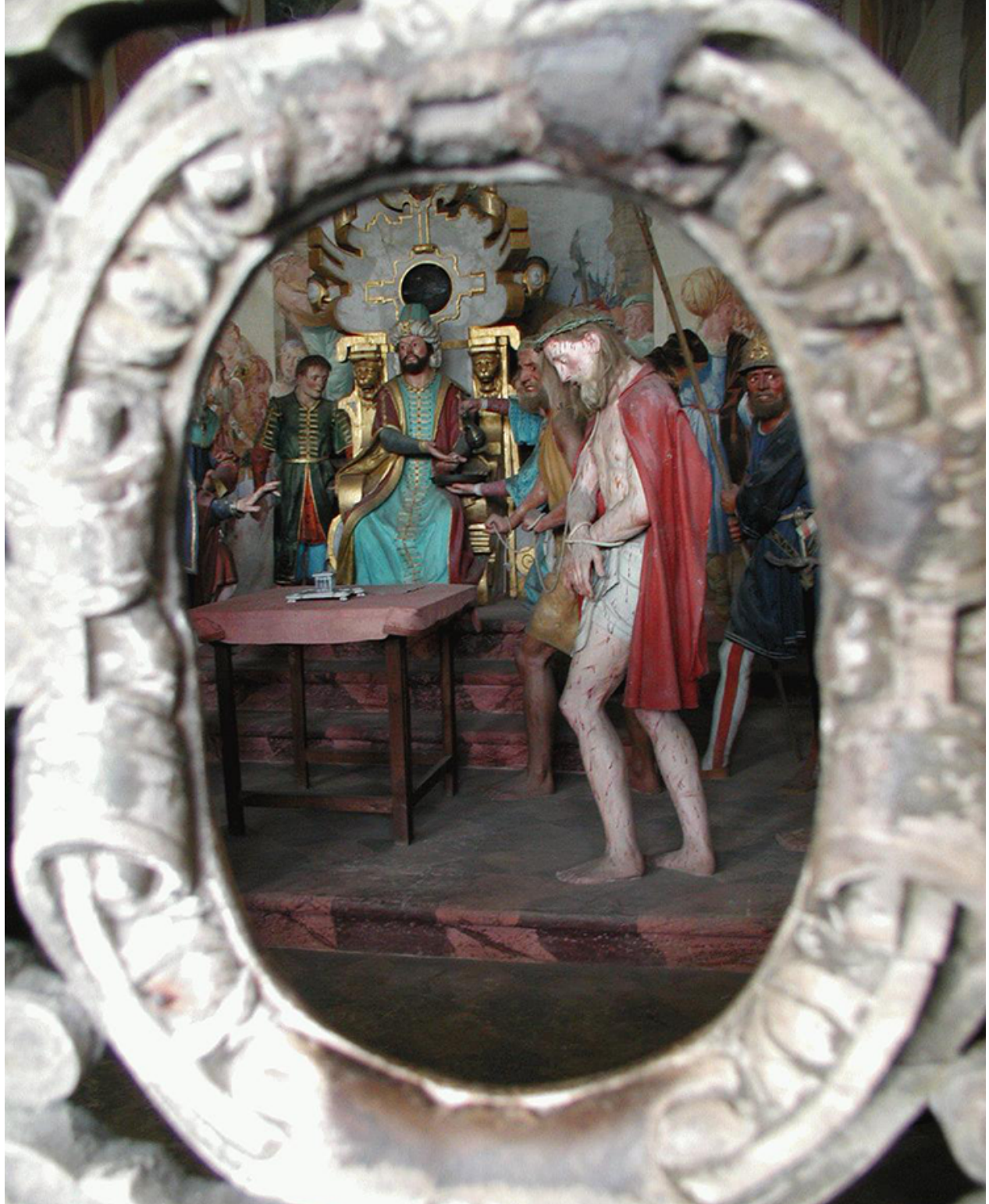
Fig. 5. View of Christ in front of Herod through a hole in the ornamental screen, Varallo, Sacro Monte.