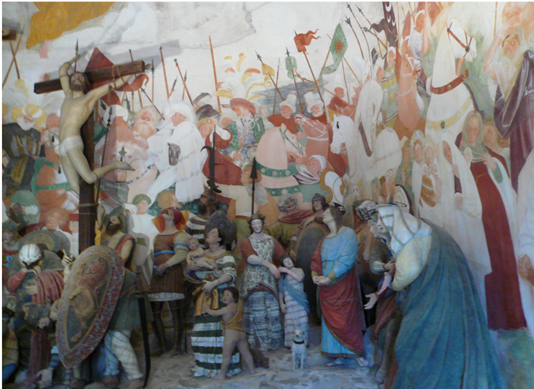
Fig. 12. Gaudenzio Ferrari, Crucifixion , terracotta and mixed media, c.1517–20, detail, south-east corner, Varallo, Sacro Monte.

myriad female spectacles of grief, reflected in the prism of silent witnesses whose pained expressions are a mute echo of the Virgin's suffering.