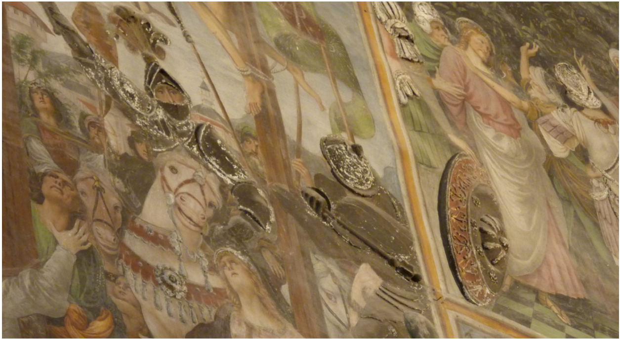
Fig. 7. Gaudenzio Ferrari, roodscreen with scenes from the Life of Christ, detail with pastiglia decorations, 1513, Varallo, Santa Maria delle Grazie.

Much of Gaudenzio's initial production at the New Jerusalem consisted of mobile sculptural groups placed in pre-existing structures: a proliferation of three-dimensional decoration ensuing from the Christological and Marian emphasis gradually imposed over the initial topomimetic character of the sanctuary. By 1514, Gaudenzio had executed the Sleeping Virgin , 36 the kneeling Magdalen in the antechamber of the Sepulcher, and the Annunciation group. He also completed the decoration of the Bethlehem complex with the figures on the altar of the Nativity (fig. 8), the Manger (now the Adoration of the Shepherds ), and the Circumcision . 37