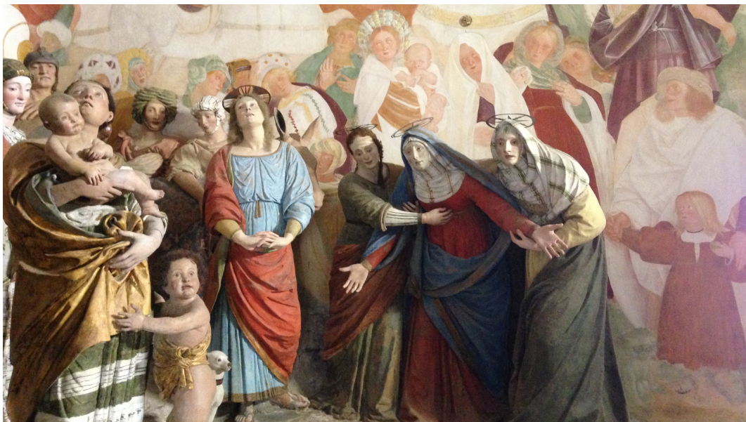
Fig. 13. Gaudenzio Ferrari, Crucifixion , terracotta and mixed media, c.1517–20, detail, south-east corner, Varallo, Sacro Monte.