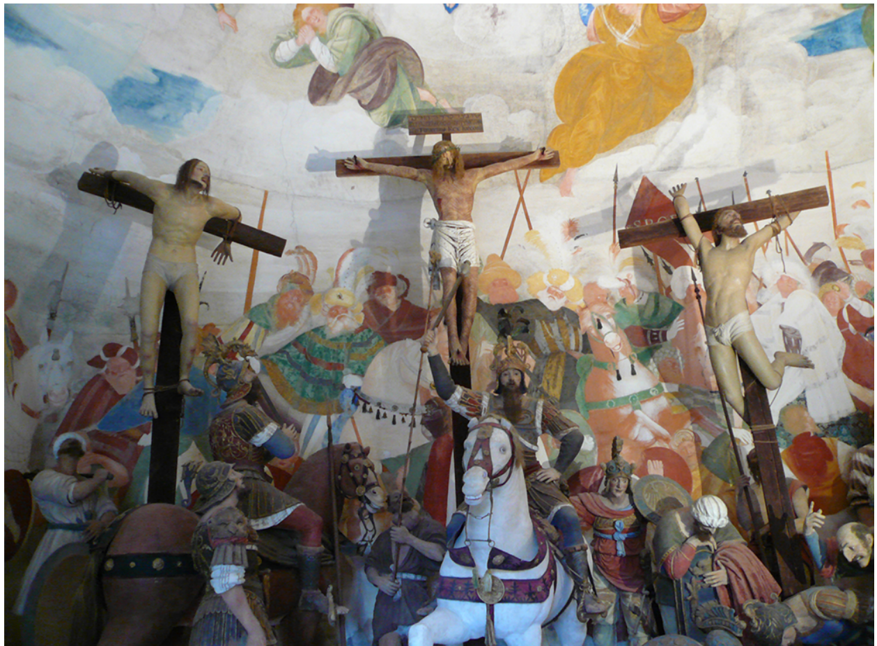
Fig. 15. Gaudenzio Ferrari, Crucifixion , fresco, wood, terracotta and mixed media, c.1517–20, detail, east wall, Varallo, Sacro Monte.

Unlike the two thieves, whose postures bespeak their imminent destinies, Christ is composed and static in death, a fully frontal icon dominating the scene as focal point of devotion (fig. 15). Christ's cross is quite taller than the others: his head and torso rise above the two and three-dimensional crowds, isolated against the background clouds. Soldiers on horseback and on foot animate the compositional foreground, their attention drawn to Christ. Four of them cast lots at the foot of the right cross, below the damned thief: fully focused on their game, they anchor the scene and highlight the cleft in the rock, bridged by a shield on which the dice are rolling. The ostensible neutrality of the soldiers—close to visitors and yet remote and incommunicative in their concentrated activity—and the leisurely tone of the scene lend the sacred event a mundane feeling and mediate between represented past and physical present.