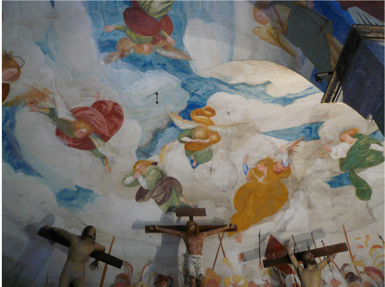
Fig. 16. Gaudenzio Ferrari, Crucifixion , fresco, c.1517–20, detail, Grieving Angels , Varallo, Sacro Monte.

weaponry were covered in tin leaf and many bore gilded accents in wax or stucco made on the surface by means of a punch. The ornaments on the horses' harnesses (studs, tassels, and buttons) were formed in stucco, wax, cloth, paper and metal leaf. Gold was used everywhere: sometimes it was applied in thin leaves as with garment embellishments, turbans and horses' tacks. Other times it was applied as paint—a mixture of gold powder and glue—to highlight figures in shadow or to render painted textiles more precious. The wall (painted last, after the clay sculptures were in place) is painted in buon fresco , with occasional a secco retouchings, mostly in azurite and malachite; angels' halos and garment hems are painted in intricate nets of tiny gold strokes and tinier flowers.