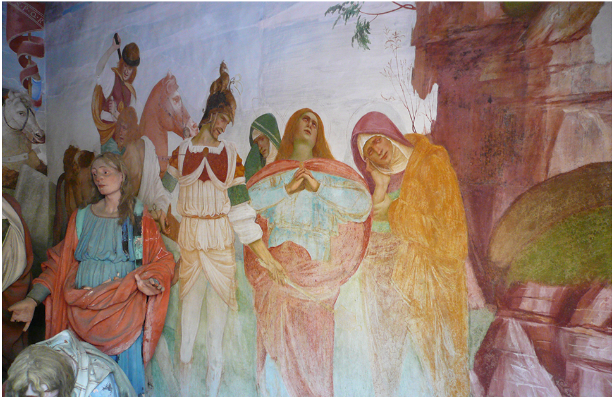
Fig. 10. Gaudenzio Ferrari, Christ Stripped of his Garments , fresco, c.1505 (now chapel of the Pietà ), Varallo, Sacro Monte.

dimensional imagery in an existing space. What the effect was of this first attempt to create a total environment through polymateriality is, however, impossible to say: the wooden tableau was long ago moved at the foot of the scala santa , where it stands among seventeenth-century terracotta sculptures in the Christ led to the Praetorium . The fresco was re-used (with additions) for the chapel of the Pietà at the foot of the Calvary: it is still partially visible in the wall decoration executed by Giovanni D'Enrico around 1635 with the new sculptural tableau (fig. 10).