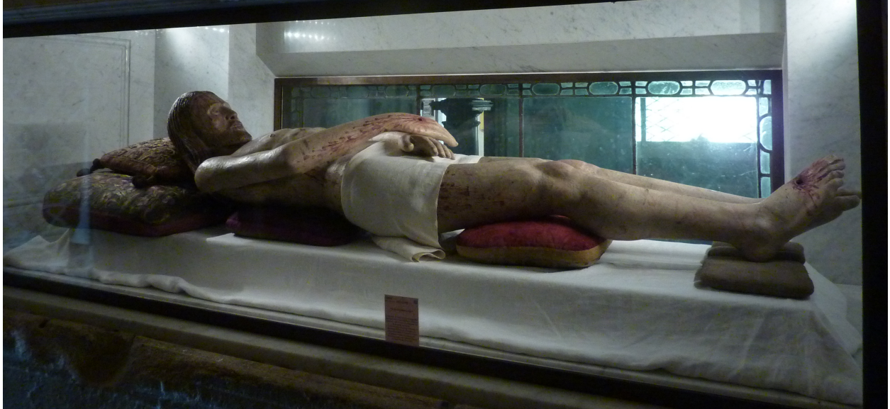
Fig. 2. Anonymous, Dead Christ , polychrome wood, c.1486–1493, Varallo, Sacro Monte.