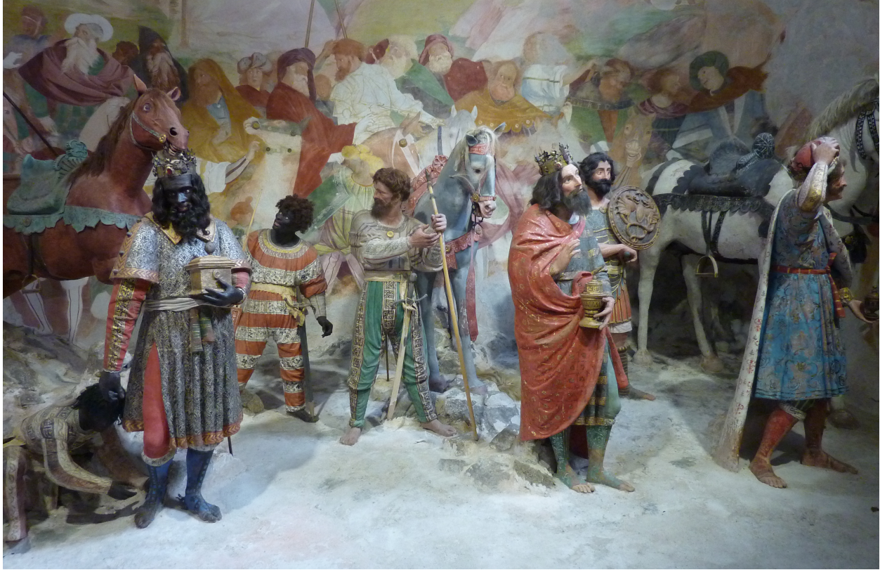
Fig. 11. Gaudenzio Ferrari, The Arrival of the Magi , fresco, terracotta and mixed media, c.1517–28, Varallo, Sacro Monte.