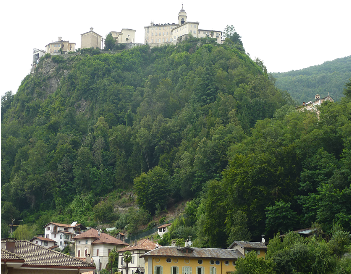
Fig. 1. The New Jerusalem at Varallo viewed from the town.