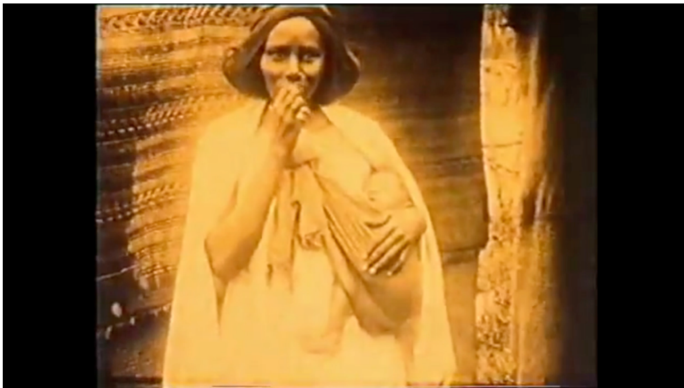
Fig. 8. Dal polo all'equatore . Return gaze.