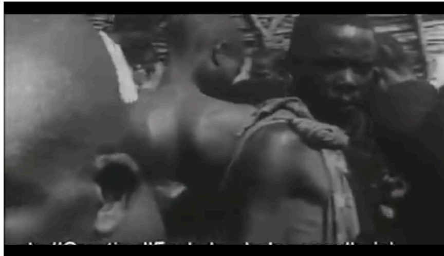
Fig. 12. Appunti per un'Orestide Africana .

Gramscian notions of the national-popular and the organic intellectual, Pasolini's reflections on pedagogy attempted to instruct subcultures in how to resist assimilation by the hegemonic forces of Western consumer capitalism.