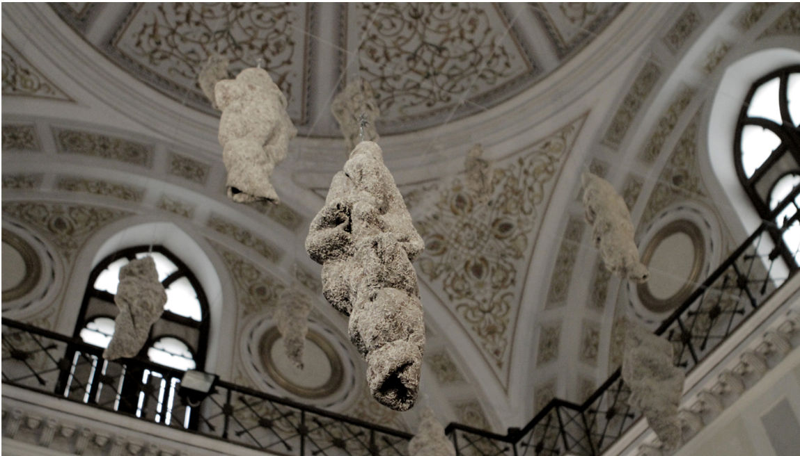
Fig. 2. Ode to the Perished .

After several months, Larsen planned to remove the forms and exhibit them publicly, as he had done with an earlier work on trans-Aegean migration, Ode to the Perished , which premiered at the Thessaloniki Biennale in 2011 (Fig. 2).