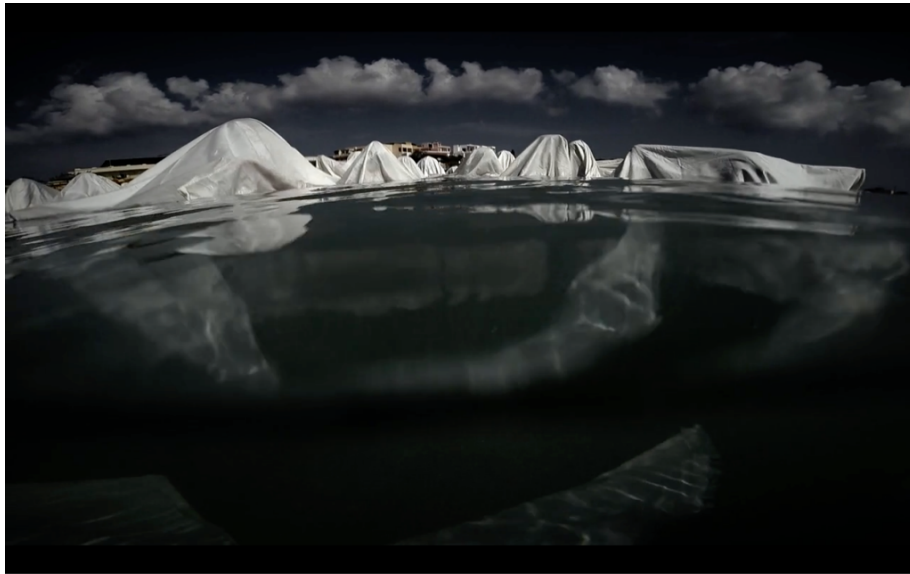
Fig. 22. Asmat—Nomi . Fisheye of floating figures.

Critically, Yimer’s figures—unlike those memorialized by Larsen using concrete canvas (Fig. 21)—are reenacted by enshrouded living bodies positioned upright, gracefully bobbing up and down at the sea’s surface (Fig. 22). A fisheye lens positioned on the same plane as the floating figures captures their forms both above and beneath the water line.