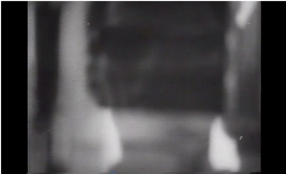
Fig. 9. Appunti per un'Orestiade africana , 1970; dir. Pier Paolo Pasolini.

Pasolini was acutely aware of the implications that Gianikian and Ricci Lucchi’s film so eloquently illustrates—the violence that inheres when a white, Western man turns his authoritative camera to unnamed, silent African people (Fig. 9).