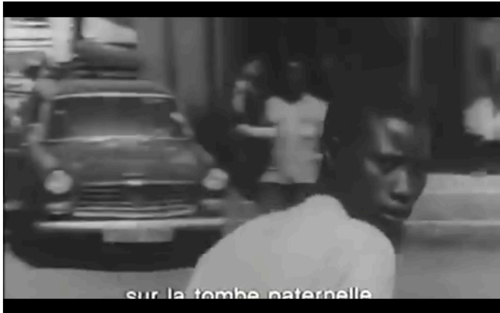
Fig. 15. Appunti per un'Orestiade africana . Return gaze.

disorientation is the desperately seeking mobile camera, whose objects peer back at it, playfully evading capture by its lens (Fig. 15).