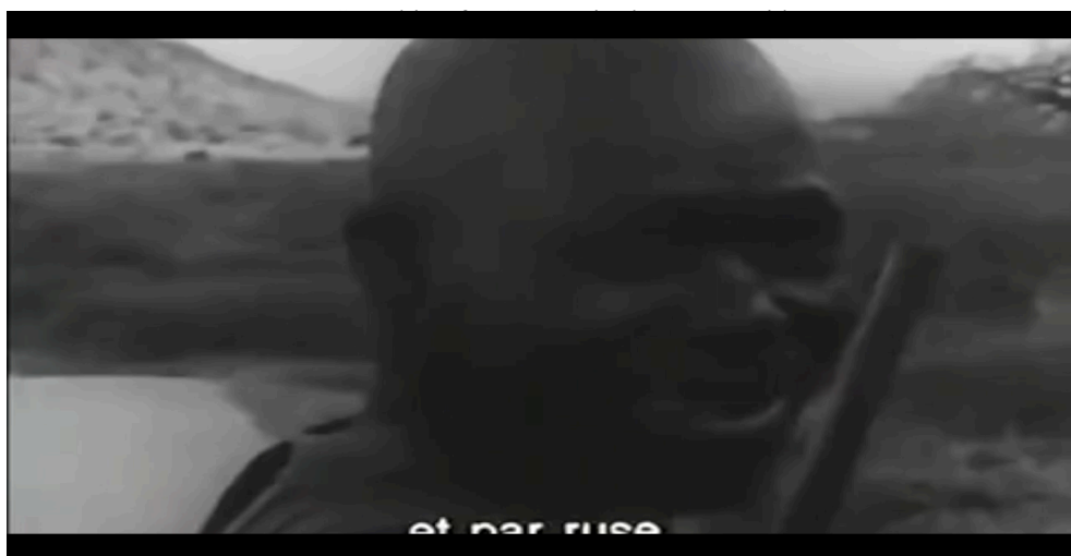
Fig. 13. Appunti per un'Orestide africana . Casting in the countryside.