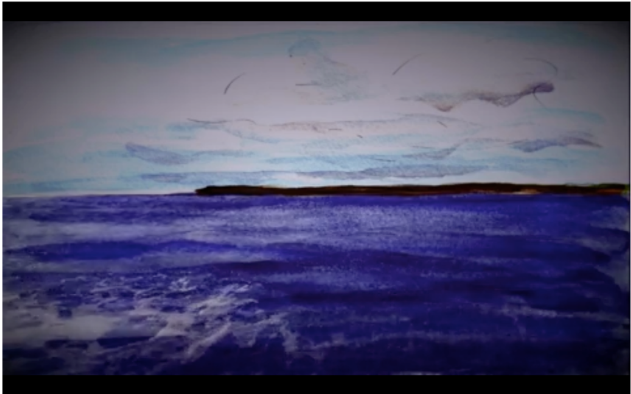
Fig. 17. Asmat—Nomi , 2015; dir. Dagmawi Yimer.

Returning to the scene of contemporary migration in order to trace the persistence of the spectral in its cinematic responses, I turn to the Ethiopian-born filmmaker Dagmawi Yimer’s 2015 Asmat—Nomi (Names in Memory of the Victims of the Shipwreck at Lampedusa). In his short film commemorating the more than 350 people from the Horn of Africa who drowned on October 3, 2013 less than a mile off the coast of the Italian island of Lampedusa, Yimer foregoes documentary realism and linear narrative for the painterly, fragmentary, and poetic. 41 The film opens on a black screen with a woman’s voiceover humming a melancholy melody.