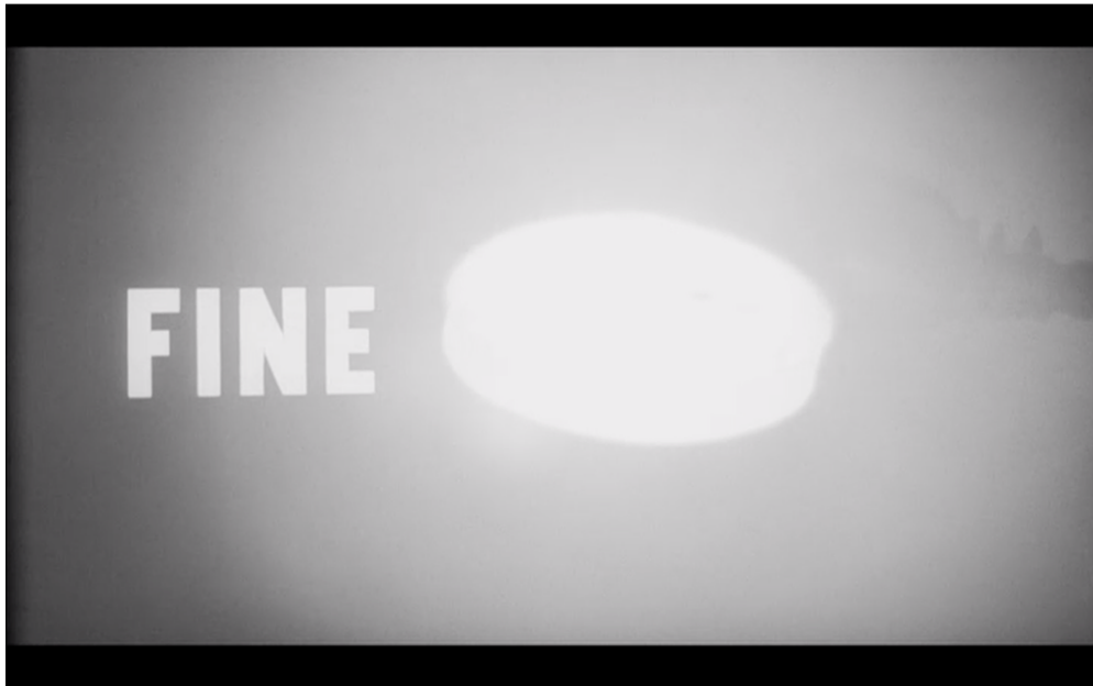
Fig. 3. L'eclisse , 1962; dir. Michelangelo Antonioni.