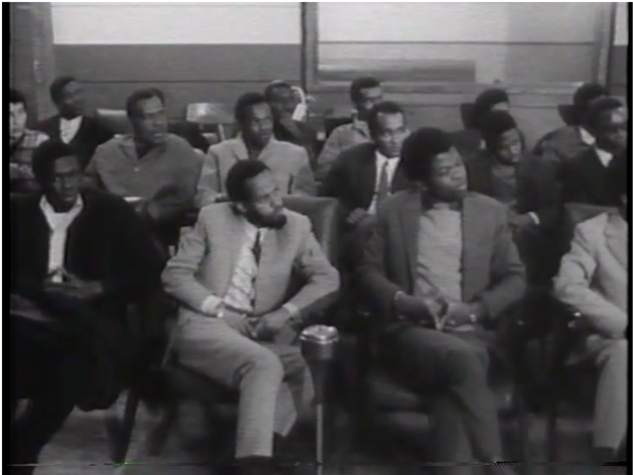
Fig. 10. Appunti per un'Orestiade africana . “African students” at the University of Rome.

The film, in fact, opens with a self-reflexive gesture, “Here I am with the camera reflected in a plate glass window of a shop in an African city,” Pasolini explains. The film’s second section turns to a classroom full of African students at the University of Rome, for whom he screens his footage and explains his project. Their responses are overwhelmingly skeptical, “Africa is not a nation, it’s a continent,” one student feels compelled to clarify: “I don’t see the connection.” These students, armed with both language and an unequivocally dubious return gaze, use both to cast the project into crisis (Fig. 10).