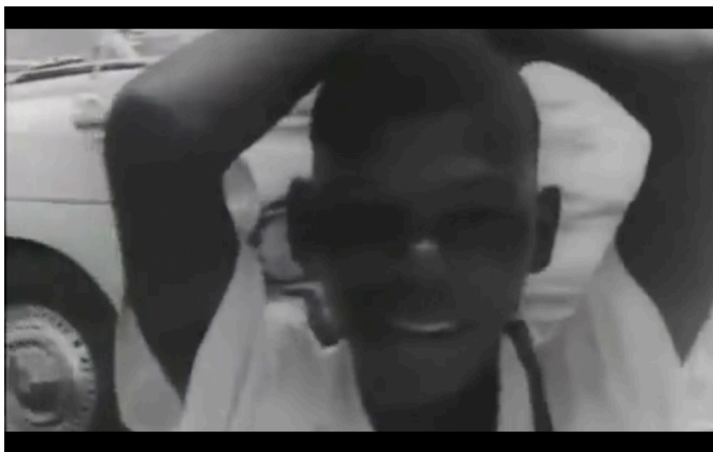
Fig. 14. Appunti per un'Orestide africana . Schoolboy in “Western” clothing.

To illustrate the distinction between Gianikian and Ricci Lucchi’s and Pasolini’s respective spectro-temporalities, and the disjunction or juxtaposition that I suggest characterizes Pasolini’s formulation of the “time lag,” we might consider the sequence, drawn from the opening minutes of the film, in which Pasolini’s disembodied voice recites a summary of the Oresteia of Aeschylus over a series of close-ups of people in the countryside (Figs. 12, 13) and in a village cluttered with cars, where residents wear crisp white “Western” clothing (Fig. 14).