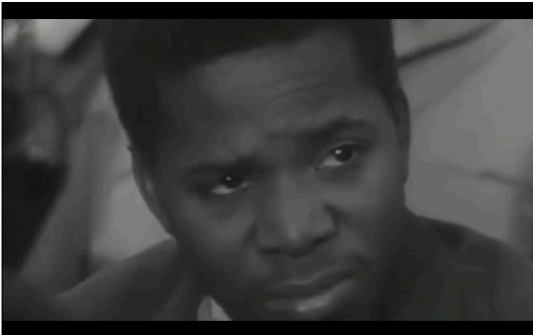
Fig. 16. Appunti per un'Orestiade africana . Skeptical student at University of Rome.

After several shots on location in Tanzania and Uganda, a cut to the “African students at the University of Rome” (the only “Africans” to receive acknowledgment in the film’s opening credits) creates a further disjunction.