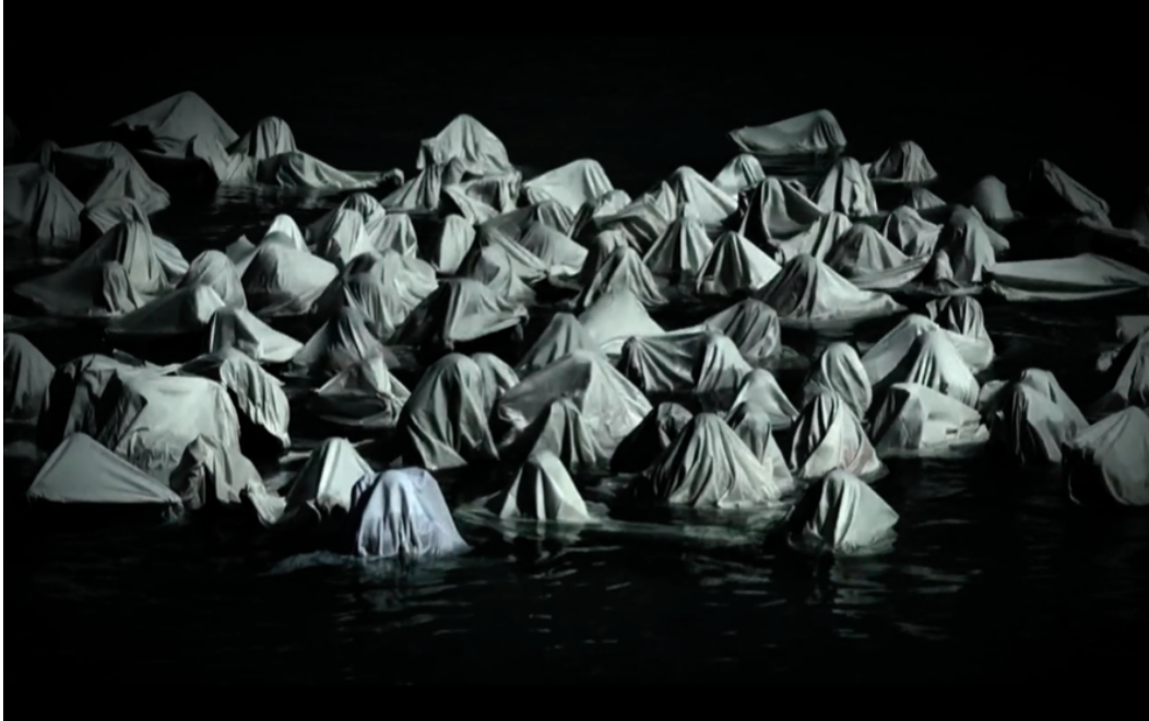
Fig. 20. Asmat—Nomi . Figures draped in funerary sheets standing in water.

A full ten of the film's seventeen minutes is dedicated to the same woman's voice reciting the names of the victims and their English translations—"my hope," "we wanted her," "Joy," "God's treasure," "she is chosen," "no one is like him," etc. The names are recited over slow-motion images of numerous upright bodies standing in the nighttime sea, draped in funerary sheets that explicitly evoke the countless photographs of the drowned circulated in the international press (Fig. 20).