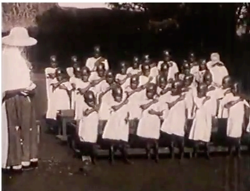
Fig. 7. Dal polo all'equatore . Colonial missionary school.