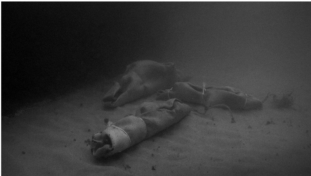
Fig. 21. End of Dreams . Seabed.