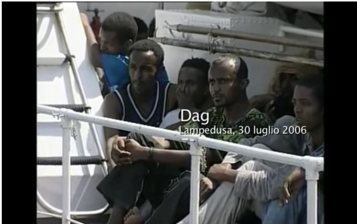
Fig. 24. Come un uomo sulla terra , 2008; dir. Dagmawi Yimer.

From the outset, Yimer's project sets up a number of oppositions—between motion and fixity, past and present, presence and absence, and life and death—also appearing in the spectropoetic works of Larsen, Gianikian and Ricci Lucchi, and Pasolini. In Yimer's film, the effect of such oppositions is a disruption of the temporalities of migration and its representations. His choice of the static watercolor and the anonymous reenactment, as opposed to the temporal immediacy of photo-journalism, underscores the filmmaker's aim to, in his words, "give space to these names without bodies." Despite the film's explicit memorialization of a mass drowning—or perhaps because of it— Asmat refuses to reproduce the embodied spectacle of migration as "crisis" so prevalent in the global media—a spectacle in which, in 2006, the filmmaker had himself unwittingly, and, we may presume, nonconsensually, participated (Fig. 24).