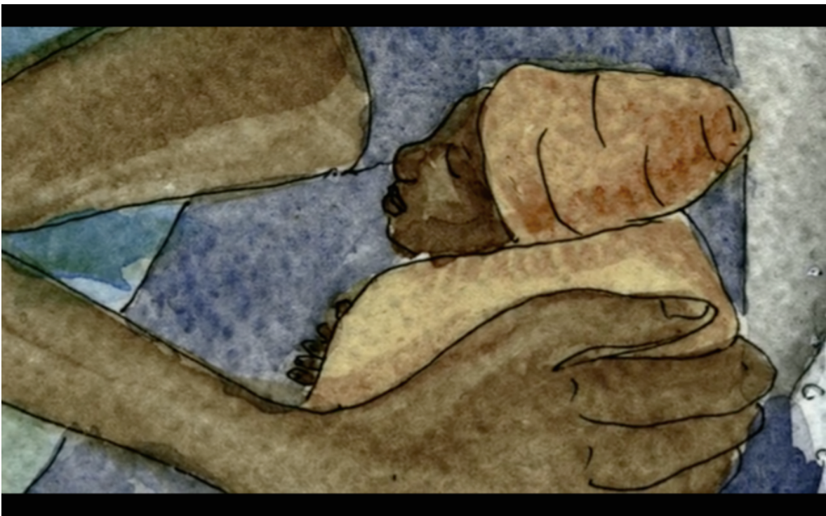
Fig. 19. Asmat—Nomi . Infant in arms, watercolor still.