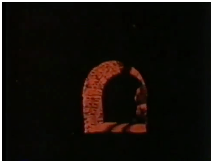
Fig. 4. Dal polo all'equatore , 1986; Gianikian and Ricci Lucchi.

licking a salt block in Morse code, thereby “inscribing” the blocks with the names of the dead by ingesting the salt. “The inscription of names is simultaneously an erasure,” writes Merjian. “[T]he remembrance of those 16,136 bodies become wrought upon the salt slab through a subtractive action. Commemoration here takes the form not of an accretion,” Merjian concludes, “but of an absence.” (“History + Distance X Mass—Memory,” 147—148).