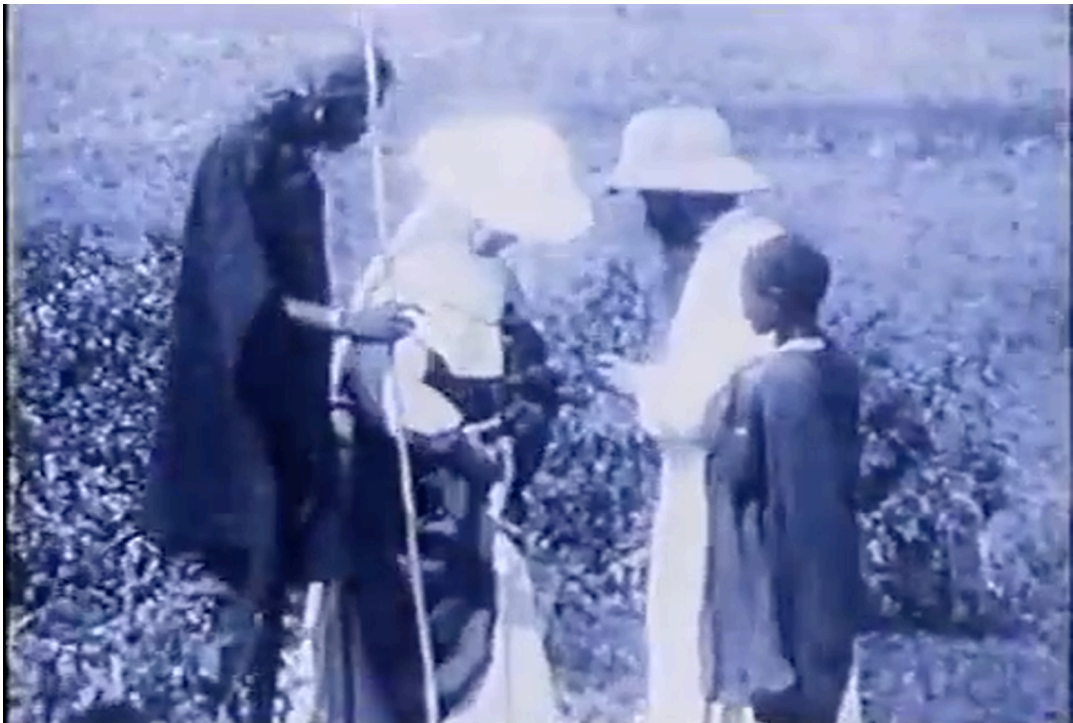
Fig. 5. Dal polo all'equatore . Baptism.

This opening train sequence sets the stage for a number of subsequent scenes clustered around the theme of mobility pertaining to travel, war, colonial conquest, ritual, procession, and the motion picture itself. 22 Gianikian and Ricci Lucchi's deceleration articulates, joining what would otherwise seem geographically and temporally disparate fragments into thematic constellations that provoke ethical contemplation. For instance, one sequence binds the baptism of a presumably autochthonous infant by white European missionaries dressed in gleaming robes and sun hats, the march across a river of unclothed locals carrying the flag of the Kingdom of Italy along with what one presumes are the possessions of missionaries or colonists, and an outdoor classroom at a colonial Christian mission, where a clergywoman instructs a group of roughly thirty schoolchildren in the gestures of genuflection and prayer (Figs. 5–7). The delayed and disjunctive temporality of the moving images invites viewers to reflect on the links between mobility and the disciplining of colonial bodies past and present, or, in Gianikian's words, memory as a "reading of the present."