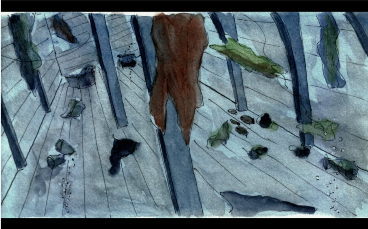
Fig. 18. Asmat—Nomi . Submerged ship hold, watercolor still.