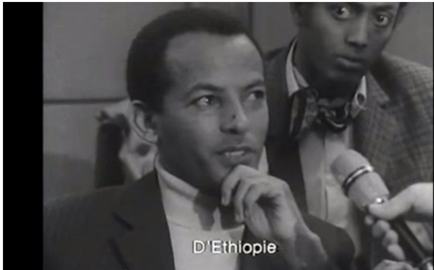
Fig. 11. Appunti per un'Orestide africana . Ethiopian student.

students labor in the fields before silently contemplating textbooks imported from Europe, to a classroom at the University of Rome, where students vocally contest the filmmaker's project, might be read as symptomatic of Pasolini's attempt to break with a colonial politics of knowledge through the spectro-cinematic mode of contamination, disjunction, and anachronism. Italian colonialism haunts this sequence; Pasolini's most vocal critic is an Ethiopian student who challenges the project saying, "Non sono pratico dei film, però non vedo la connessione ("I'm no film expert, but I don't see the connection") (Fig. 11).