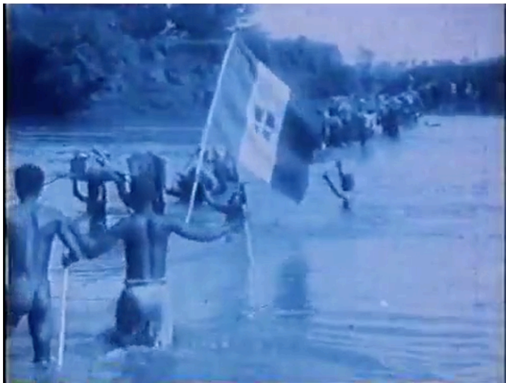
Fig. 6. Dal polo all'equatore . River crossing with Kingdom of Italy flag.