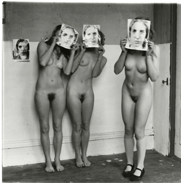
Fig. 5. Francesca Woodman, About Being My Model , Providence, Rhode Island, 1976. Gelatin silver print. © 2020 Estate of Francesca Woodman / Charles Woodman / Artists Rights Society (ARS), New York. This image is not covered by this article's CC BY-NC license.