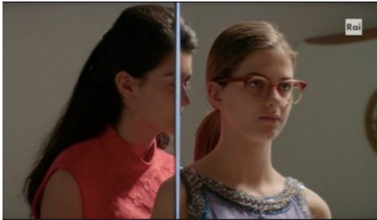
Fig. 8. Saverio Costanzo, L'amica geniale: Storia del nuovo cognome , 2020, Still.

side. 27 The sequence that frames Lila and Stefano’s first night of their honeymoon represents a horrific climax in this sense; the shot preceding the scene in which Stefano rapes his reluctant wife shows his face monstrously deformed as it appears multifaceted through the glass door of the bathroom where Lila is hiding. Costanzo successfully manages to represent Ferrante’s portrayal of smarginatura as strongly inflected by a gender perspective. When it refers to Lila’s perception of certain male bodies it takes on the features of disfigurement, deformity, brutality, and monstrosity; when it is identified as a self-perception (always female), it is portrayed as a form of fragmented self. 28 Interestingly, during the viscerally frightening scene of sexual violence, a strategic perspective shot brings the viewer directly into Lila’s viewpoint as she lies on the bed like a dead, inanimate body in order to withstand the abuse, and in so doing she stages a sort of dissociated being. Her imaginary dissolution from herself and the surrounding world – her smarginatura – is indeed a subtle form of dissent that will allow her to cross several boundaries within the oppressive confines of her multiple roles as wife, mother, lover, brilliant entrepreneur and exploited factory worker.