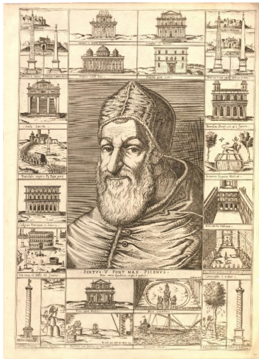
Fig. 1. Ambrogio Brambilla, bust portrait of Sixtus V. Published by Nicolaus van Aelst, 1589. Etching on paper, 505 × 357 mm. The British Museum. Registration number 1947,0319.26.16, https://www.britishmuseum.org/collection/object/P_1947-0319-26-16.

churches and expanding transportation routes to and from the city. 80 Twenty-eight of these renovations appear as engravings surrounding the bust portrait of Sixtus V by Ambrogio Brambilla, dated 1589 (fig. 1). The Latin inscription that appears just below Sixtus’s name recognizes the pope’s key role in these works’ design and completion. Four of Rome’s obelisks, which Sixtus restored, appear on the top left and right corners, not far from Brambilla’s careful reproduction of the city’s main roads, the Vatican Library, and the scene of St. Didacus’s canonization.