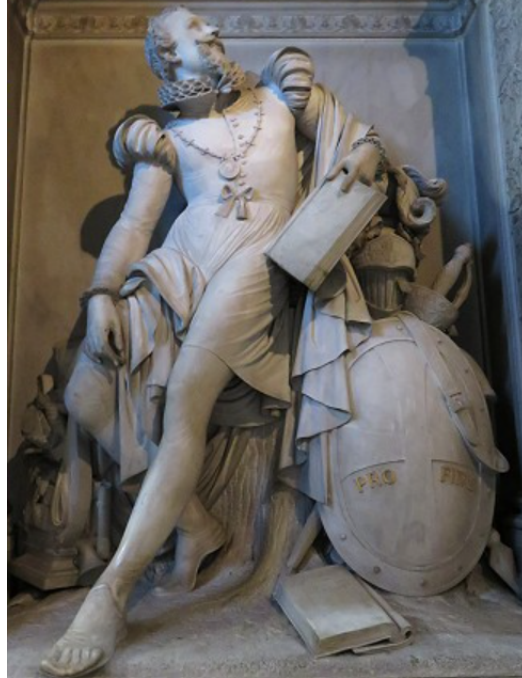
Fig. 2. Giuseppe De Fabris (1790–1860), statue of Torquato Tasso. Chiesa di Sant’Onofrio al Gianicolo, Rome.

laurel wreath in hand. The image of the praying Virgin sits directly above the poet, accompanied by a group of cherubs. The arch's golden-rayed cross crowns the monument's top, a theme present in most Catholic sepulchral structures, leaving Tasso to rest eternally within a double triumph: one commemorating life and the other gesturing toward life after death.