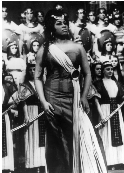
Fig. 8: Leontyne Price as Aida, 1964

This “white diva” still mainly performed roles bearing the marks of ethnic difference: whether African, gypsy, Japanese, or Indian, the white diva’s body was “made up” to put ethnic difference on show for the pleasure of the Western eye. Yet, this body also performs a paradigmatic shift that welcomes on Aida ’s scene of power the ever-changing voice of the many performers who have interpreted and embodied her over the centuries, what Carolyn Abbate defines as “the transgressive acoustics of authority that operate during performance” (1993, 235). 21 The gendered, racialized body of the singer playing Aida becomes the performative locus where the opera’s strategies of representation come undone, showing – beyond the pretence to an authentic and authoritative representation of Otherness – the seams of costumes and the cracks in the blackface makeup.