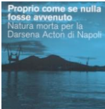
Proprio come se nulla fosse avvenuto (Roberto Andò)