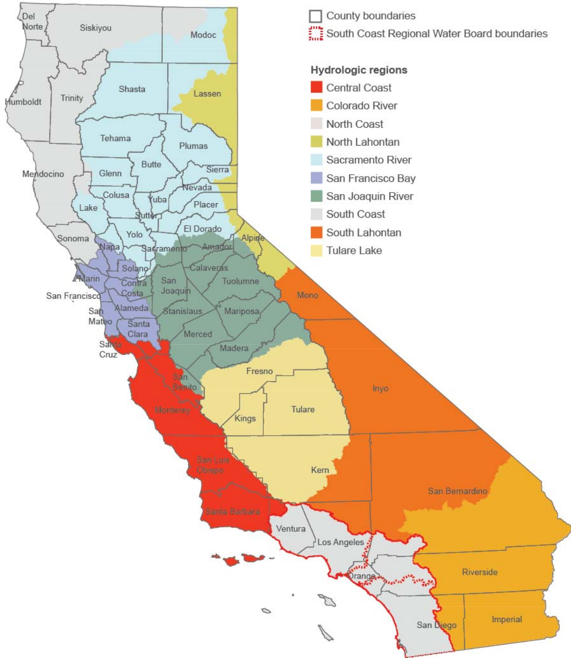
Figure 2. California has 10 hydrologic regions