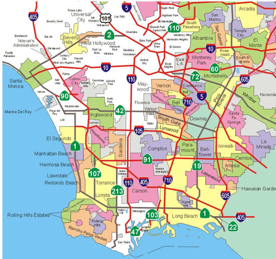
Figure 1. Map of Southern Los Angeles County (with color coded municipalities and unincorporated areas)

Vernon and its neighbors lie just above the center point of the map.