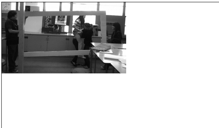
Figure 3. One photograph included in Jenny’s “Flipbook Unit” Documentation.

Jenny’s description of this photograph stated: This picture illustrates how students showed movement across picture by entering from both sides. According to student comments, the group was attempting to show two flying objects (bird and airplane) as they collided.