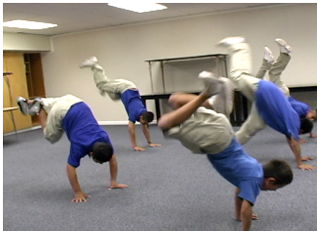
figure 7. Eloy Junior High School students practicing their choreography.

the teacher right next to you.” More interesting were the middle school responses with 40% preferring a VC dance teacher. One seventh-grader shared, “It is a lot like having the dance teacher right here. You just have to be active and participate more. We have to work hard to memorize the steps. With a VC teacher you can’t just dance it a little... you have to dance it fully.....” Addressing the anonymity that the distance provides, another student stated, “I [felt] more comfortable dancing when the teacher was far away.” Another discussed the accessibility found in VC: “When you are face to face, you feel kinda shy.... and it is kinda hard to look in their eyes and talk, but with VC it is easier to talk to the teachers.” Several of the older boys who had expressed concern with dancing, believing it to be “a lame activity,” ended up our most enthusiastic supporters.