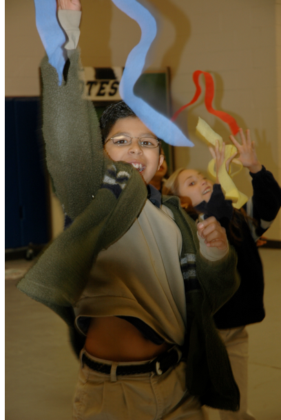
figure 11. Eloy students express the joy of dancing in iDA.

critiques, coaching sessions, and even improvisation jams (figure 10). iDA VC fostered a hands-on understanding of the potential of VC and appreciation of how dance can be a mode of expression for students. iDA research shows VC as a viable method for bringing dance education to rural communities.