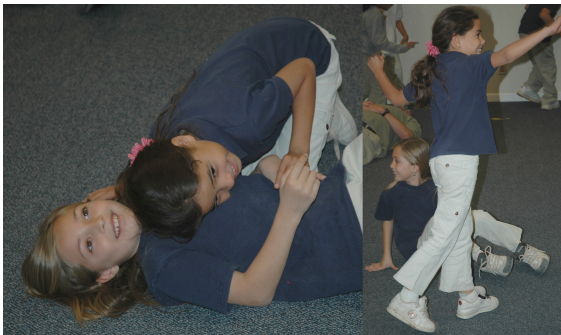
figure 5. Third graders listen to partner's heartbeat and dance to the rhythm of their heart.

At the start of the research, several of the older students dropped out of the iDA program perhaps due either to the dance content or to their feelings of vulnerability as a consequence of perceived overexposure by the medium. However the great majority of students were excited by the potential of the technology and eager to be connected to and seen by others. "It's like I'm a star on TV." One student discussed how the projection screen offered him a new perspective on his body. "It was so cool seeing myself moving. It was weird at first, but now I kind of like it. With the big screen copying my moves, I feel my dancing differently." The two age groups responded to VC differently. Intent on being seen by the teacher, the third grade students clumped together in front of the camera, while the older students congregated in the back of the room just out of range of the camera. As the VC sessions continued, the middle school students' shyness diminished, and their personalities began to emerge, while the third graders learned that the iDA teacher could see everyone in the class (figure 5-8).