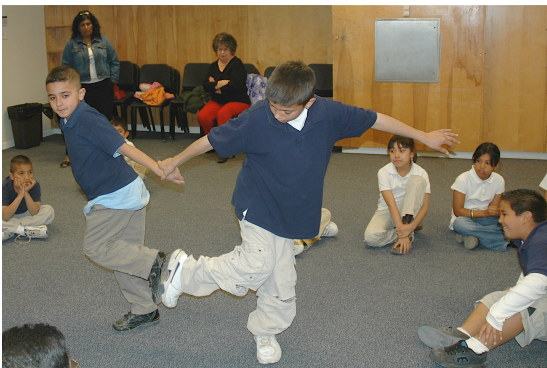
figure 9. Third graders presenting their symmetrical shape studies.

VC granted students from Eloy, Arizona access to dance that was previously unavailable. The richness of the medium made it possible for the students to be involved in experiences that extended beyond traditional lectures. VC methods proved functional when presenting choreography and leading dance sharing reflections. For the most part, image quality was good, allowing us to see the students' movements and to provide guidance and feedback. Over the course of the research, Eloy students were able to move three-dimensionally, perform for others, and analyze their own and others' works (figure 9). iDA employed manipulatives (scarves, elastics, fabric, protractors, and games) and technological tools (digital video, PowerPoint, and ELMO), in an effort to create a dynamic learning environment and to address the different learning styles of the students.