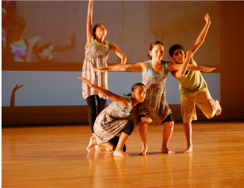
Fig. 4 Gage Middle School students perform modern dance at UCLA Symposium.

In California, the task of credentialing teachers in the approved arts disciplines has primarily been relegated to the California State University system, while research oriented universities have generally steered clear of this issue. However, there is a precedent for inclusion of arts education programs in research universities. For example, reputable research universities--including Harvard University, New York University, and the University of California, Berkeley--have begun to offer graduate degrees in arts education. Of the three aforementioned programs, only New York University offers a useful teaching credential in the arts along with the graduate degree. The flexibility of providing both a graduate degree plus a credential offers graduates greater options to pursue careers as arts administrators, researchers, or classroom teachers.