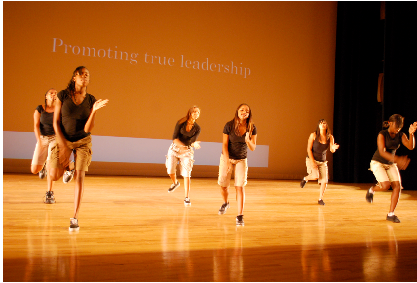
Fig. 3 Centennial High School students perform step dance at UCLA symposium.

What, one might ask, does educational attainment have to do with ArtsBridge? While each ArtsBridge program site is distinctive, every ArtsBridge Program in the University of California system is held accountable to statewide Student Academic Preparation and Education Partnerships (SAPEP) goals. The SAPEP mission is to: