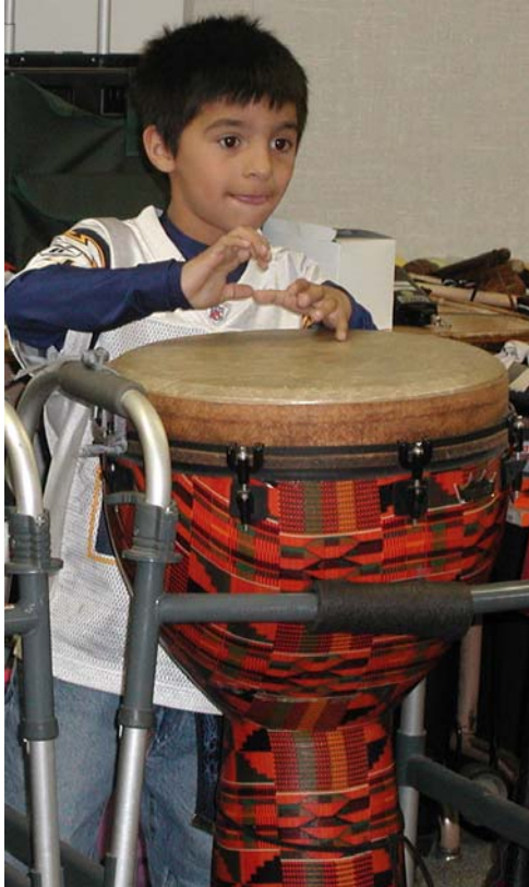
1: Second grade student at Freese Elementary, learning drumming and percussion.

The U.S.-Mexico Border Region, as defined by the 1983 La Paz Agreement, is the area within 100 kilometers (about 62.5 miles) on either side of the international border. Extending 1,952 miles, from the Gulf of Mexico to the Pacific Ocean, this region has in recent years been subject to explosive population growth (from 6.9 million in 1980 to 13 million in 2005). News reports focusing on this area have tended to emphasize the political and environmental challenges associated with rapid demographic and economic change. However, there are success stories as well. This article focuses on Freese Elementary School, where the Mapping the Beat lessons sponsored by National Geographic were first implemented. This is a school that has used the arts to create many bridges among ethnic groups in a volatile corner of San Diego.