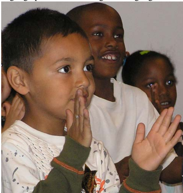
10: Freese kindergartners engaged in a clapping based puppetry warm up exercise.

The puppetry workshops incorporated both the California Theatre Standards and oral language portion of the English Language Arts Standards. However, since hand puppets are