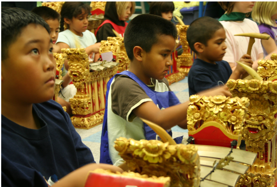
Figure 1: gamelan class at the Museum School.

Because of this unusual circumstance—the Museum School being home to one of the few Balinese performing groups for children in the United States—Bali seemed the natural focus for the organology inquiry project at this school. Each of the students in the organology workshop had from 1 to 9 trimesters of experience in learning to play Balinese gamelan gong angklung . As will be seen, this experience informed other aspects of their learning. The goal of the researcher was to connect the experiential and implicit knowledge students had gained through their musical studies with their current geographic and cultural studies.