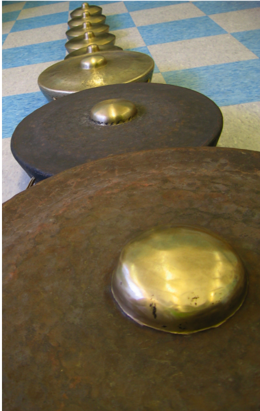
Figure 5: Colotomic gongs arranged from large to small exemplify the uniform appearance of gamelan instruments.

instruments, the Balinese must value “working together in a large group” and “looking the same.”