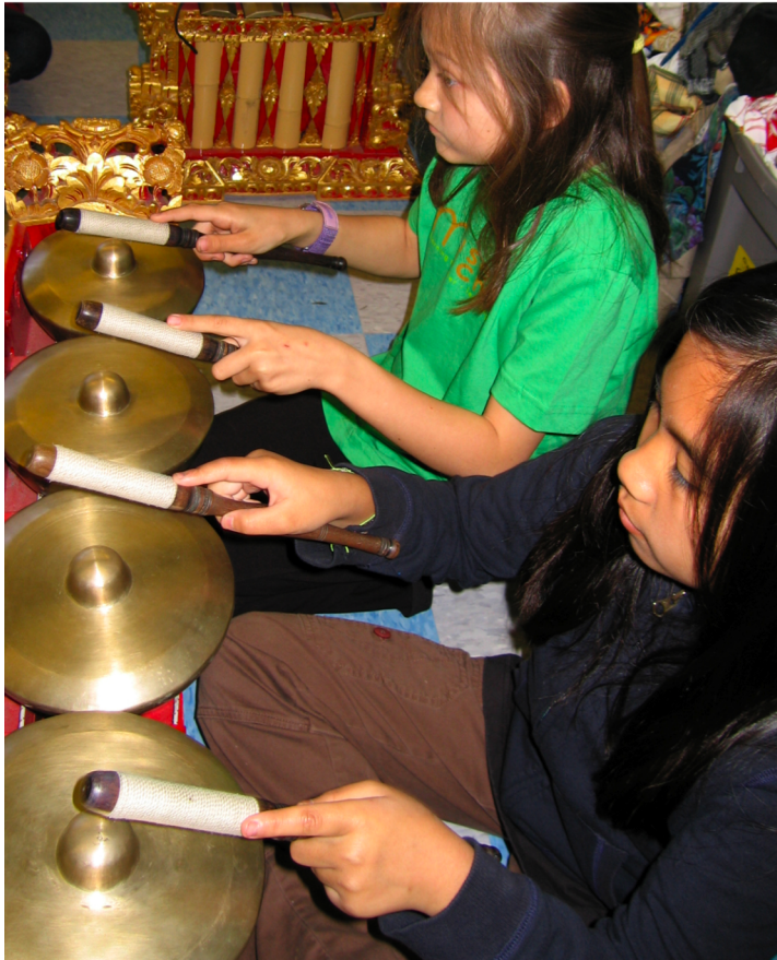
Figure 7: Two students play interlocking kotek on the reyong .

pointing out that ensembles are led by aural cues from a drummer, who in turn is often interacting with a dancer or a group of dancers.