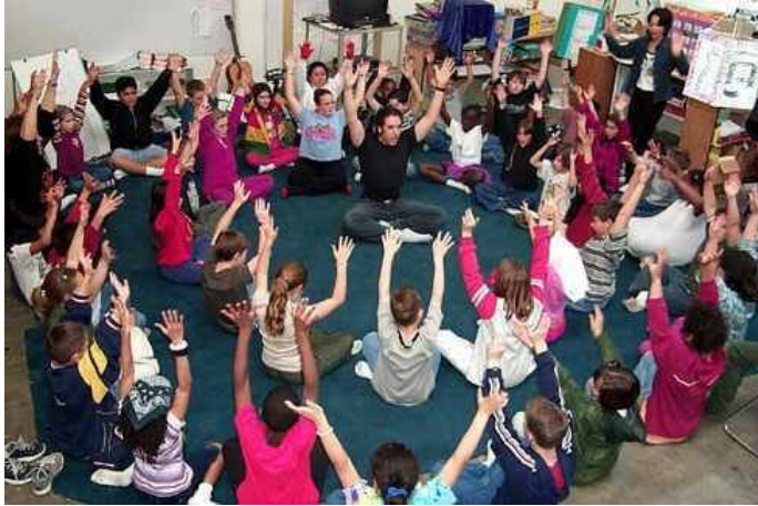
Figure 4: Museum School students practice kecak .

is rich in sound. At this point, the researcher again challenged the students, hypothesizing that the Balinese environment might be particularly quiet, with no loud animals or insects. Therefore, the Balinese felt as though they needed to fill this “empty space” with musical sounds.