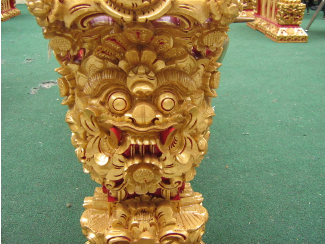
Figure 3: Carving on an instrument featuring floral patterns, a mythical animal, and warm, bright colors.

floral patterns, as well as occasional animals, both mythical and common. Students argued that Bali must be in the tropics, because the flora and fauna featured on the instruments reminded them of jungle scenes. Further, the students suggested that Bali must be warm, because of the “warm colors” used to paint the instruments.