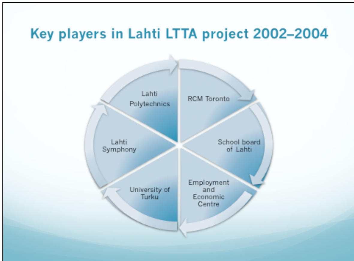
Figure 2. Key players of the LTTA-project in Lahti

When told about the idea of LTTA, the school board of Lahti was willing to give space for the Finnish–Canadian experiment and to pay the wages of substitute teachers who would be needed during the course. The actual training was to be based on two equally important modules: