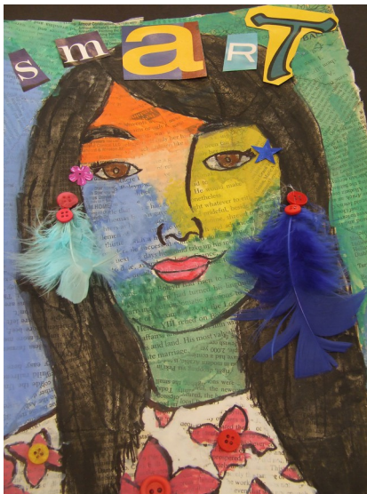
Figures 7 and 8. The Artist in Me. Fifth graders playfully express themselves through collage portraiture.