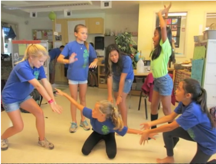
Figure 1. Example of a Collaborative Residency with a STEAM focus. Fifth grade dancers explore how wind energy is transferred for human use by choreographing the actions of a turbine and the movement of wind.

As a result of these collaborations, one fourth grade teacher and his teaching artist partner created a unit of study on the earth's fast and slow processes of change. Students used a variety of dance strategies to explore the earth's structure, plate tectonics, land formation and erosion. Fourth graders made connections between science and culture as they interpreted art depicting Pele, the goddess of volcanoes and made inferences that informed their movement. Across the hall, a third grade teacher and her partner developed a unit to explore the coral reef habitat, the adaptive behaviors of the animals that live there, and the impact of human activity on the reef ecosystem. The class worked together to create a coral reef mural using oil pastels and collage. In another classroom, a fifth grade teacher wanted to learn more about how to teach abstract movement with advanced choreographic principles. She and her teaching artist partner co-planned and co-taught a semester long inquiry: How does wind energy transform? Students engaged in experiments, field-based explorations, expert interviews, science notebooks, creative movement improvisation, and dance choreography (Figure 1) to build complex understandings.