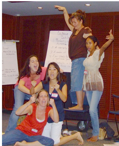
Figure 2. Professional development at the Maui Arts and Cultural Center. Pomaika‘i teachers learn drama strategies by becoming actors themselves. On the chart behind them, they have listed criteria for a quality tableau.

On any given day, in any given classroom, teachers are implementing what they have learned through professional development. The school administration expects all teachers, from novice to veteran, to integrate drama using tableaux and pantomime (Figure 2), and some even go further to engage students in dramatic structures of role-play. Teachers typically integrate drama with literacy and language arts, challenging students to interpret characters and conflicts by prompting them to interpret the text with their bodies. They focus on dual objectives – high quality artistic expression, paired with understanding in a content area.