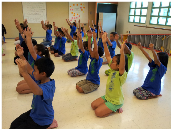
Figure 5. Traditional Hawaiian arts. Second graders learn a hula noho (sitting hula).

The kumu (Hawaiian teacher) focuses on the culture, language, history, people, and place all through traditional Hawaiian art forms. For example, when children are learning about the rain cycle, they might learn an oli (chant) about the various rains on the island of Maui. When they are learning the history of Hawai'i, students might practice Kawika , a hula kahiko (ancient hula) honoring Kalākaua, Hawaii's last reigning king. When they study the purpose of rules in society, they might learn the mo'olelo (story) of how the demigod Maui stole the calabash of winds and destroyed a village. At Pomaika'i, students learn traditional arts such as oli, hula, and mo'olelo alongside the creative arts (Figure 5).