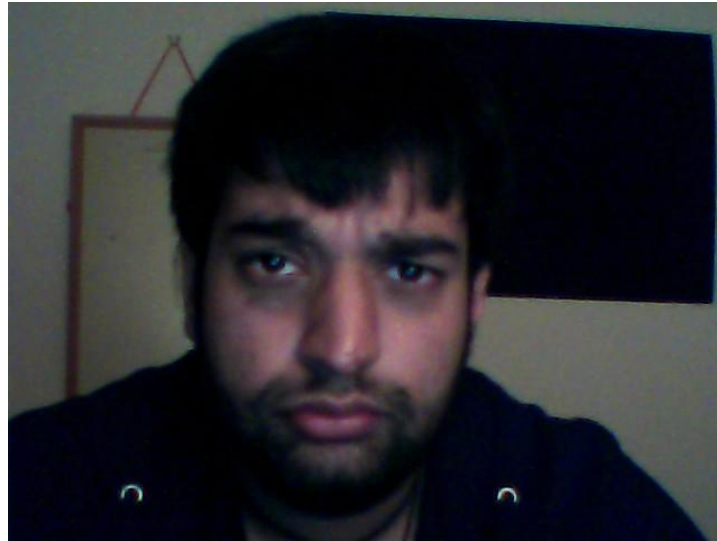
Fig 2. Screenshot from Side Effects Include...

comparable to videos that are released by suicide bombers after an attack where they explain their actions, usually citing disillusionment with Western society. Similarly, the character in my film is disillusioned with life as a medical student.