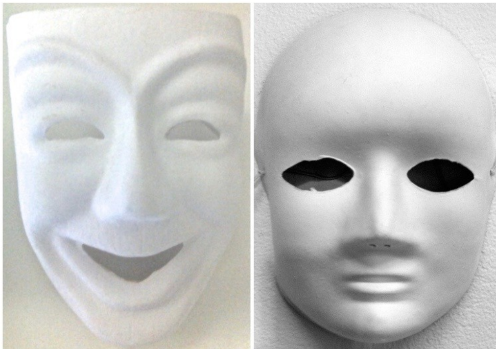
Figure 3 White masks used in workshop

Each section connected theater practitioners to practice in order to contextualize the activities. There was an individual mask for each participant. Participants chose the mask they wished from two choices, a white comedy or white neutral mask. Masks were the same size and material.