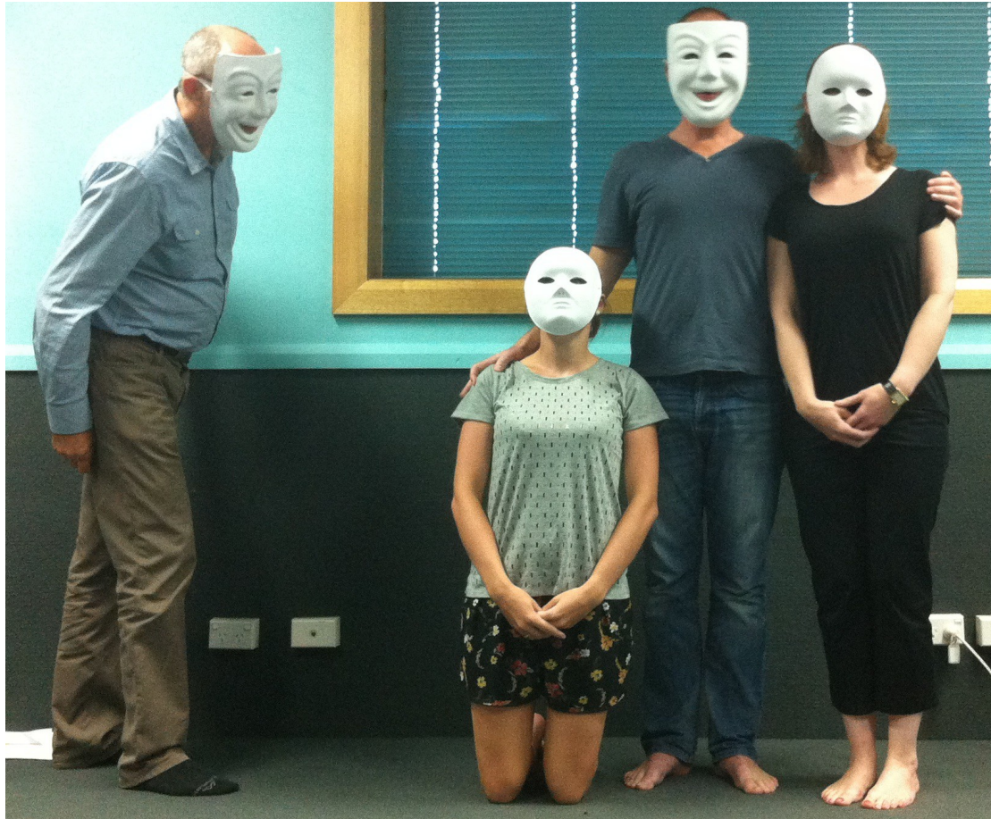
Figure 5 Tableaux Workshop

The workshop participants finished their rehearsals and performed their tableaux to the other participants. After each performance, the group discussed the meanings intended by the group and the semiotics of performance that as interpreted by the audience. This included the images of the masks used and the heights and gender (when observable) of the participants.