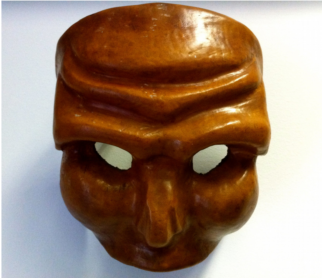
Figure 2 Handmade Commedia dell'Arte Mask (Leather)