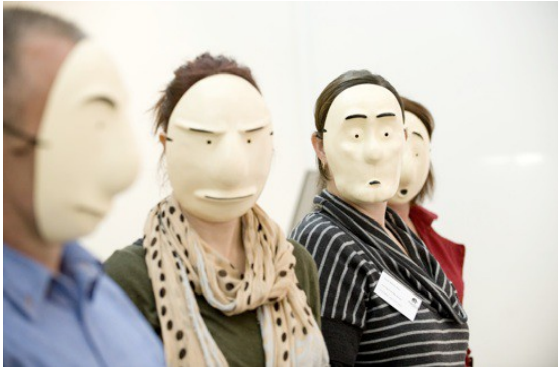
Figure 4 Communicating Without Words Activity

The audience and the performers were clear in their understanding of isolation and bullying communicated through simple movements. Linking to Asia, Decroux, Copeau and Lecoq (Hodge, 2010), the groups explored how a scenario can be enacted, then re-rehearsed with masks, and finally, without masks. This was to explore how the middle section of rehearsal, with masks, changed and simplified the movements and gestures to become clearer and bolder and thus give purpose and impact.