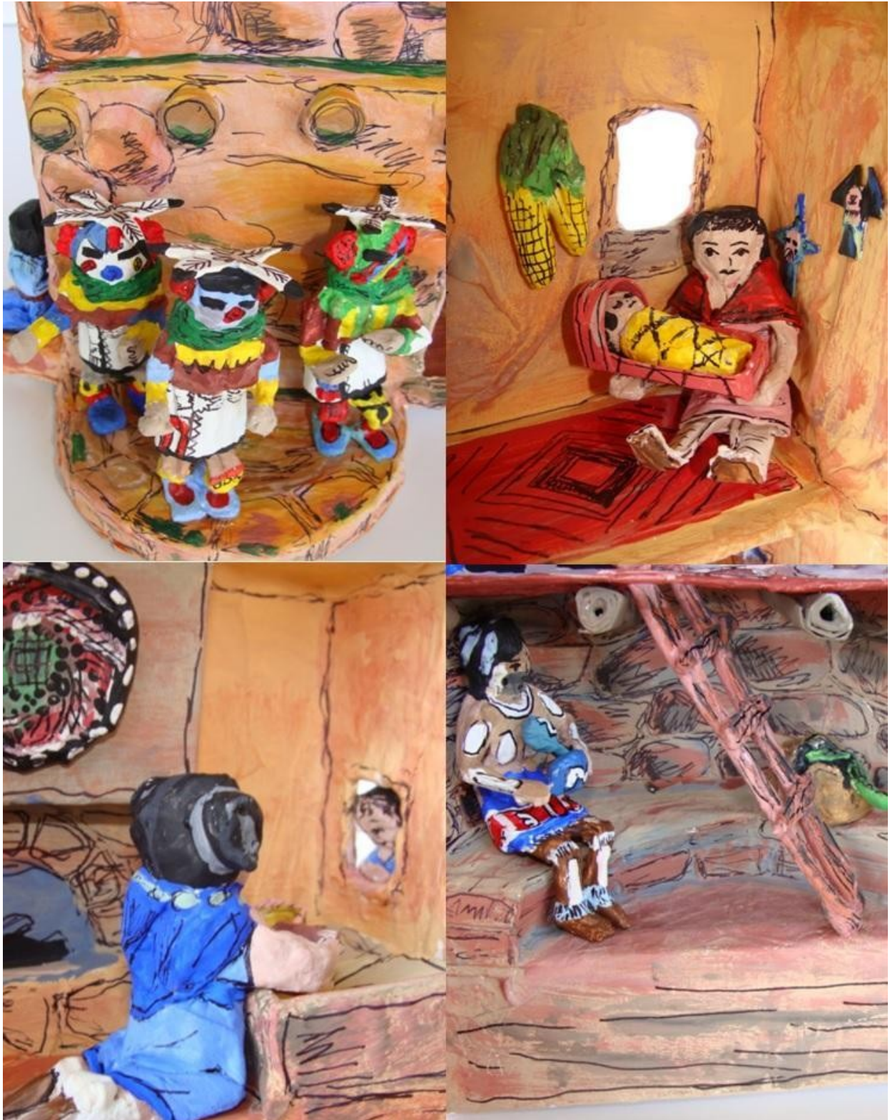
Corn-related Scenes from the Diorama