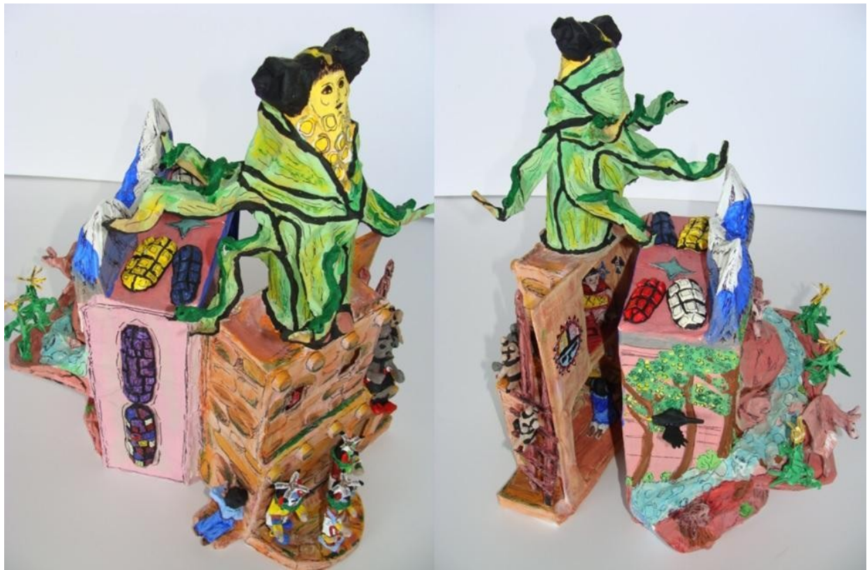
Two Views of the Completed Diorama with the Corn Maiden on Top

Figure 2 shows four close-up scenes from the diorama. The top left view shows three corn kachinas dancing; the top right scene is a mother with her newborn baby, accompanied by the two perfect ears of corn representing Mother and Father Corn drying on the wall; in the bottom left scene, a girl of marriageable age grinds corn while a suitor talks to her through a window; finally, the bottom right scene shows the Antelope Priest in the kiva preparing for the snake dance ceremony to bring rain to the corn.